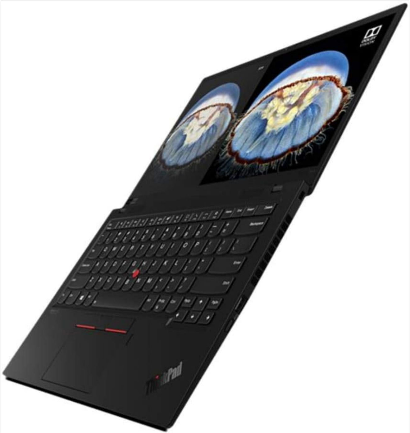
Figure 4: The ThinkPad X1 Carbon keyboard and touchpad.