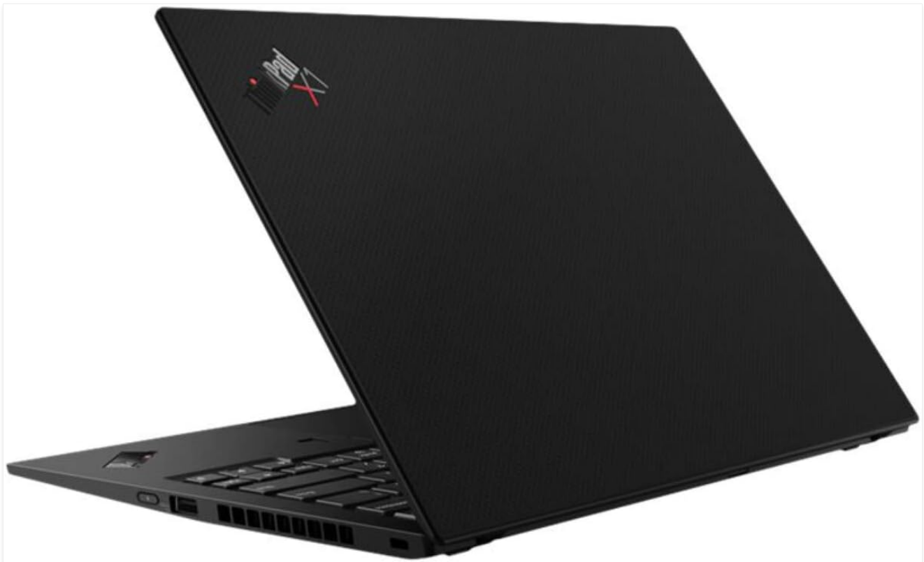
Figure 6: Rear view of the ThinkPad X1 Carbon, highlighting its slim profile.