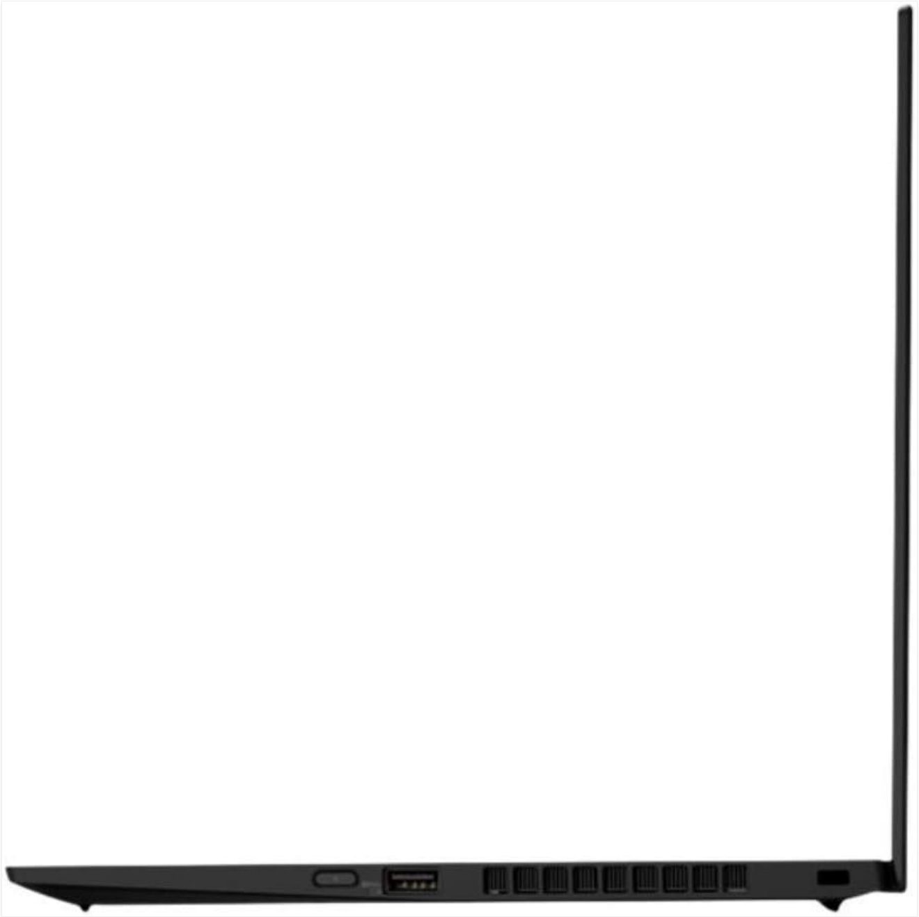
Figure 3: Right side ports, including USB-A and HDMI, along with the power button.