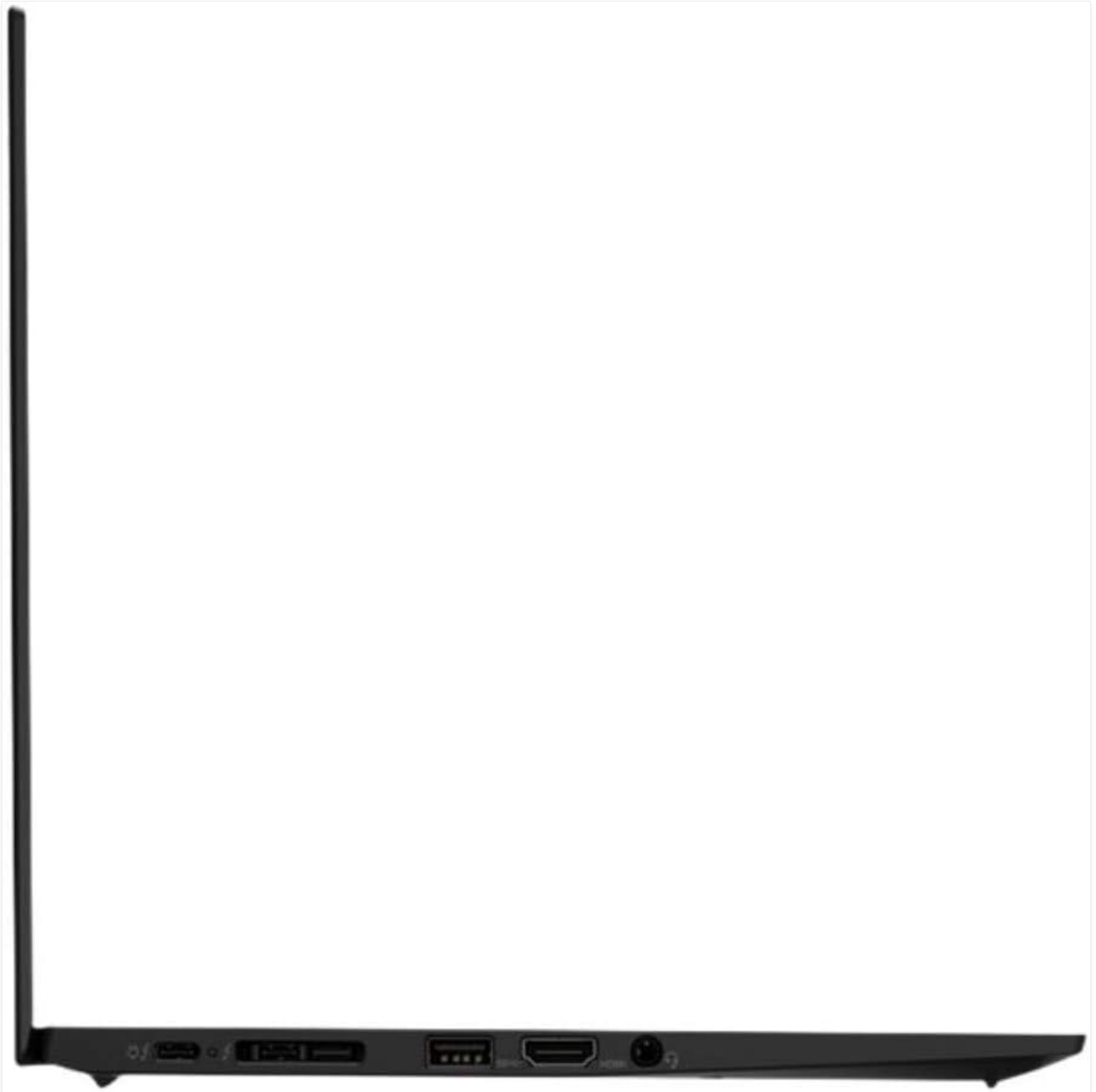
Figure 2: Left side ports, including USB-C Thunderbolt 3 ports.