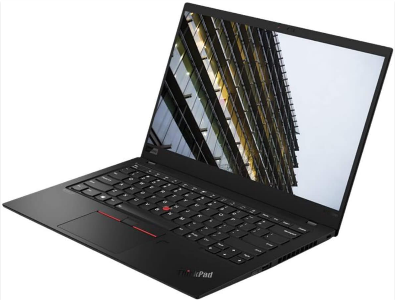
Figure 1: The Lenovo ThinkPad X1 Carbon, showcasing its sleek design and display.