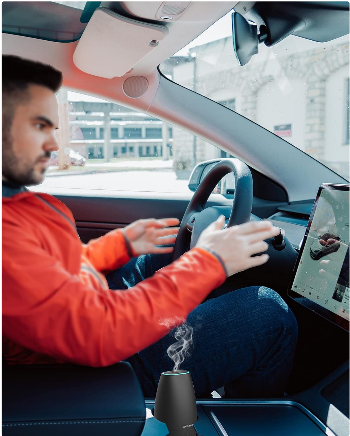
Image: The SOICARE diffuser positioned in a car's cup holder, actively diffusing essential oils.