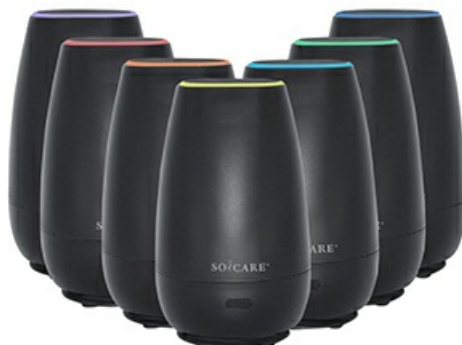
Image: A display of several diffusers showcasing the variety of LED light colors available.

Image: An overview of the diffuser's user-friendly design, highlighting its color options, single button control, dual switches, and integrated USB cable.