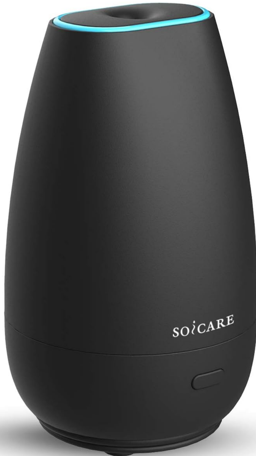
Image: The SOICARE Car Essential Oil Diffuser in elegant black, showcasing its sleek design.