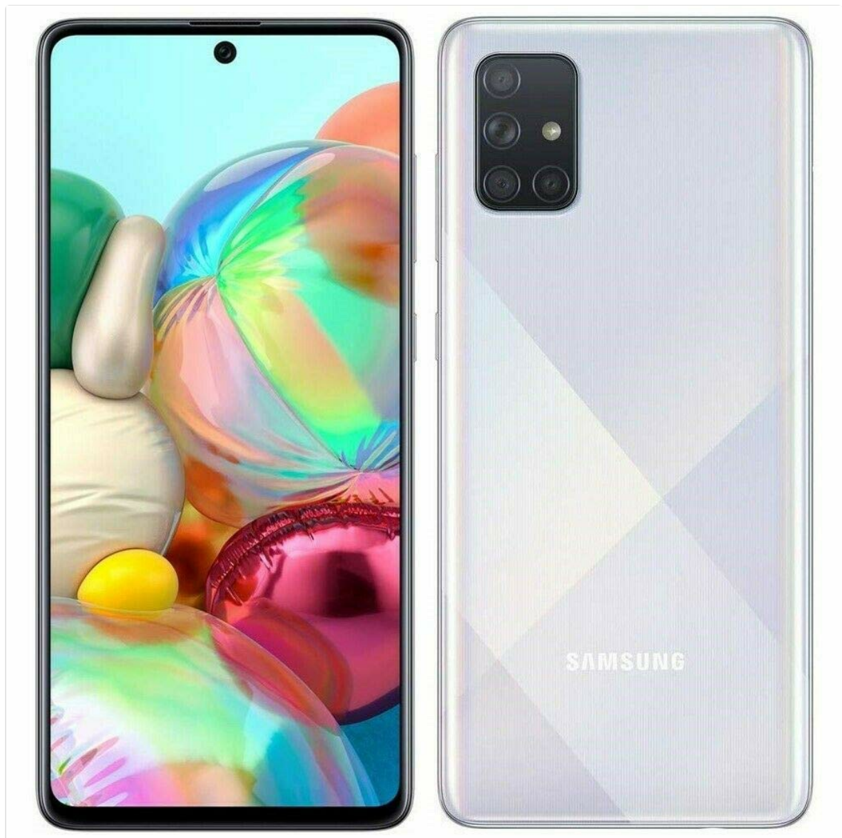
Image 2.1: Front view of the Samsung Galaxy A71, showing the display and front camera.