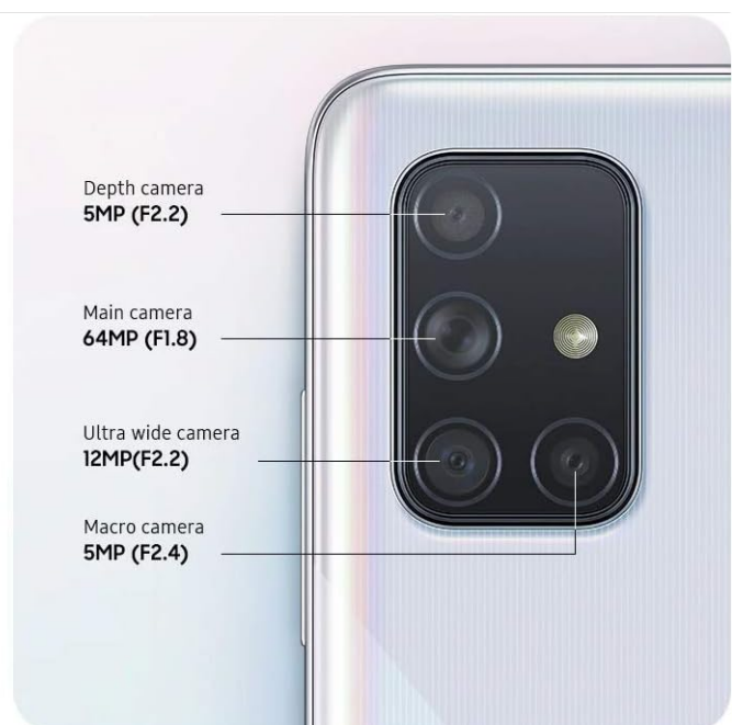
Image 2.2: Back view of the Samsung Galaxy A71, highlighting the quad camera module and Samsung branding.

Whether the moment calls for a close-up, an ultra-wide shot, a nighttime photo, or some artistic Bokeh blur, the A71 Quad Cam delivers with pro-level quality and ease. From a 64MP Main Cam to a 123° 12MP Ultra Wide Cam, to a 5MP Macro Cam and 5MP Depth Cam, A71 is ready for any moment.