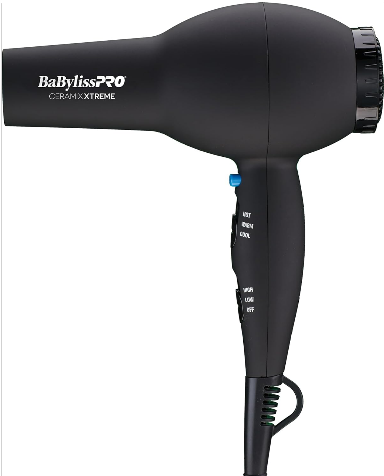
Image: The BaBylissPRO Ceramix Xtreme Hair Dryer shown with its concentrator nozzle attached.