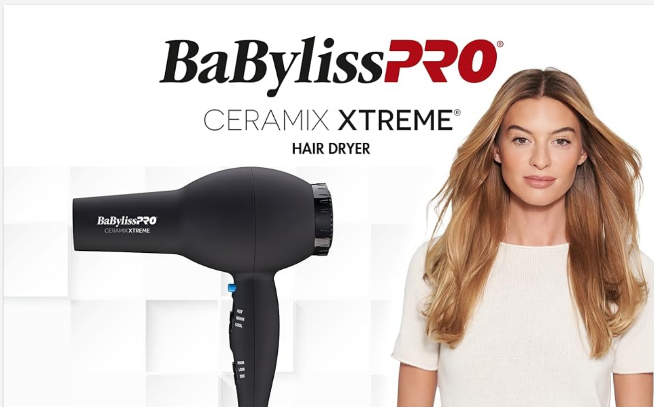
Image: BaBylissPRO Ceramix Xtreme 2000-Watt Hair Dryer, showcasing its sleek black design.