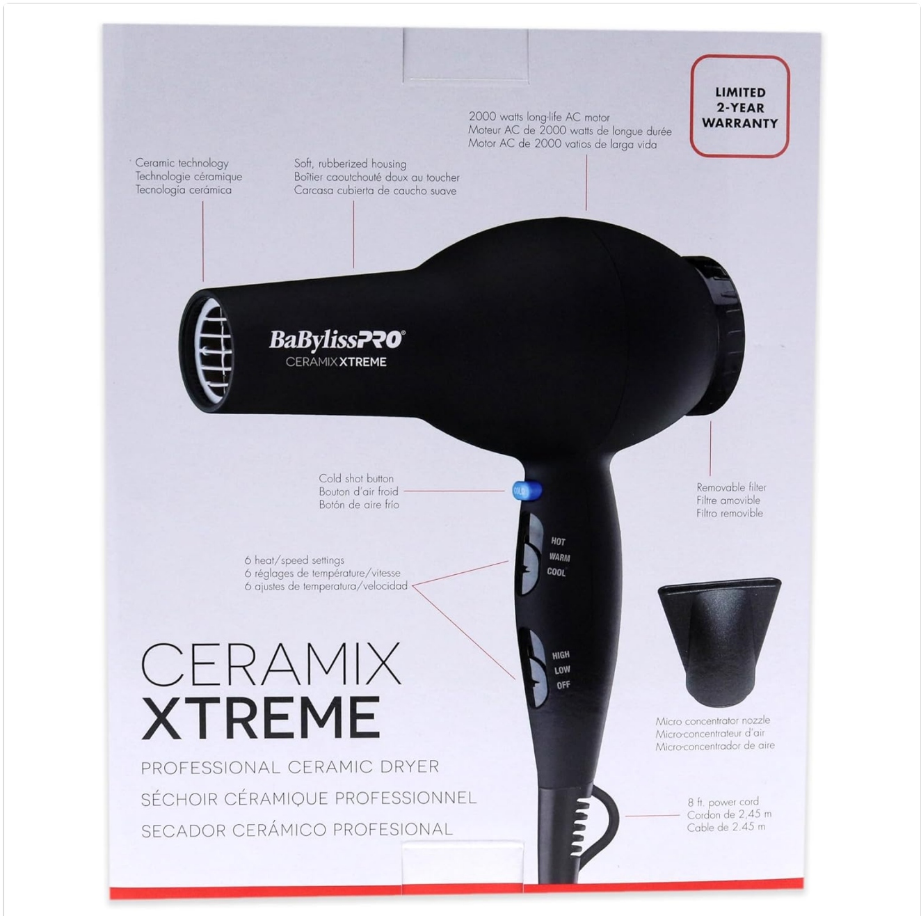
Image: Close-up of the BaBylissPRO Ceramix Xtreme Hair Dryer, indicating its ceramic material.