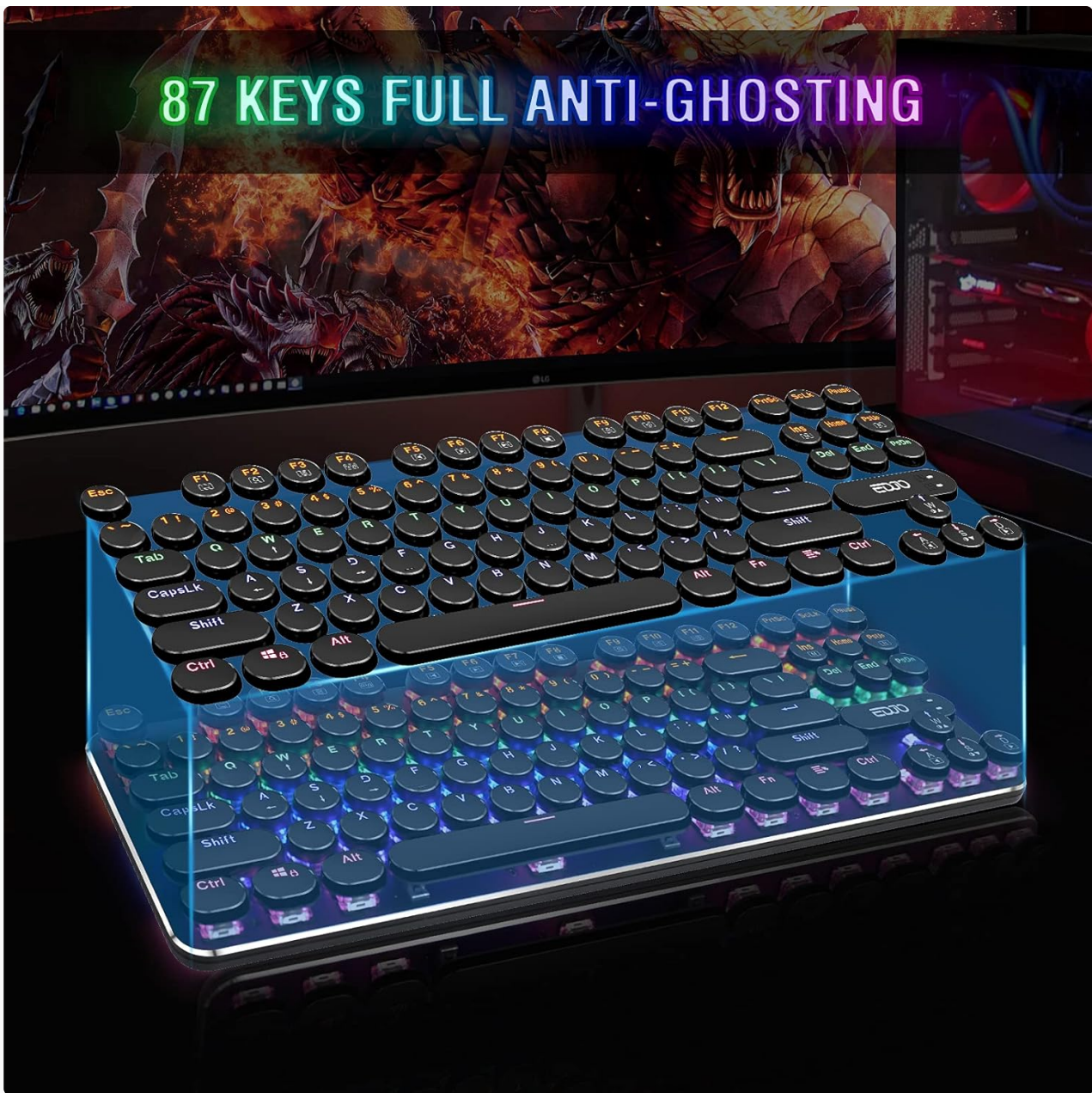
Image: Illustration demonstrating the 87-key full anti-ghosting capability, showing multiple simultaneous key presses being registered.