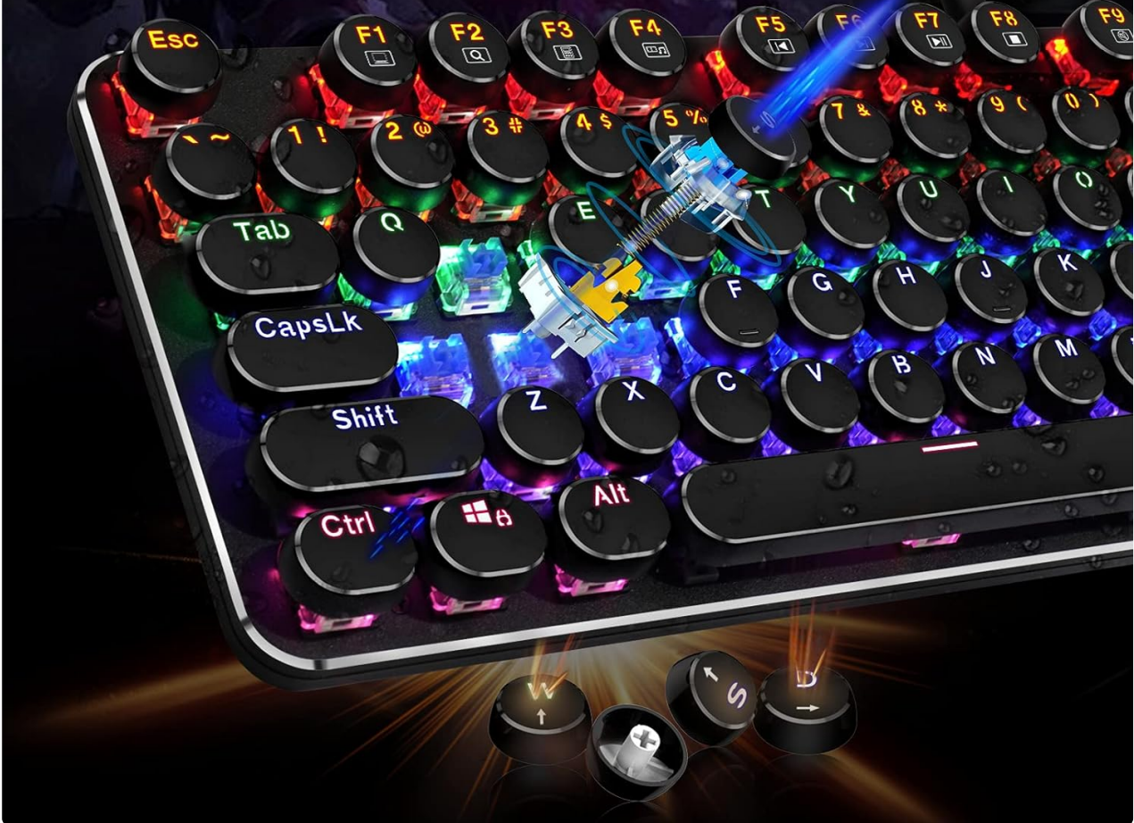
Image: Close-up view of the keyboard, emphasizing features like the aluminum alloy panel, waterproof design, anti-corrosion properties, and removable keycaps.