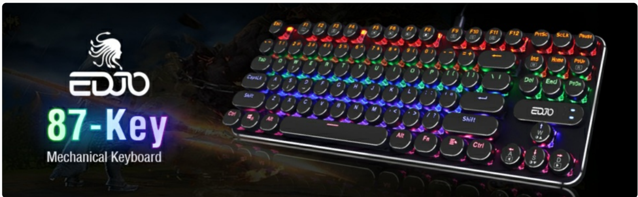
Image: EDJO 87-Key Mechanical Keyboard overview banner.

This manual provides detailed instructions for the EDJO 87-Key Mechanical Gaming Keyboard. Designed for gamers and typists, this keyboard features durable mechanical blue switches, vibrant rainbow LED backlighting, and anti-ghosting technology for a responsive and enjoyable experience.