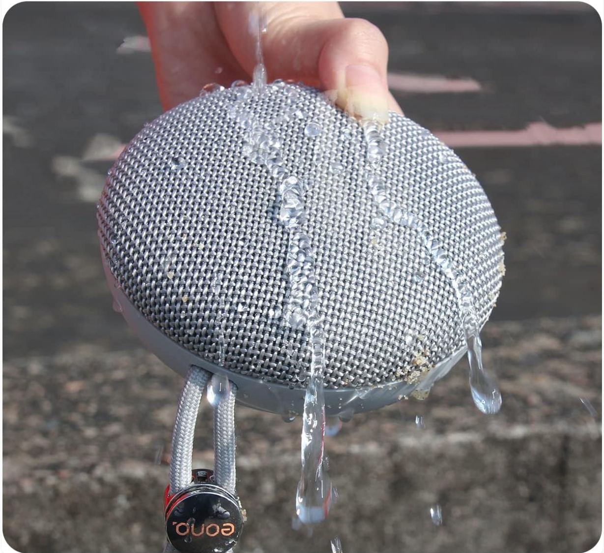
Image: The Eono Eonosound 1 Portable Bluetooth Speaker, showcasing its compact and stylish design.

Even underwater for 30 min, it still works.