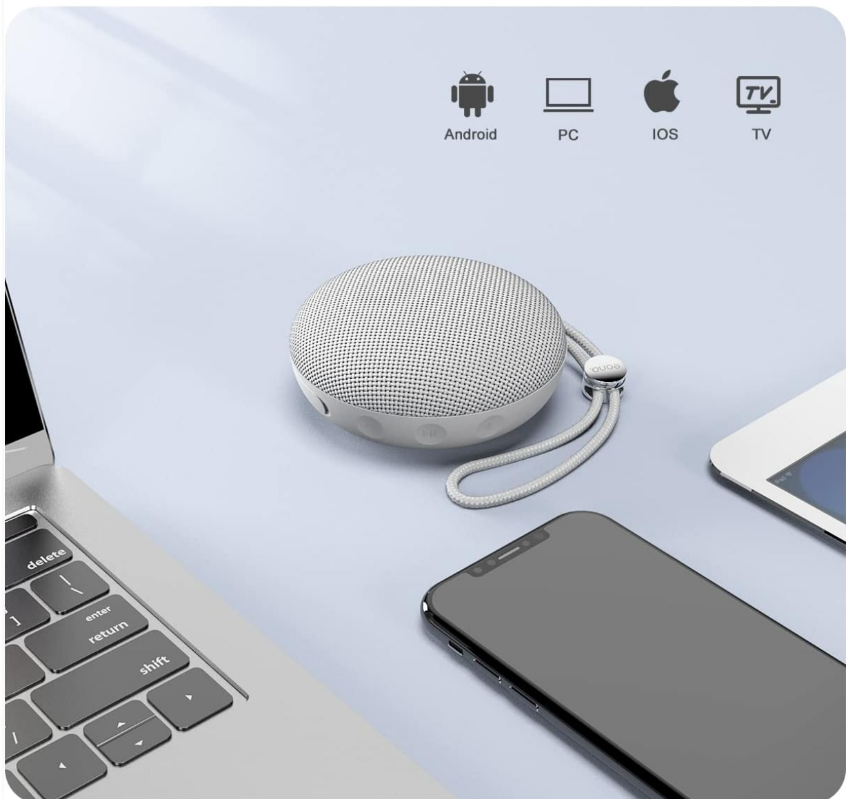
Image: The Eono Eonosound 1 speaker positioned near a laptop, smartphone, and tablet, illustrating its broad compatibility with multiple devices.

Broad compatibility for effortless connectivity with iPhones, iPads, phones, tablets, laptops, PCs, and TVs via BT 5.0+EDR with strong stability.