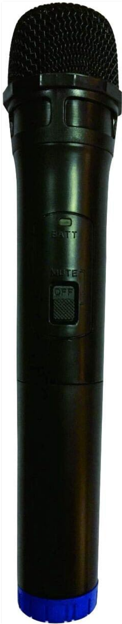
Image: Wireless microphone included with the speaker.