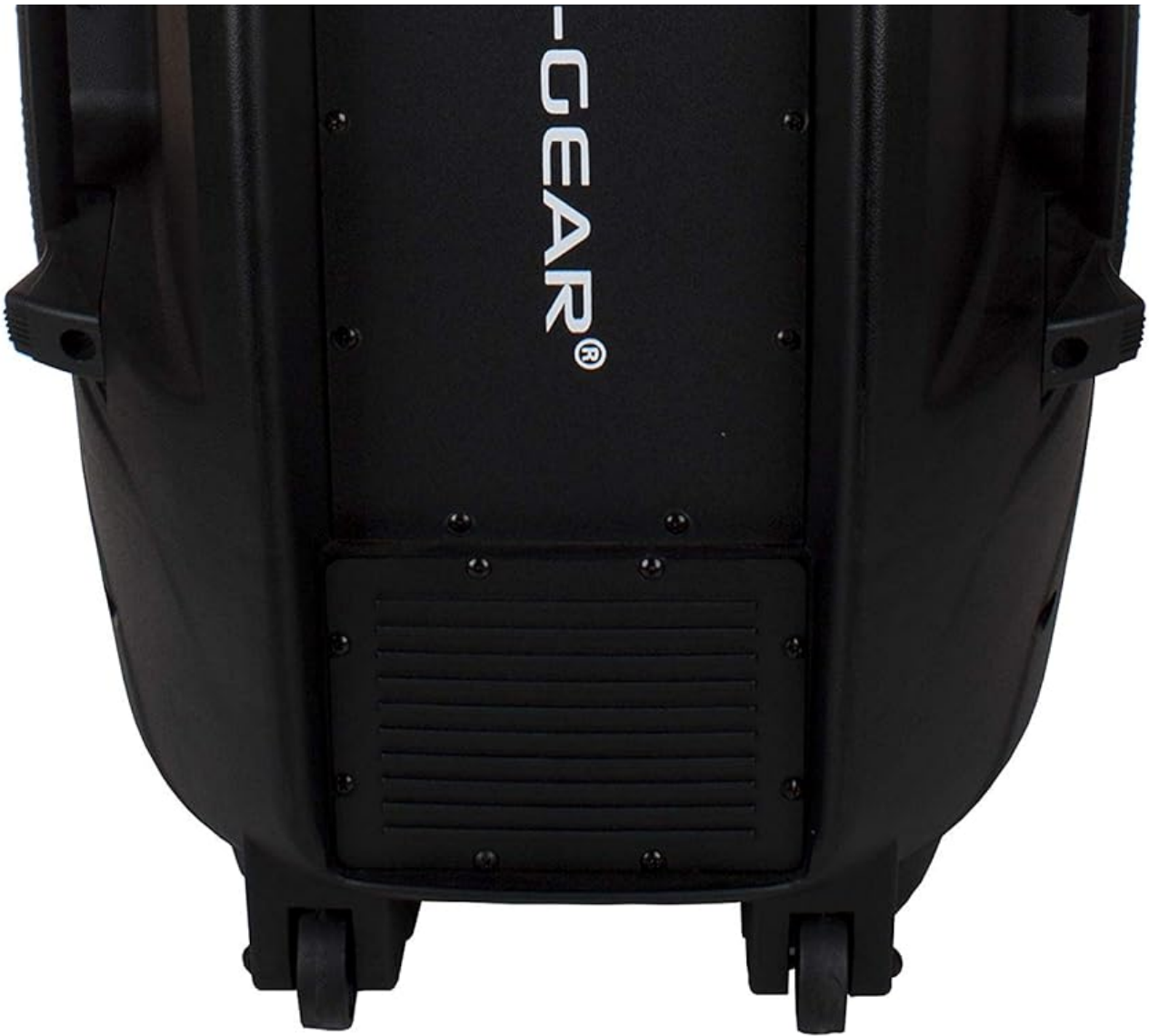
Image: Rear view of the speaker showing the rating label.