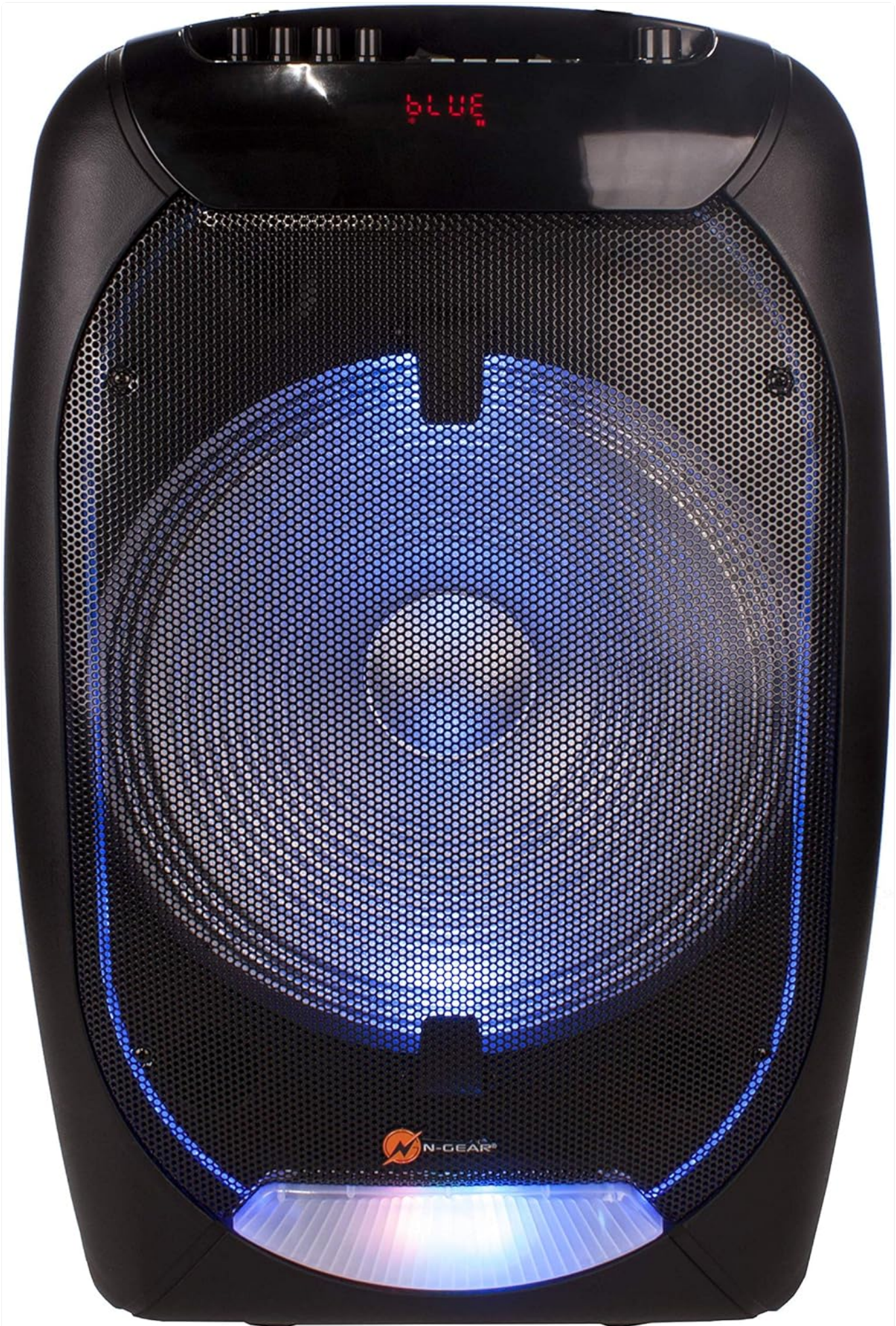
Image: Speaker front with blue LED lights, showing "BLUE" on the display.