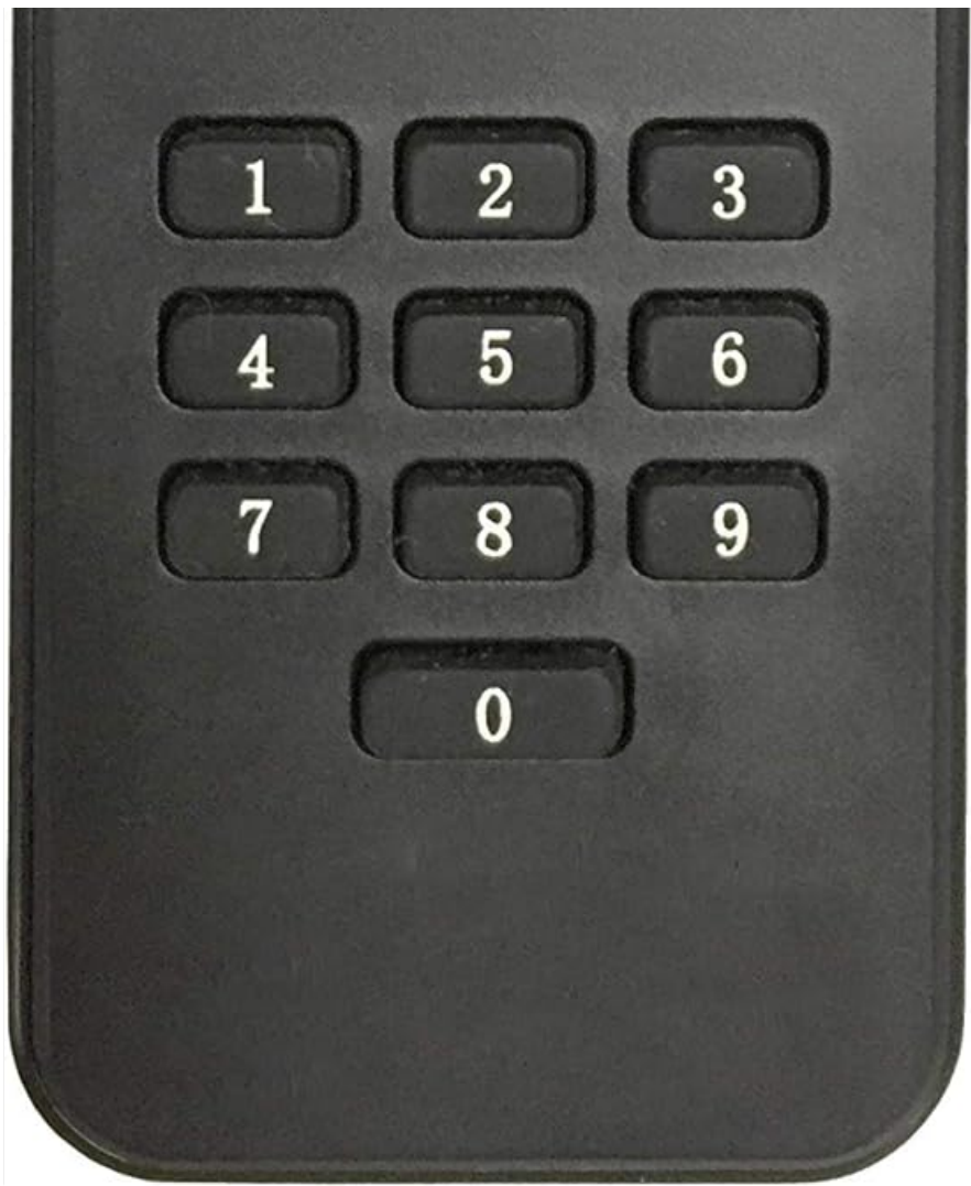
Image: Remote control for the speaker.