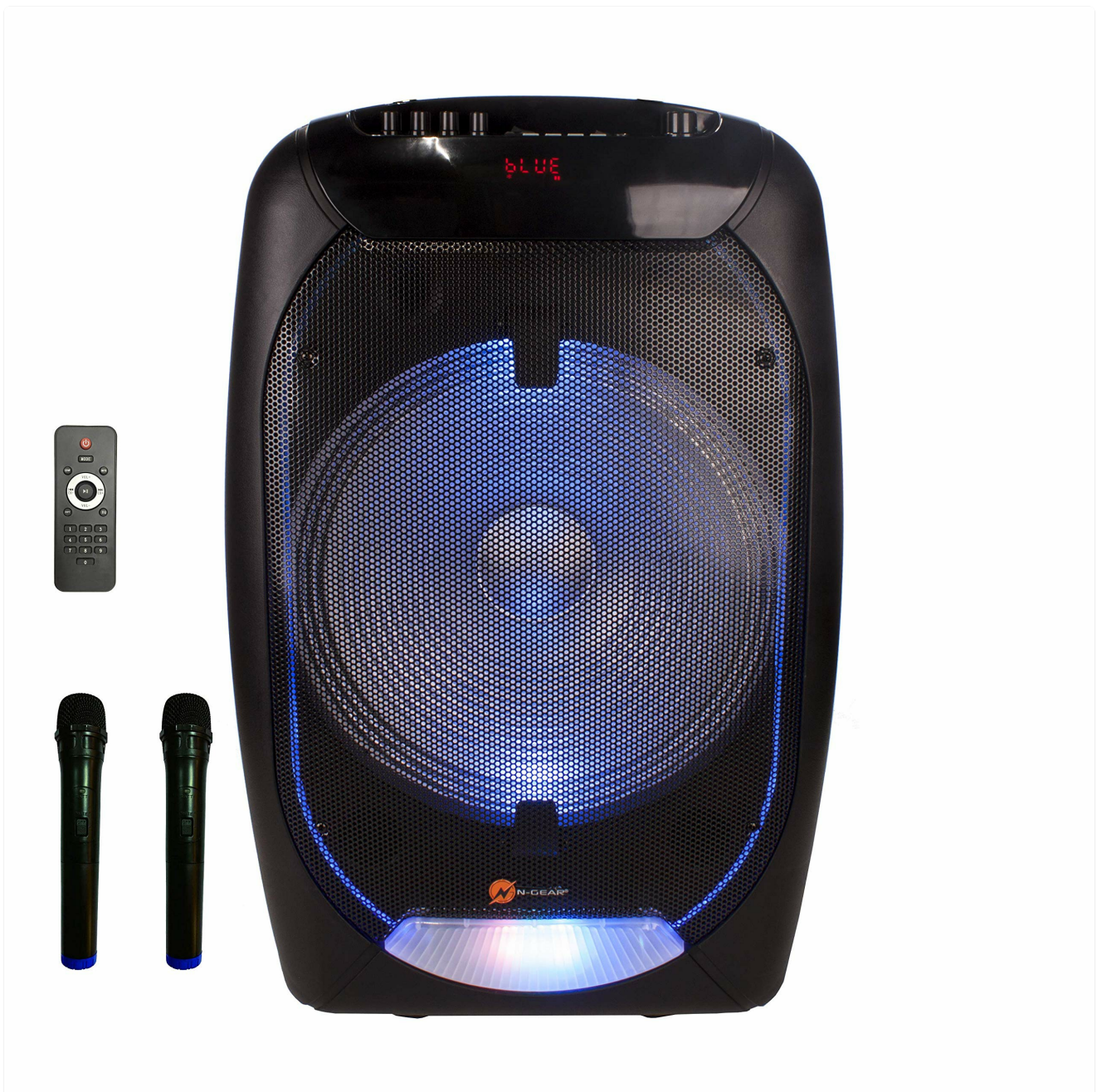
Image: Front view of the speaker trolley with handle extended.

Place the speaker on a stable, flat surface. The trolley design with wheels and a retractable handle allows for easy transport. Ensure adequate ventilation around the speaker.