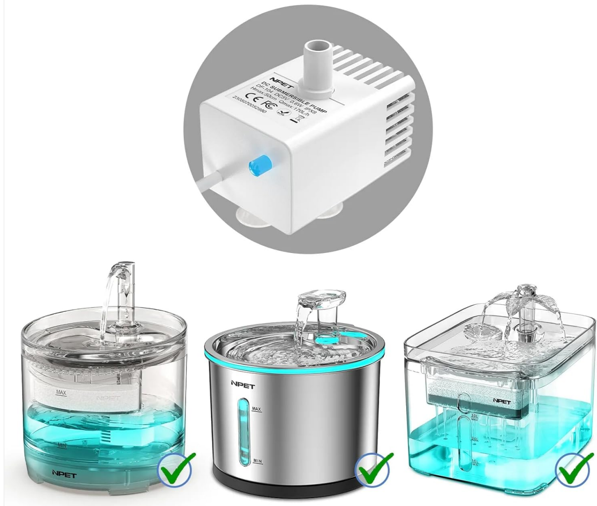
Image 1: The NPET water fountain pump shown with compatible fountain models WF020, WF050, and WF210.