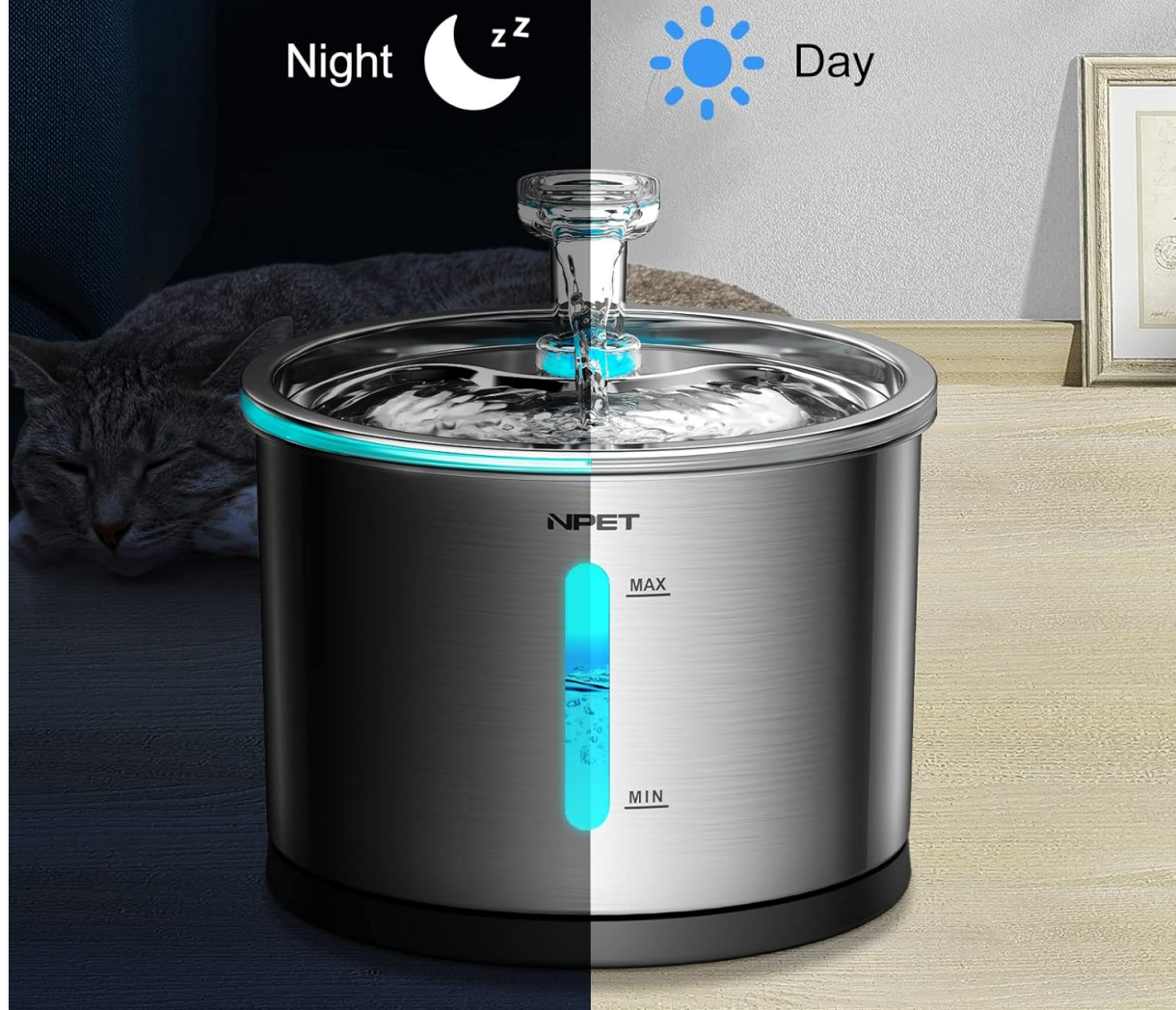
Image 3: The fountain operating with its blue LED light, illustrating its visibility during both day and night.

The pump operates at an ultra-quiet level, typically below 40 dB, ensuring a peaceful environment for both you and your pets.