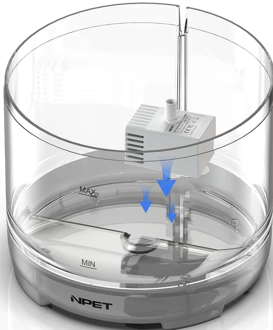
Image 2: The pump being installed into the fountain basin, showing the suction cups securing it to the bottom.