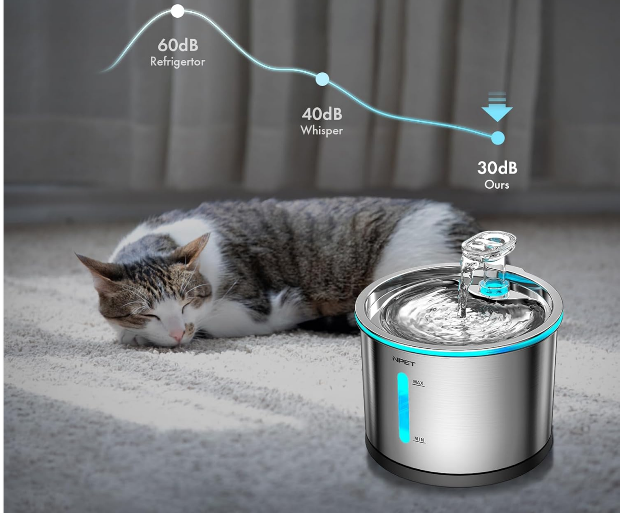
Image 4: A cat resting near a fountain, highlighting the ultra-quiet operation of the pump, which is typically below 40 dB.