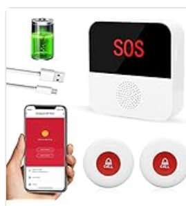
Figure 8: Choose from 5 volume levels to suit your environment.