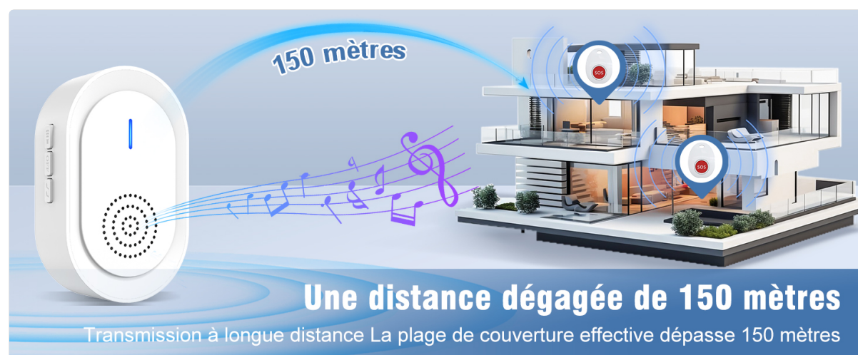
Figure 7: The receiver features adjustable volume and multiple ringtone options.

The receiver offers 5 volume levels (0 dB to 130 dB) and 5 different ringtone types. Use the dedicated volume and music (ringtone selection) buttons on the receiver to cycle through the options and select your preferred settings.