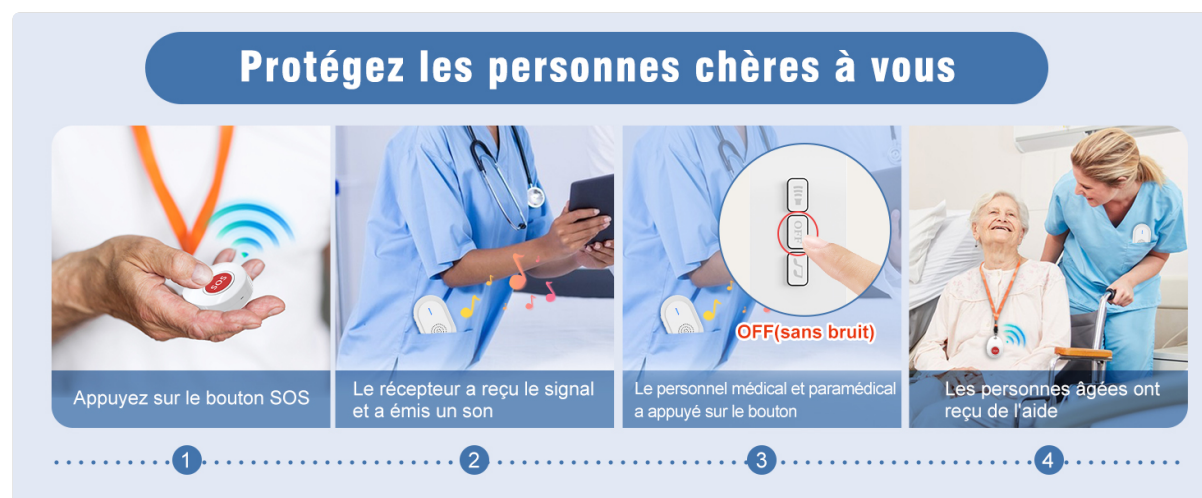
Figure 6: Press the 'OFF' button on the receiver to stop the alarm sound.

If the receiver is alarming and you wish to stop the sound, press the "OFF" button on the side of the receiver. This will silence the alarm without affecting the system's readiness for future alerts.