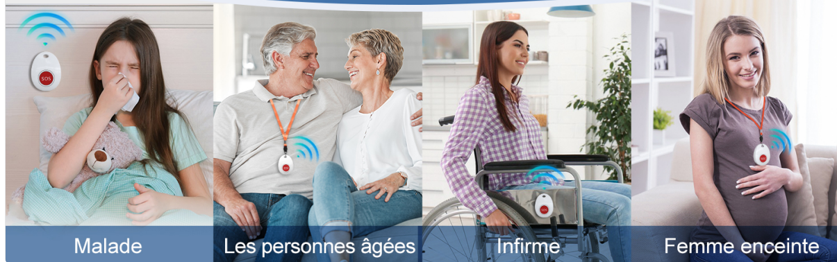
Figure 3: Flexible placement options for the call button and receiver.