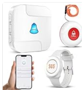
Figure 5: Receiver LED indicators for signal and battery status.