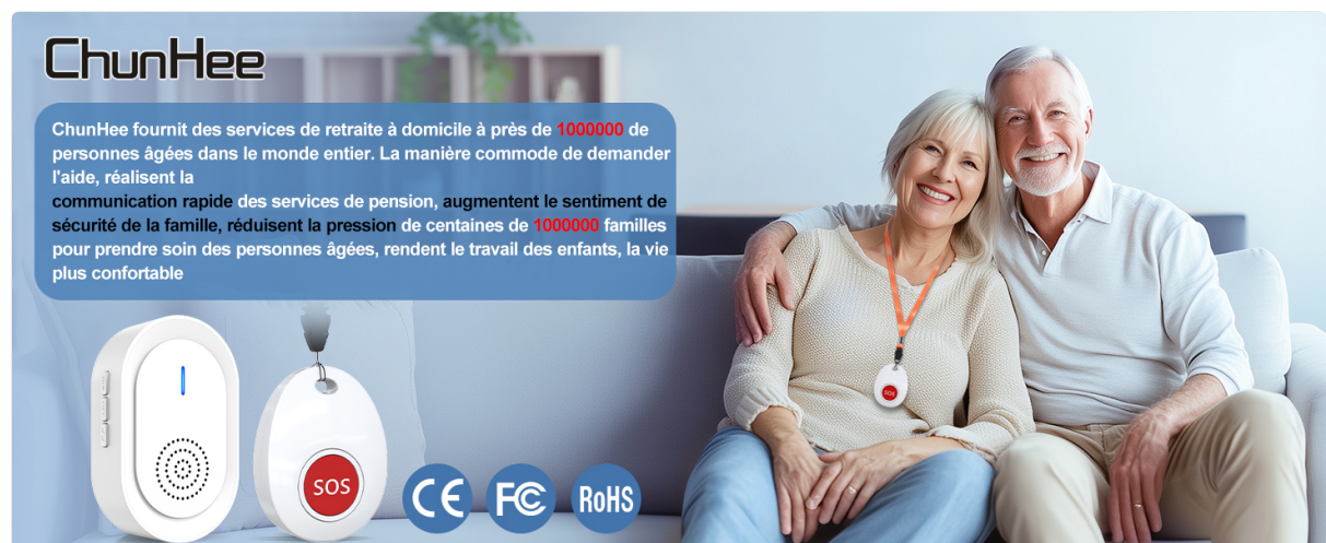
Figure 1: The ChunHee Wireless Call Button system facilitates timely assistance for those in need.

The system includes a portable, rechargeable receiver and a waterproof call button. It features adjustable volume levels and multiple ringtone options to suit various environments and user needs.