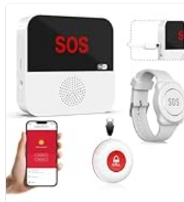
Figure 4: The receiver can be magnetically attached to metal surfaces.