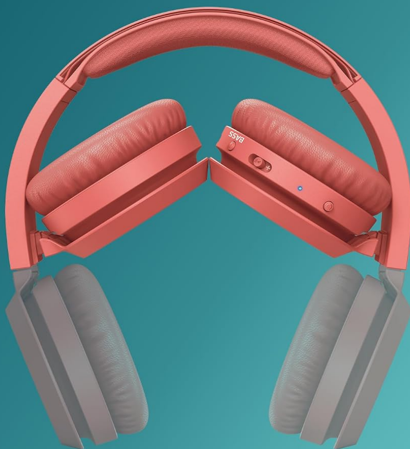
Image 3.4: The headphones shown in their folded position, demonstrating how the earcups swivel inwards for compact storage.