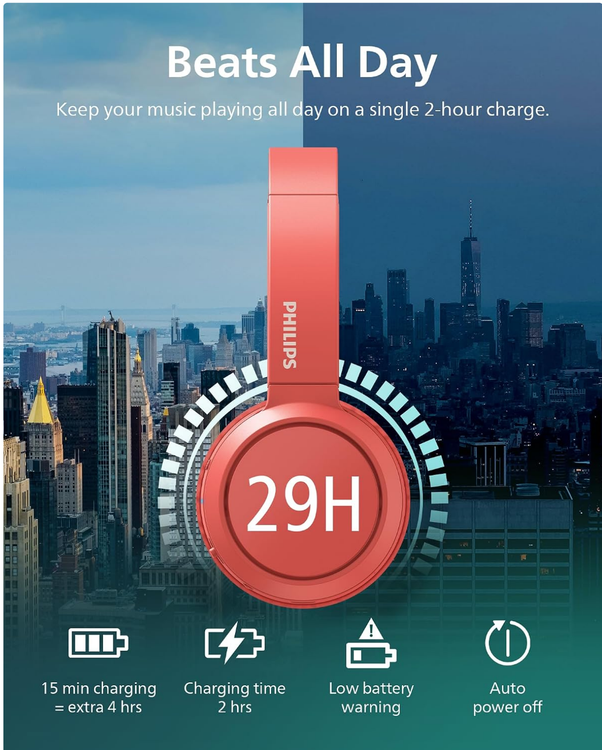
Image 4.1: Visual representation of the charging process and battery life, indicating 29 hours of playback from a 2-hour charge and 8 hours from a 15-minute charge.