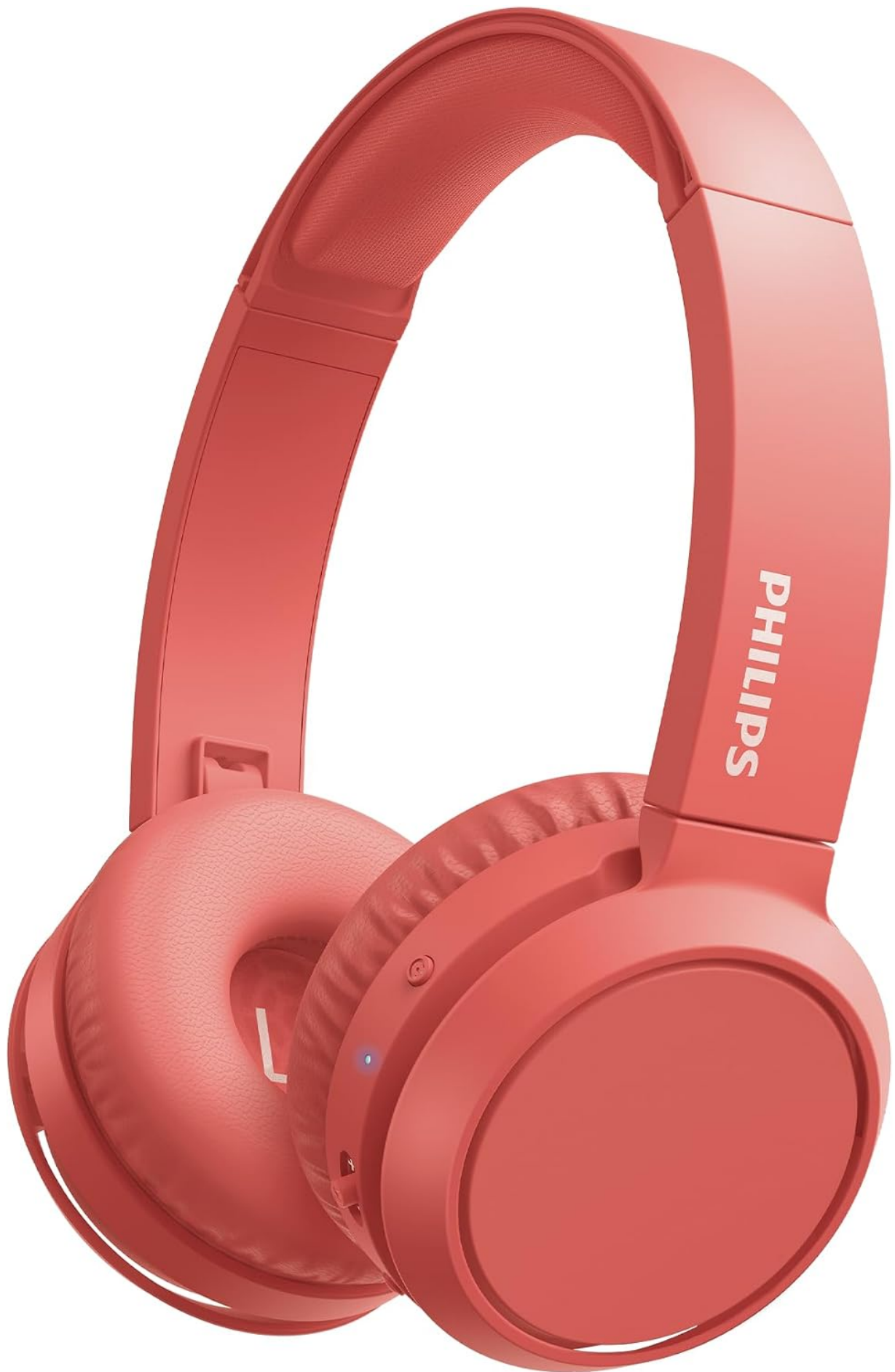
Image 3.1: Front view of the PHILIPS H4205 Wireless Headphones in red. This image displays the overall design, including the adjustable headband and on-ear cups.