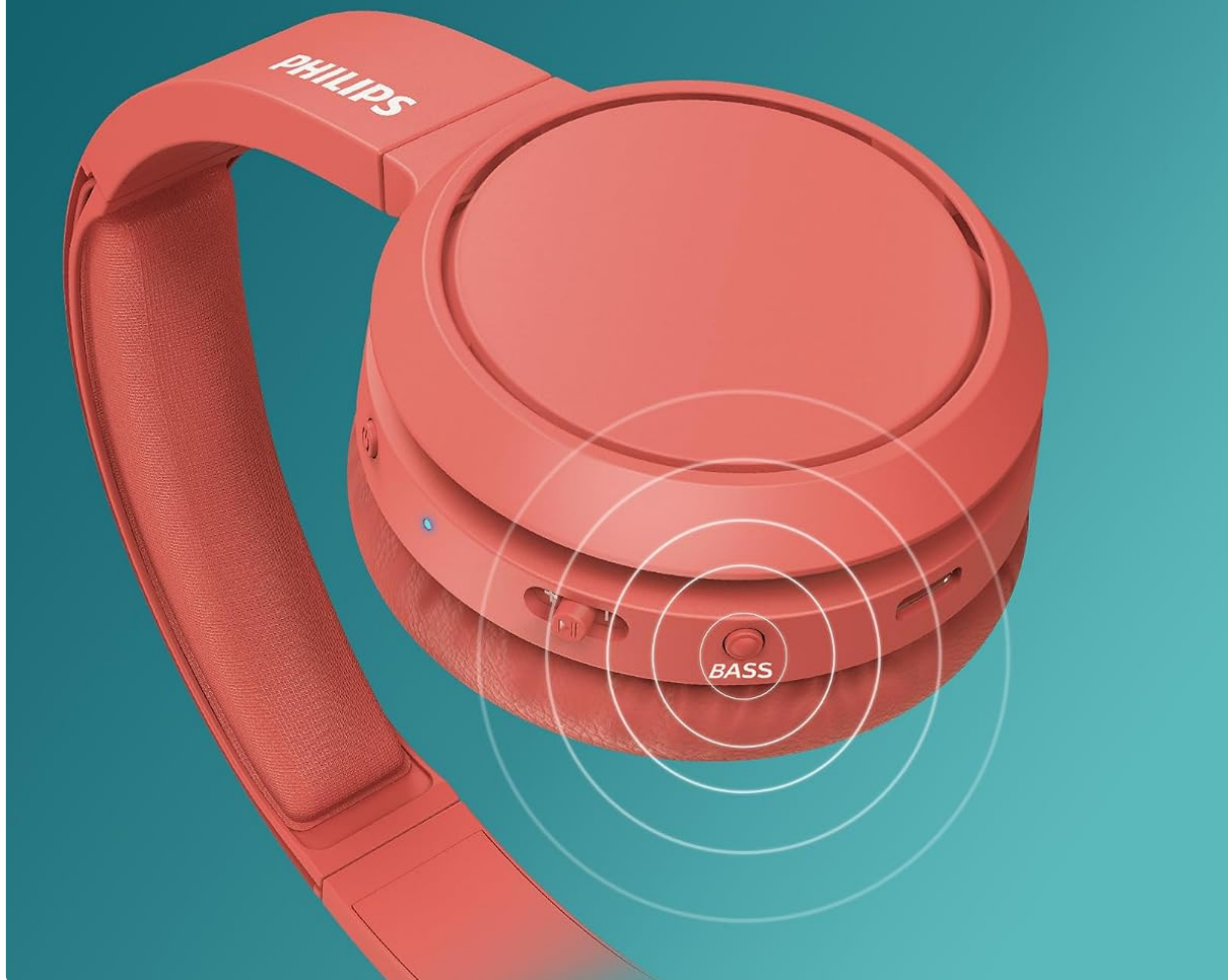
Image 3.3: Detail of the Bass Boost button located on the earcup, allowing users to enhance low-frequency audio.