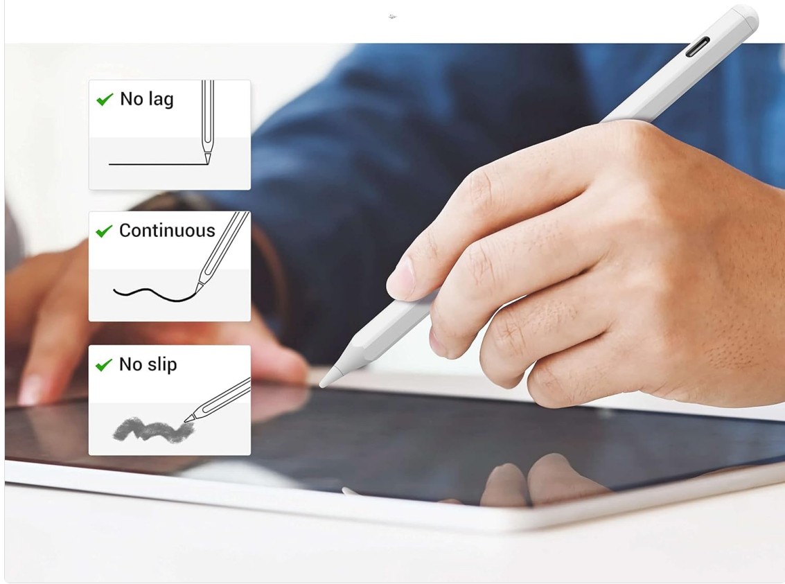
Image: A hand resting on an iPad screen while using the stylus, demonstrating palm rejection.

You can rest your palm on screen when you use this pencil. Smooth drawing with no lag.