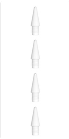
Image: A set of KXT Stylus Pen replacement nibs.