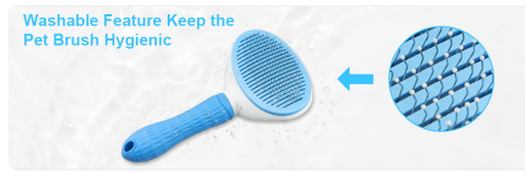
Image: The brush being rinsed under running water, demonstrating its washable feature for hygiene.