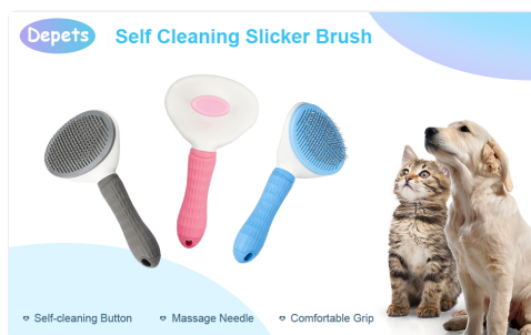
Image: The slicker brush after use, showing collected pet hair on the bristles, ready for removal.