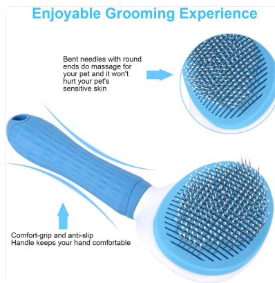
Image: Detail showing the bent needles with round ends for gentle massage and the comfort-grip handle.