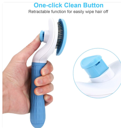
Image: A hand pressing the one-click clean button, illustrating the retractable function for hair removal.