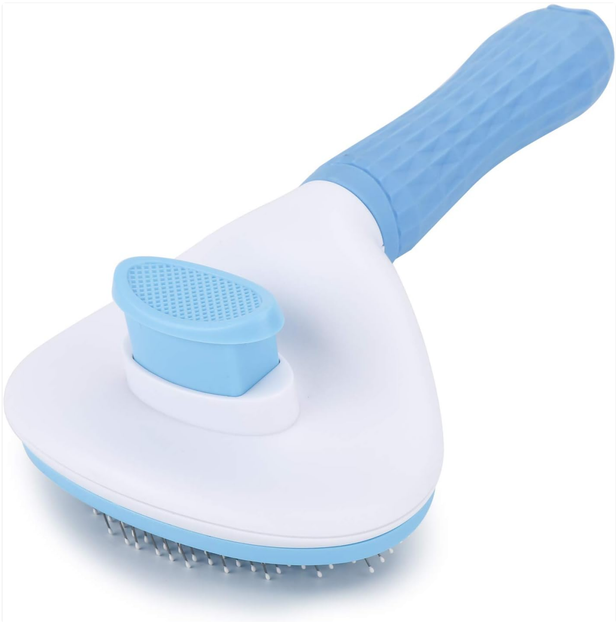
Image: The Depets Self-Cleaning Slicker Brush in blue and white, featuring a comfortable handle and slicker bristles.