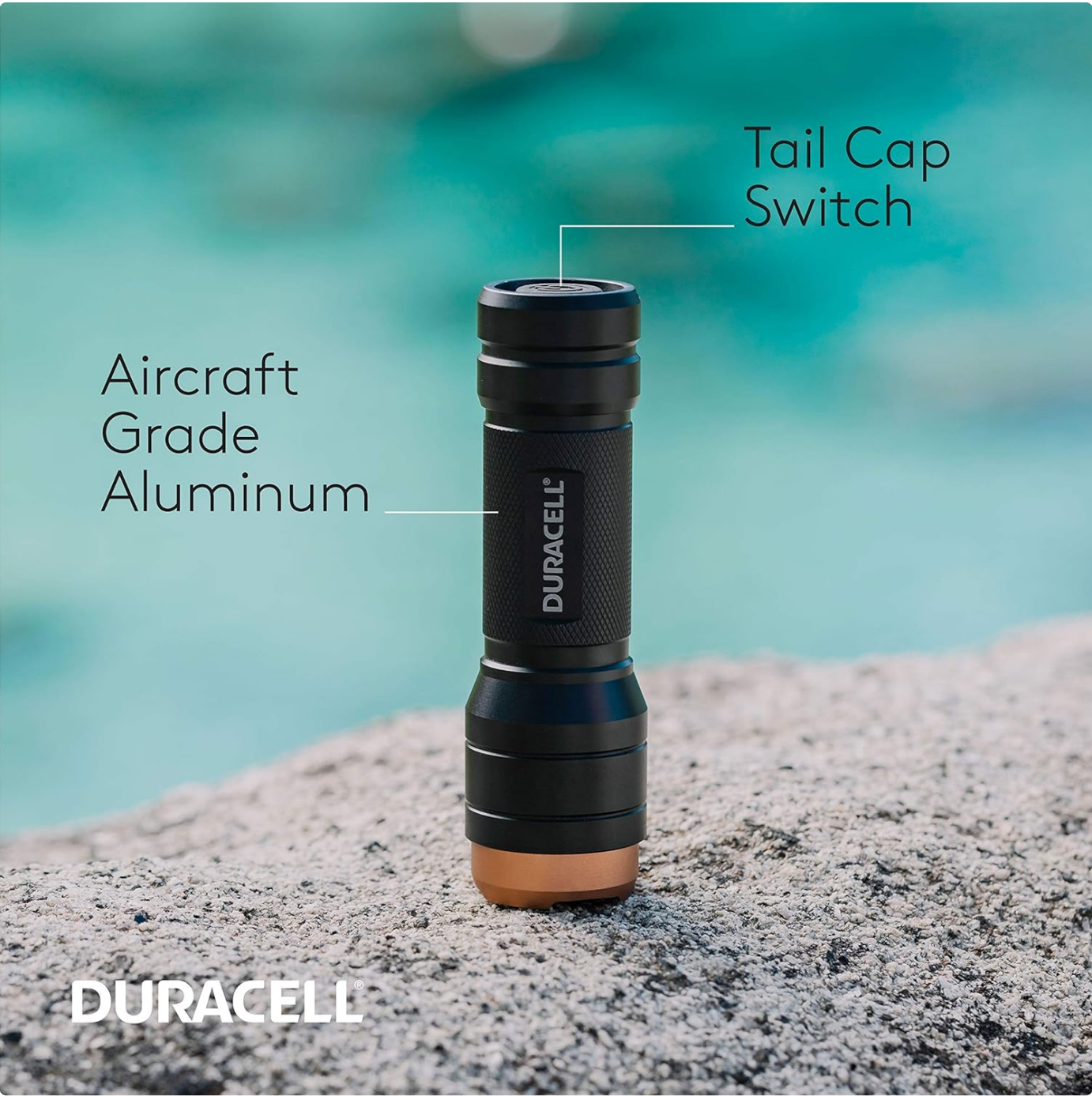
Image: Close-up of the Duracell flashlight highlighting the tail cap switch and aircraft-grade aluminum body.