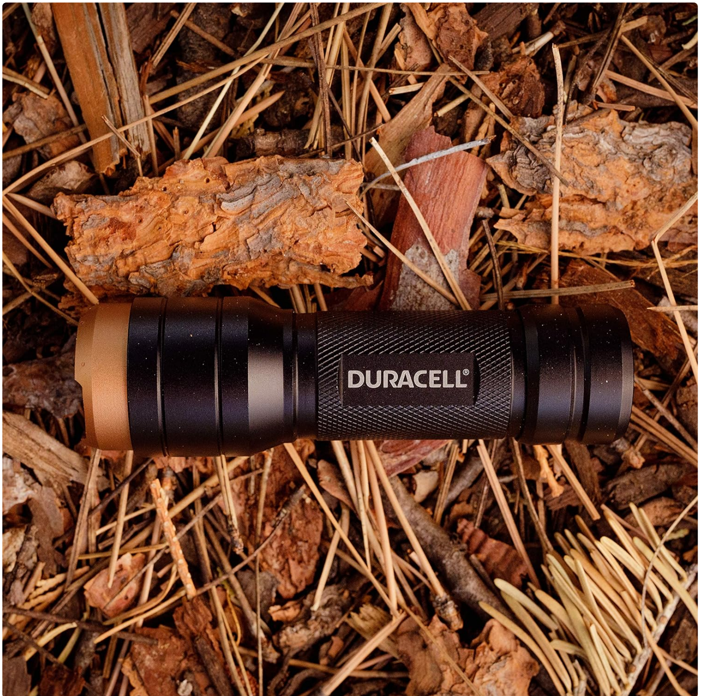
Image: The Duracell flashlight shown with three AAA batteries, illustrating the battery type required.

Your browser does not support the video tag.