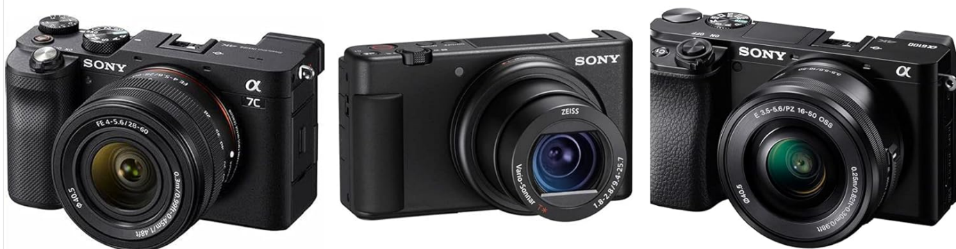
Image: Visual representation of the AODELAN remote and a list of compatible Sony camera models, including A6100, A6400, A6600, A7 III, A7R III, A7C, RX100 VII, RX0 II, ZV-1, A7R IV, A9, and A9 II.