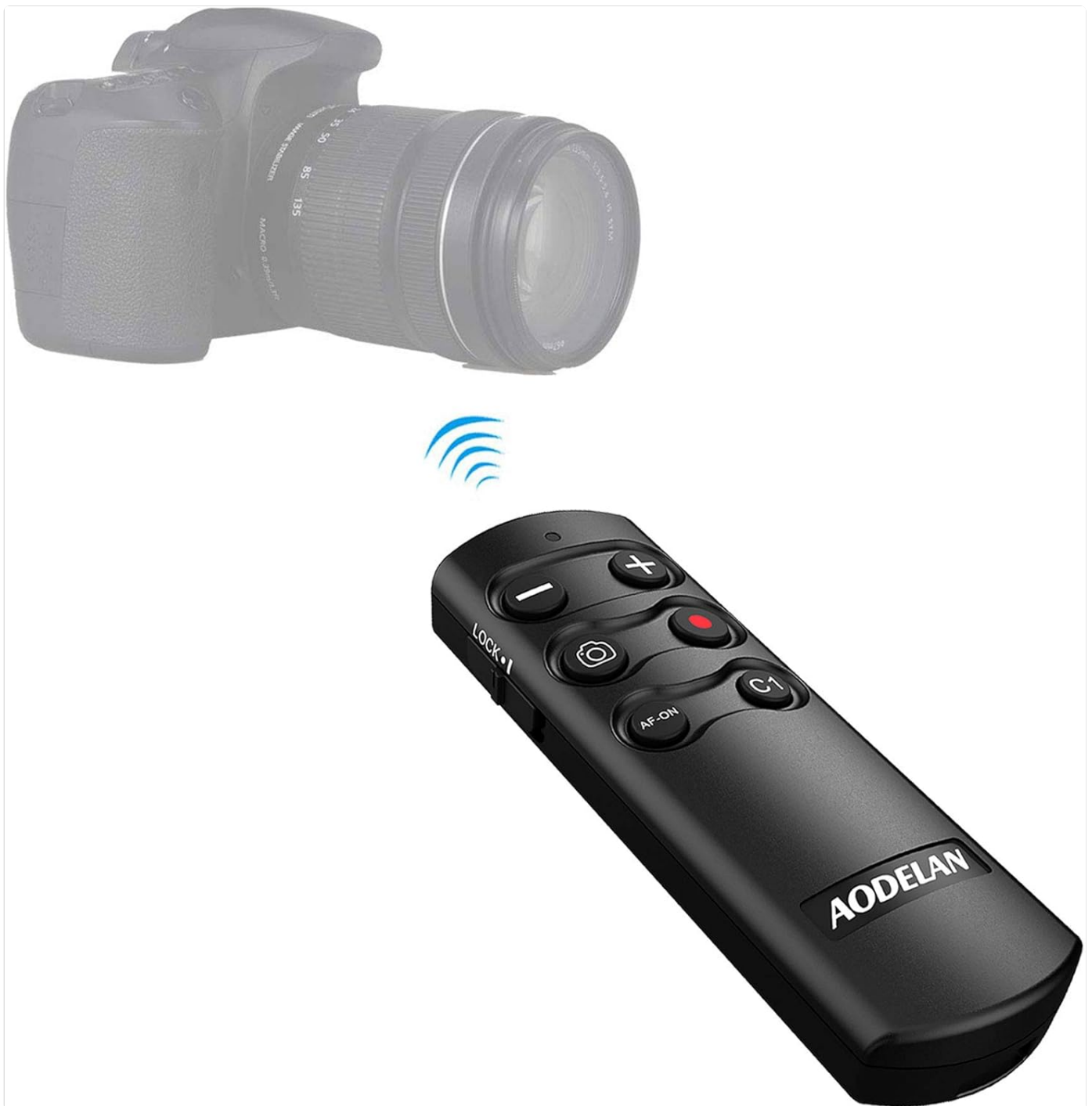
Image: The AODELAN RMT-P1BTA wireless remote control shown with a generic camera outline, illustrating its wireless connection.