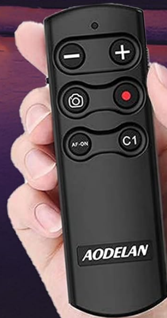
Image: The AODELAN RMT-P1BTA remote control against a sunset backdrop, highlighting its wireless shooting, remote video start/stop, and approximate 32.8-foot operating range.