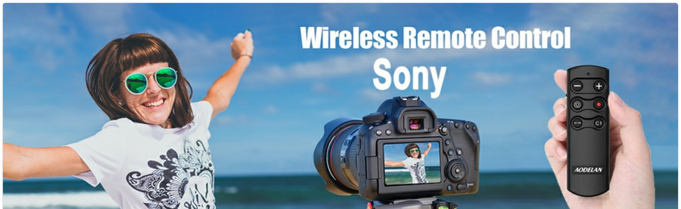
Image: Banner displaying "Wireless Remote Control Sony" with the remote control.

Welcome to the user manual for your AODELAN RMT-P1BTA Wireless Remote Shutter Release. This manual provides detailed instructions on how to set up, operate, and maintain your remote control to enhance your photography experience with compatible Sony cameras. Please read this manual thoroughly before using the product to ensure proper functionality and longevity.