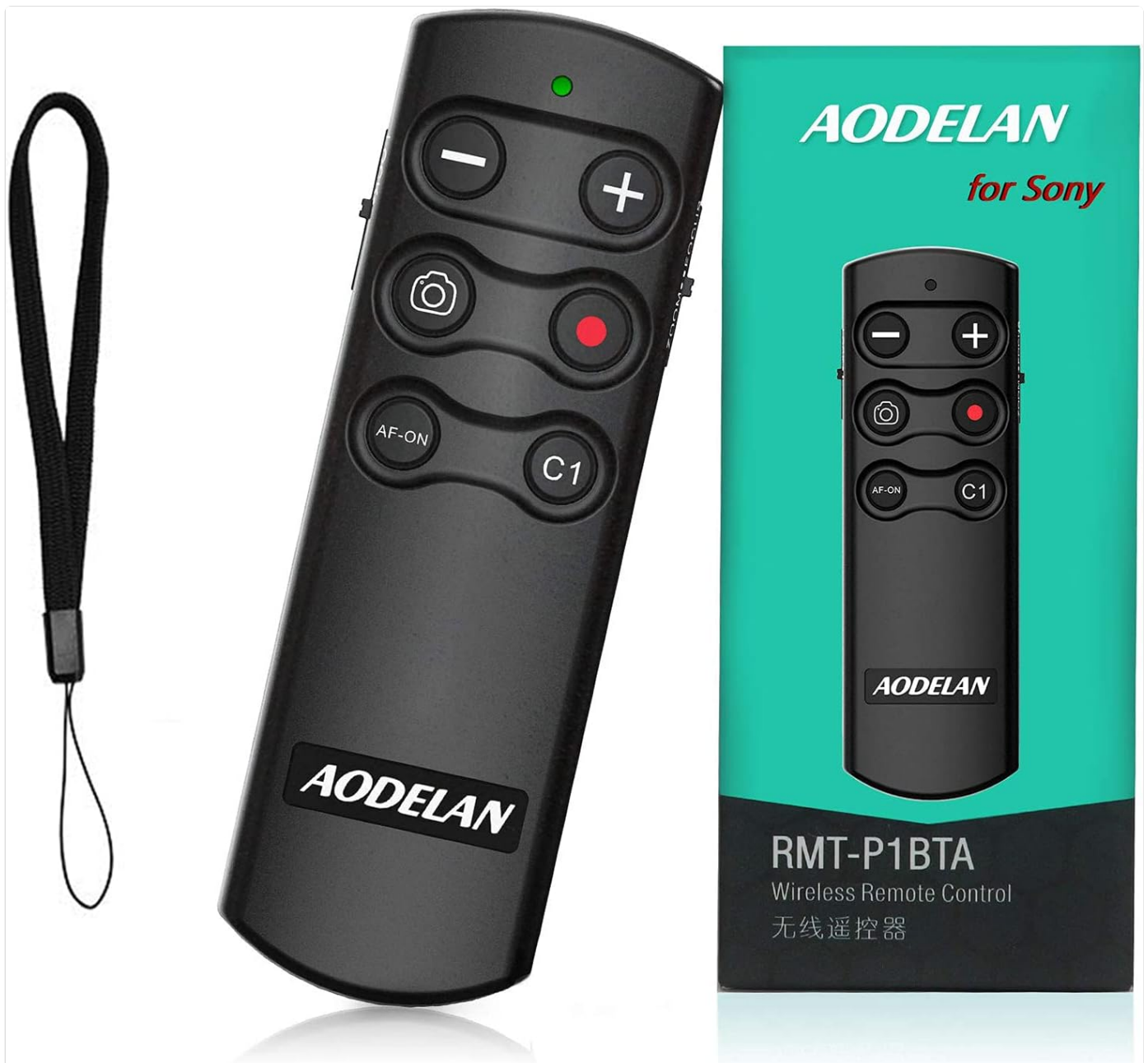
Image: The AODELAN RMT-P1BTA remote control displayed alongside its packaging and an included wrist strap.