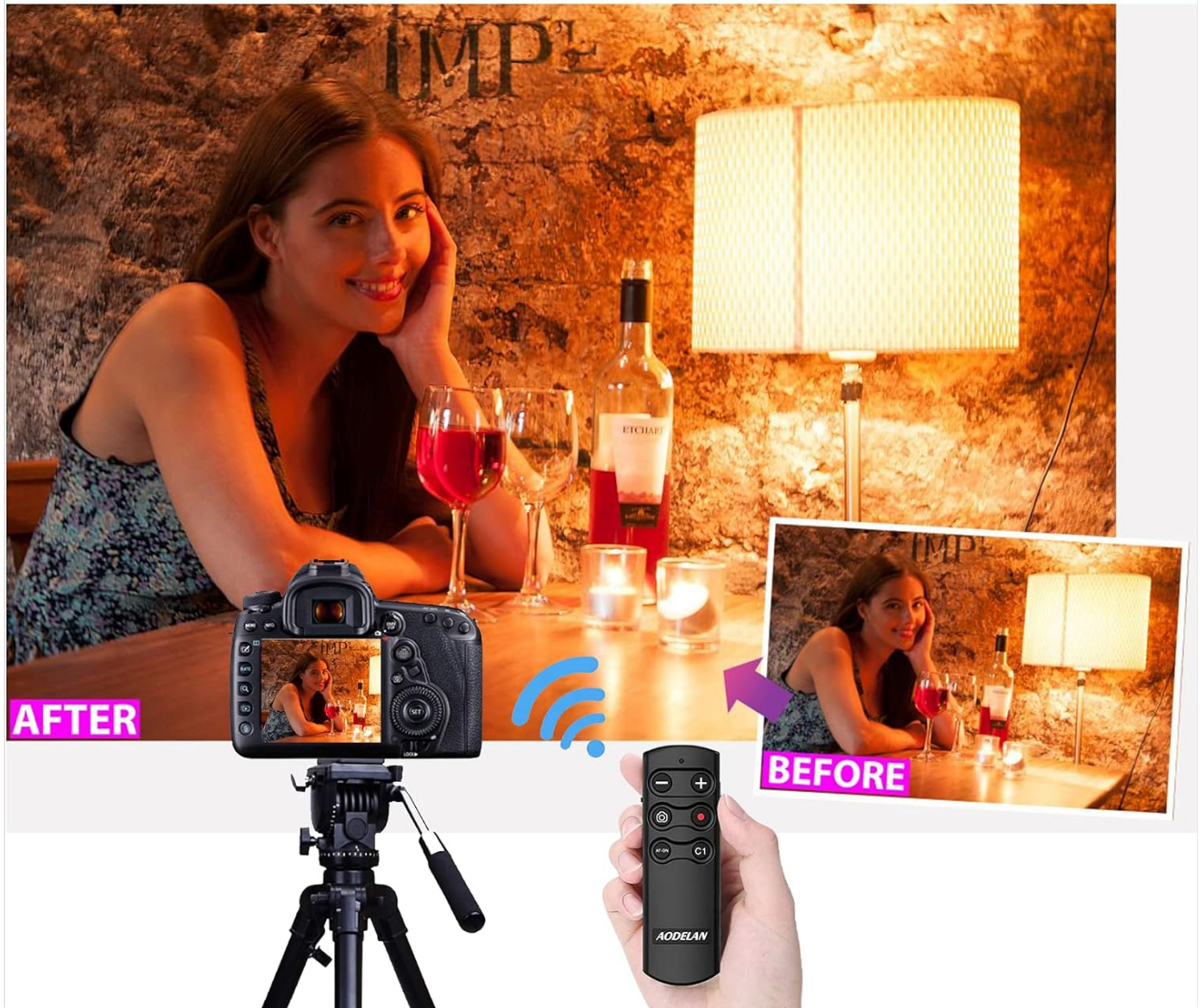
Image: A comparison showing a "Before" and "After" shot, illustrating how using the remote control reduces camera vibration for clearer images.