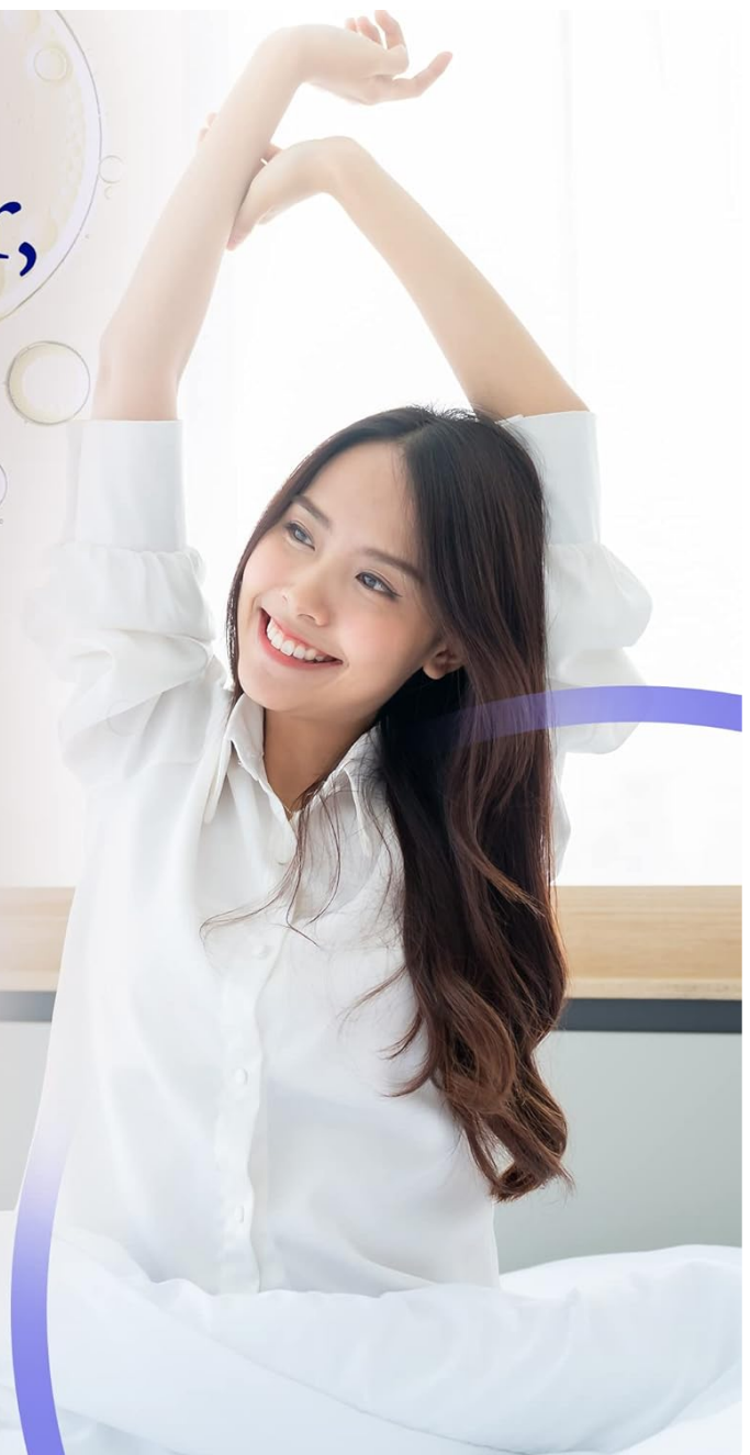
Image: A person stretching after waking up, depicting the benefits of better sleep and feeling refreshed.