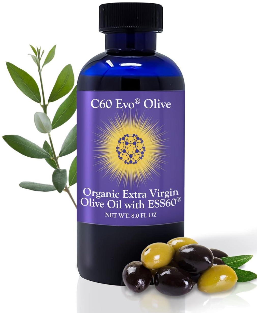
Image: The C60 Evo ESS60 Olive Oil bottle, accompanied by fresh olives and an olive branch, symbolizing its natural origin.