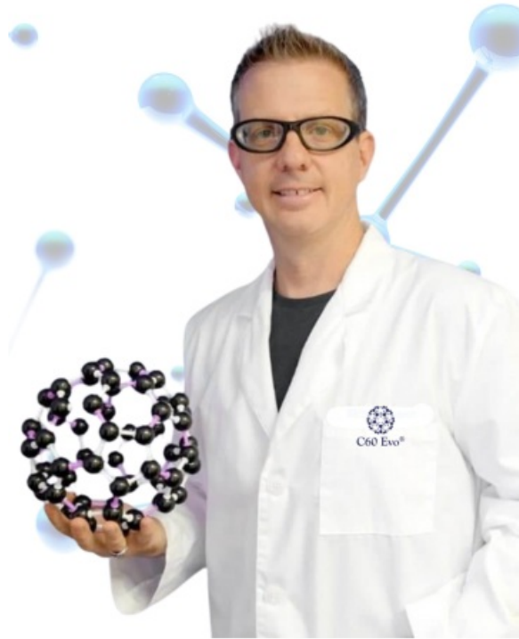
Image: A scientist in a lab coat holding a molecular model of C60, illustrating the product's scientific foundation.