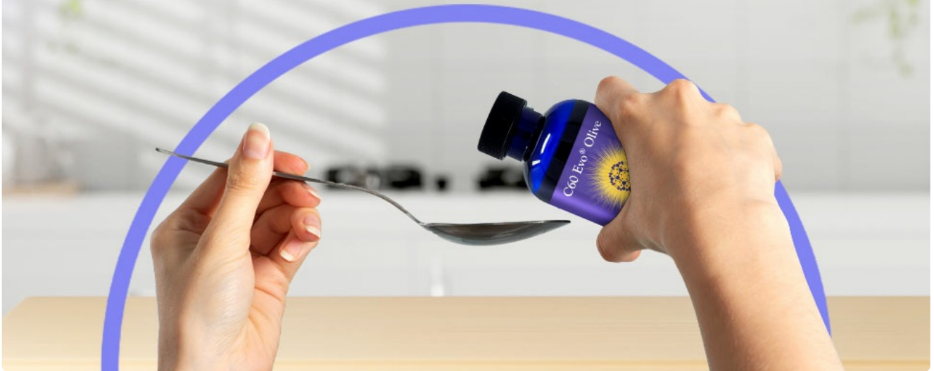
Image: Hands pouring C60 Evo oil from the bottle onto a spoon, demonstrating the recommended usage.

For adults, take one teaspoon of C60 EVO per day , preferably before noon. If you can digest well and desire more, you can take up to 1 tablespoon per day.