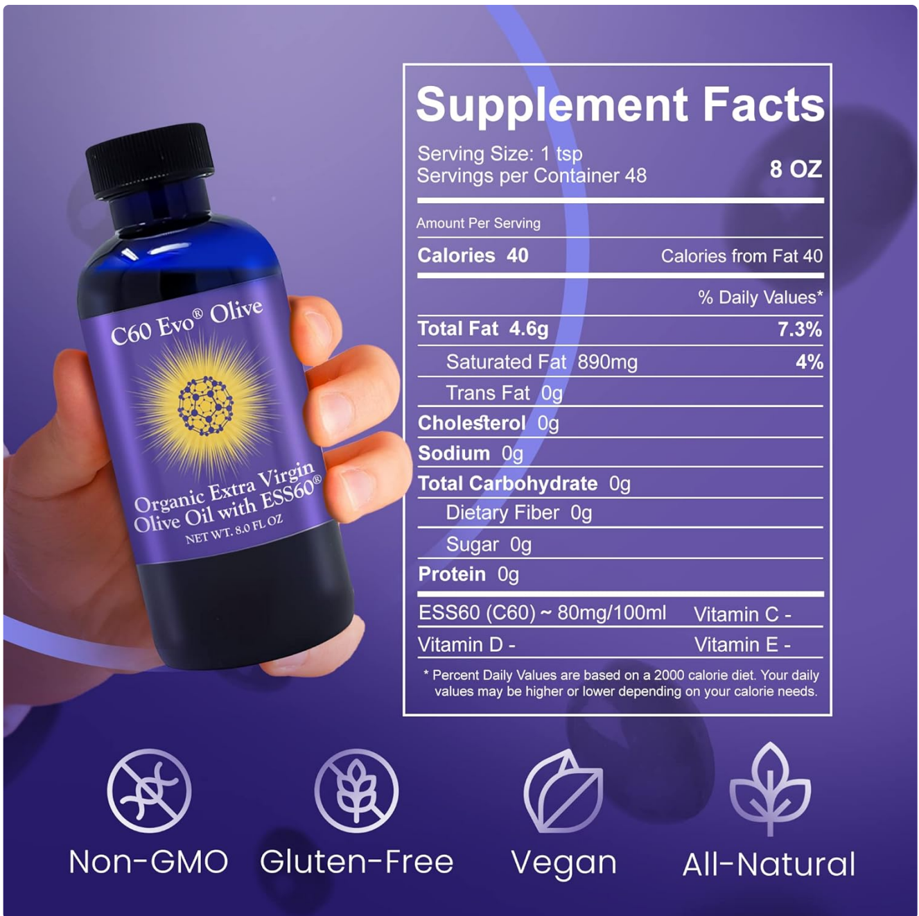
Image: A clear display of the Supplement Facts label for C60 Evo ESS60 Olive Oil, providing detailed nutritional information.