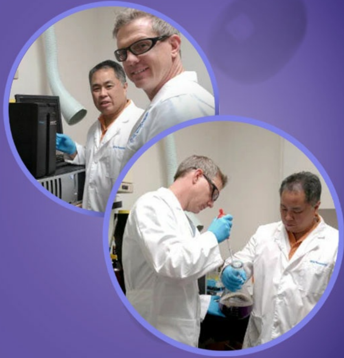
Image: Scientists in a laboratory setting, highlighting the meticulous manufacturing process of C60 Evo products.

We take great care in crafting our products to ensure they meet strict standards. Our C60 EVO is stirred for 3 weeks at room temperature in the dark to become fully saturated, without any light or oxidation.