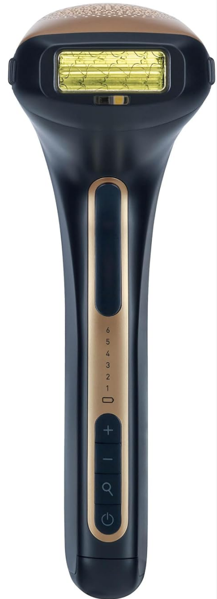
Figure 2: The Beurer IPL Velvet Skin Pro, showcasing its modern IPL technology, visible results, cordless design, optional app integration, and automatic skin type detection.