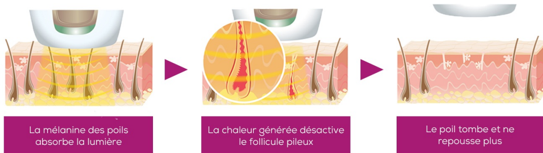
Figure 3: IPL Mechanism - Hair melanin absorbs light, generated heat deactivates the hair follicle, and hair falls out without regrowing.

IPL is most effective on certain hair and skin color combinations. The device is designed to work safely and effectively within these parameters.