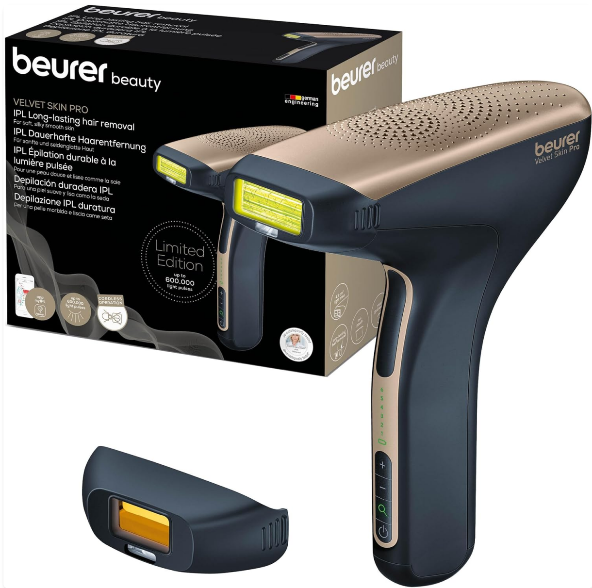
Figure 1: Beurer IPL Velvet Skin Pro device and its packaging.

The device is cordless, powered by a rechargeable battery, offering flexibility during use. It features a large light surface for efficient treatment and includes a precision attachment for smaller, sensitive areas. Integrated safety features, such as a skin type and contact sensor, ensure safe operation.