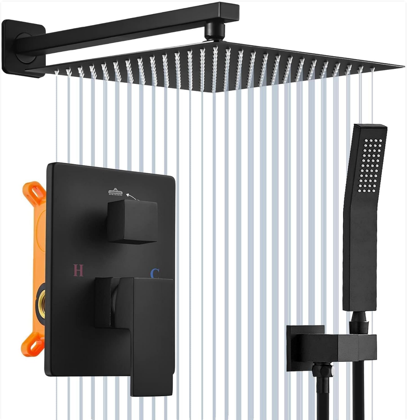
Image: Complete Beati Faucet 10-inch Shower System, showing the rain shower head, handheld sprayer, and control valve.