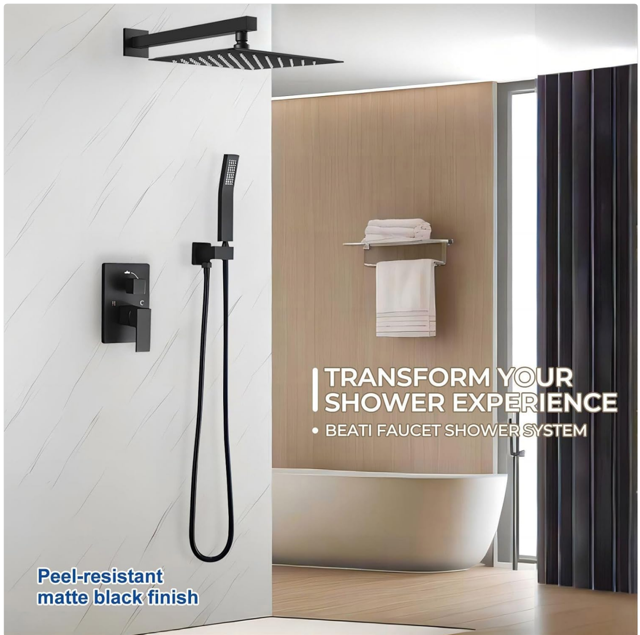
Image: The Beati Faucet shower system installed in a contemporary bathroom setting, showcasing the matte black finish and sleek design.