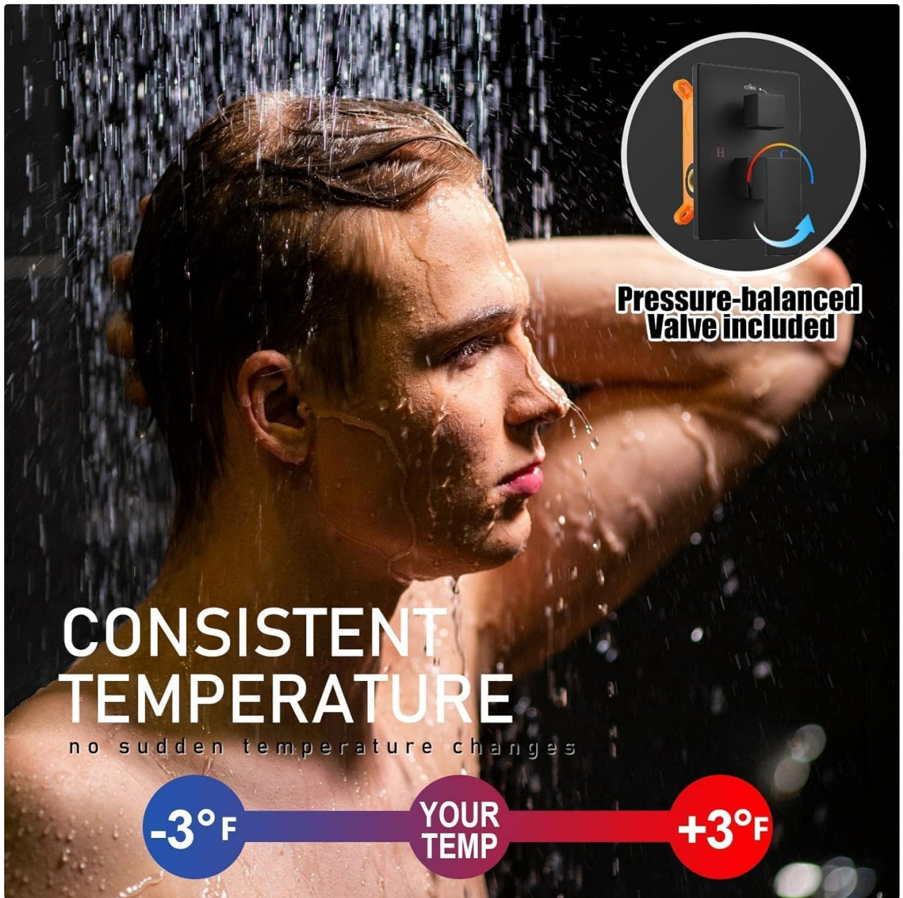
Image: Illustration demonstrating the consistent temperature feature of the shower system, preventing sudden temperature changes.