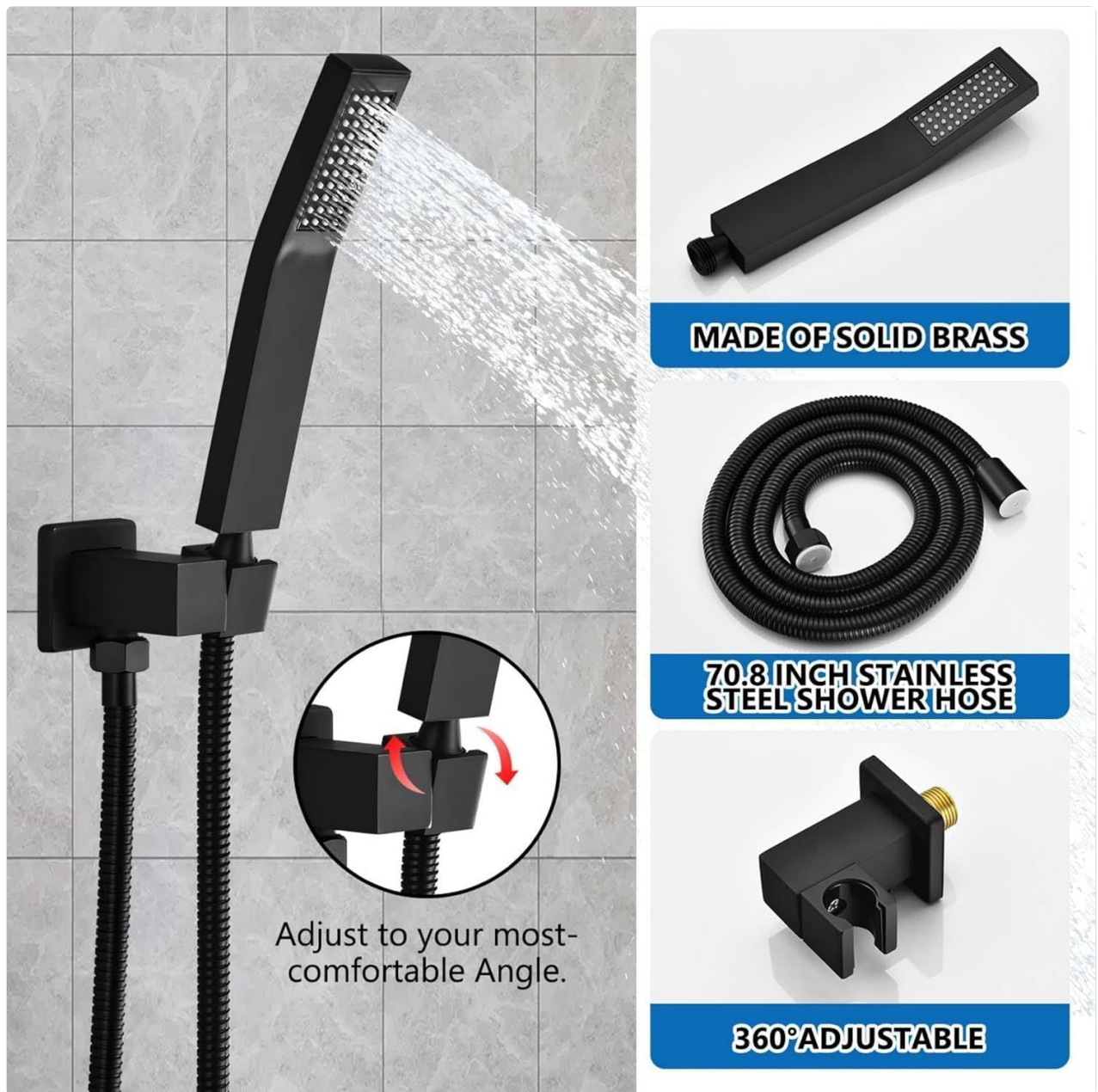
Image: The handheld shower sprayer connected to its flexible hose, highlighting its solid brass construction and adjustable holder.