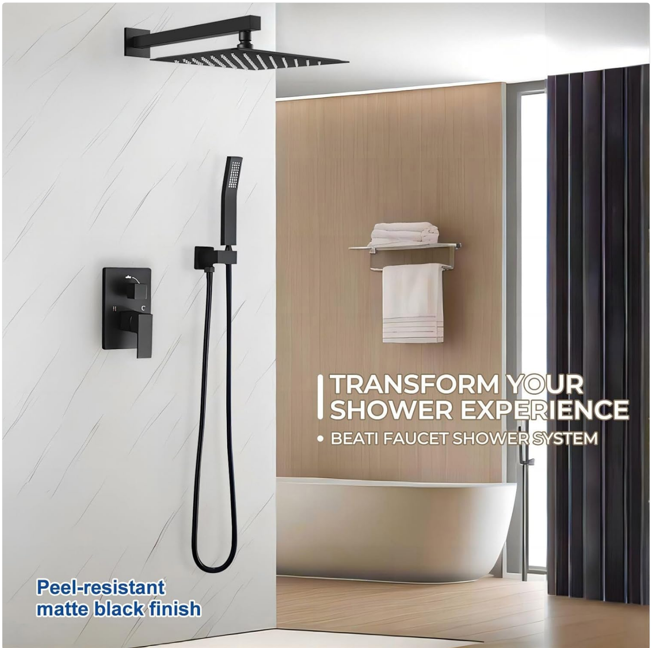
Image: The shower system showcasing its peel-resistant matte black finish, emphasizing its durability and ease of maintenance.