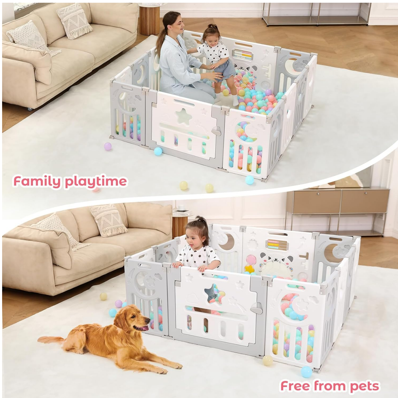
Image: This image depicts a child enjoying playtime within the playpen, filled with colorful balls, and illustrates how parents can interact with their child from outside the enclosure.