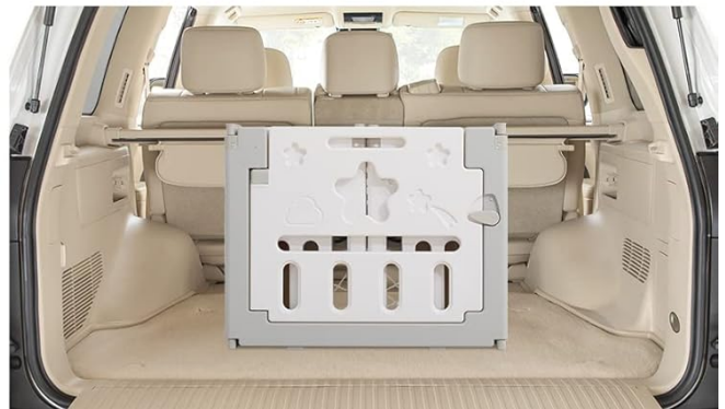
Image: This image demonstrates the playpen's foldable design, showing how panels can be collapsed for compact storage and transport in a car trunk.