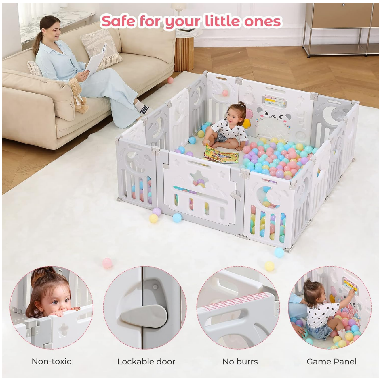
Image: Detailed view highlighting the safety features of the playpen, including the non-toxic material, lockable door, smooth surfaces, and the integrated game panel.