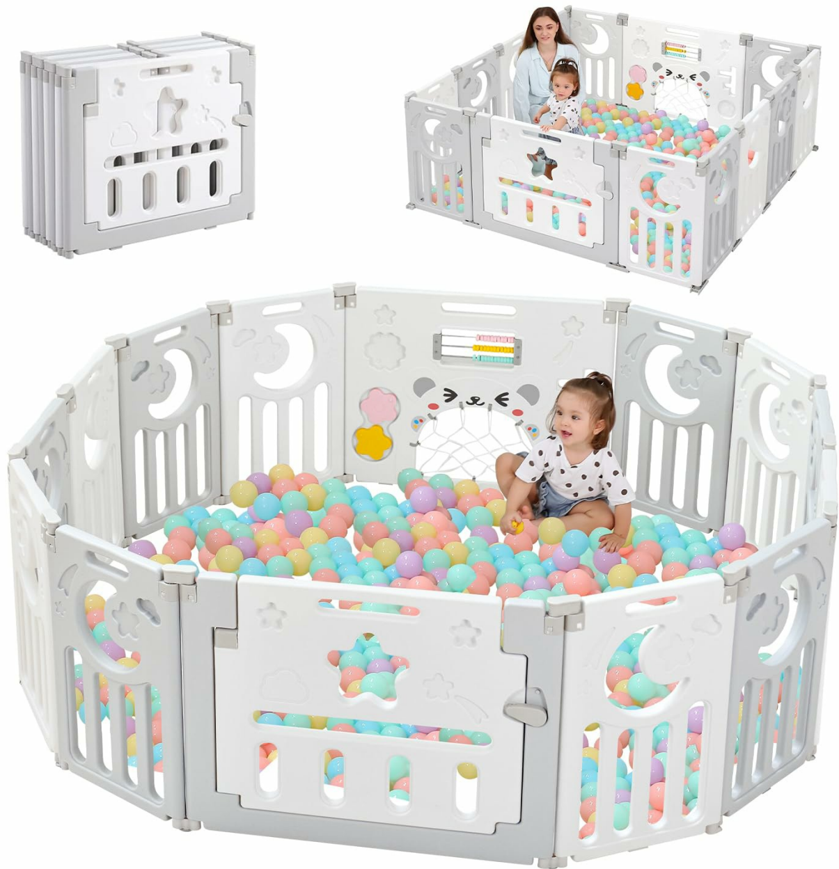
Image: The Dripex Baby Playpen in an octagonal configuration, showcasing its spacious design and interactive elements.