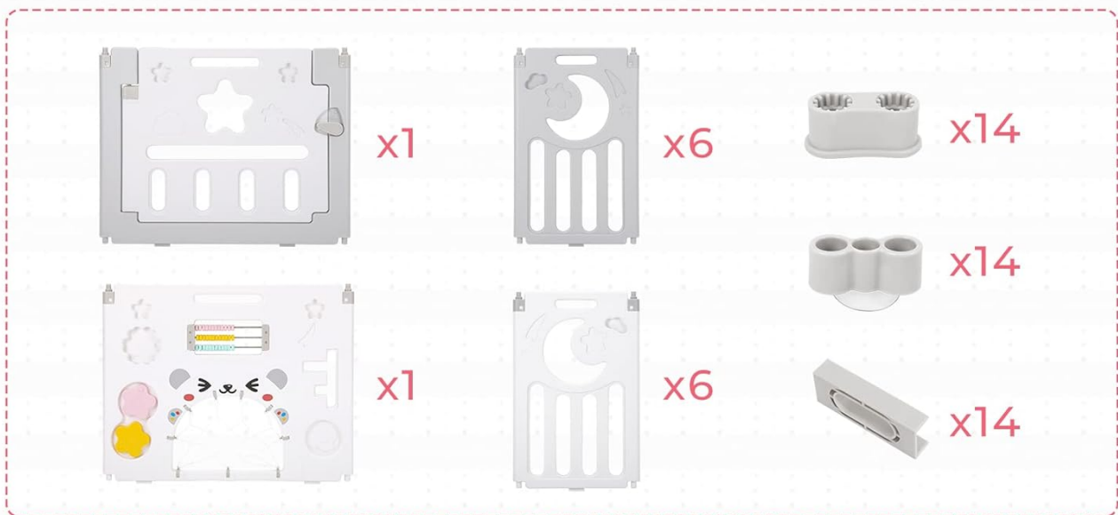
Image: An illustration detailing the dimensions of the playpen when assembled (60x60x24 inches) and a visual breakdown of all included parts for the 14-panel configuration.