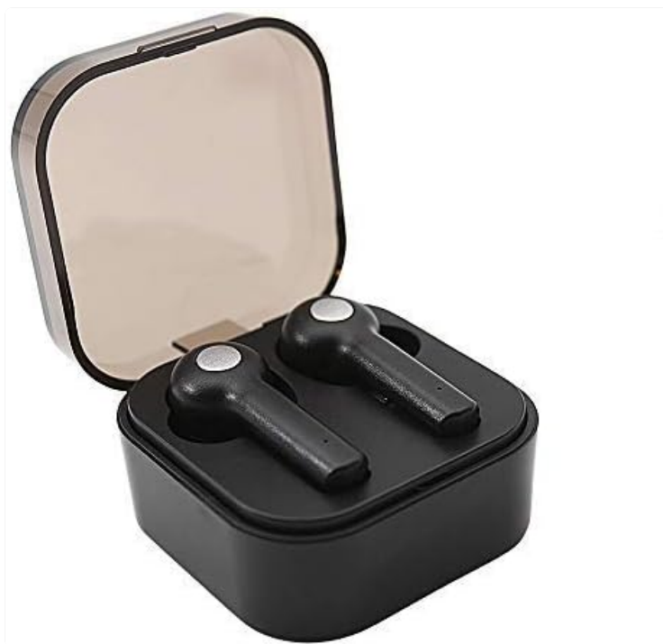
Image: Wireless Gear True Wireless Earbuds in their open charging case, showcasing their compact design.

This manual provides comprehensive instructions for the Wireless Gear Bluetooth 5.0 True Wireless Stereo Earbuds. Please read this manual carefully before using the product to ensure proper operation and to maximize your listening experience. Keep this manual for future reference.