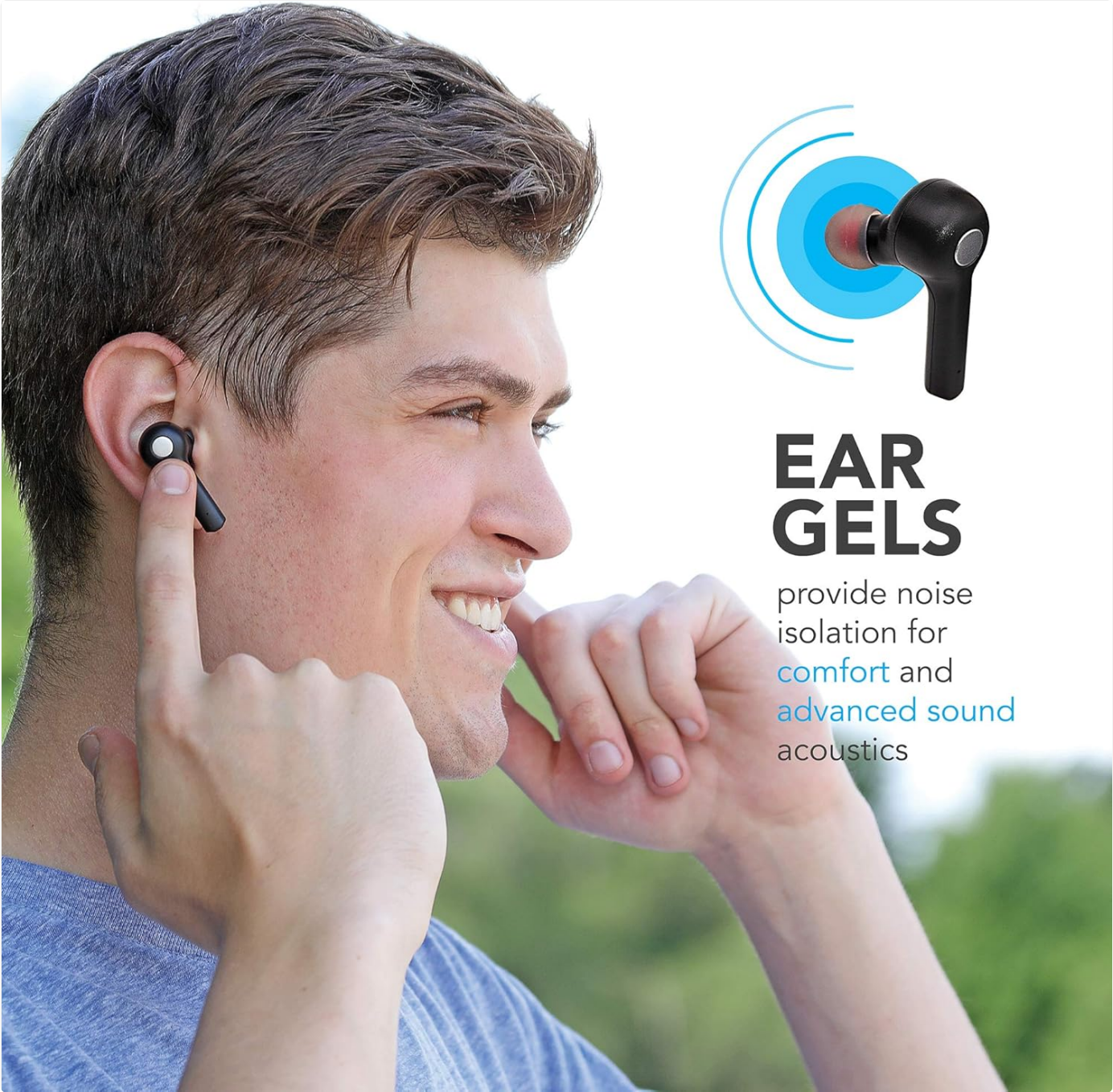
Image: A man demonstrating the proper fit of the earbud, emphasizing the comfort and sound isolation provided by the ear gels.

Gently insert the earbuds into your ears. Adjust them for a comfortable and secure fit. The noise-isolating ear gels are designed to provide optimal sound acoustics and comfort.