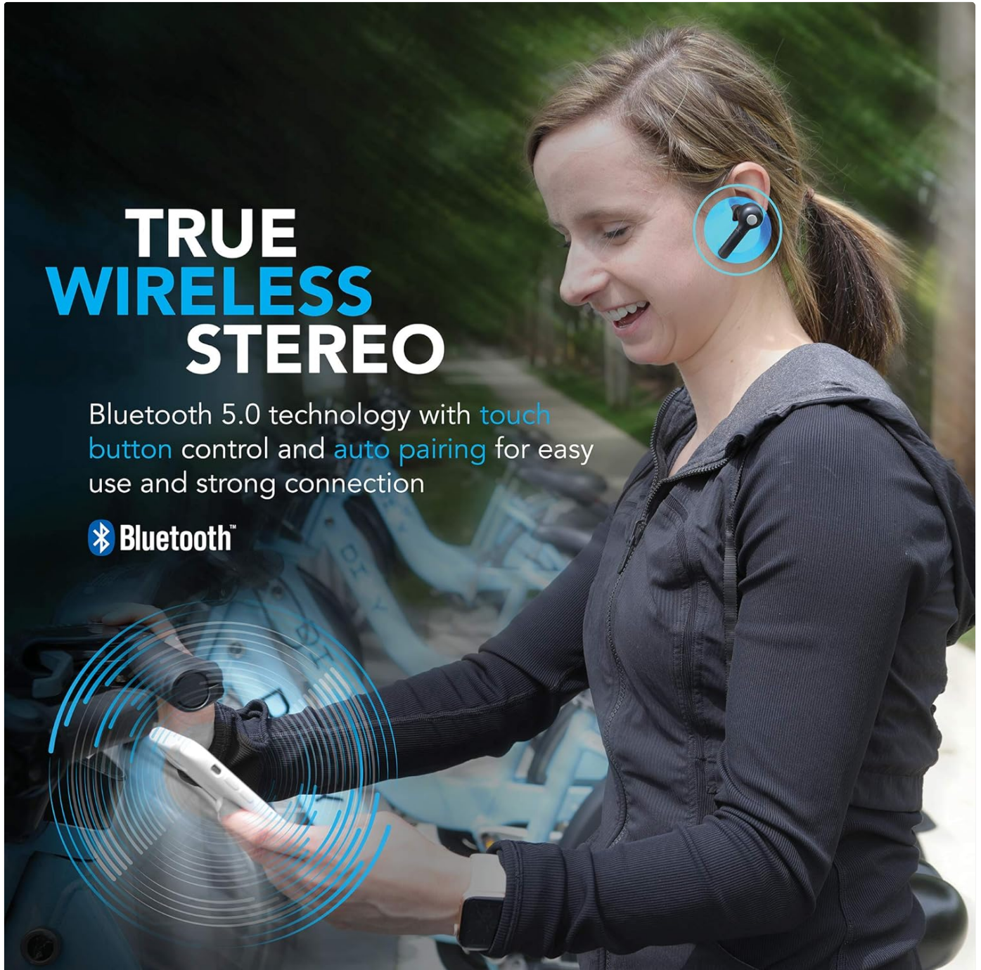
Image: A woman wearing the Wireless Gear earbuds, illustrating the true wireless stereo and Bluetooth 5.0 capabilities.