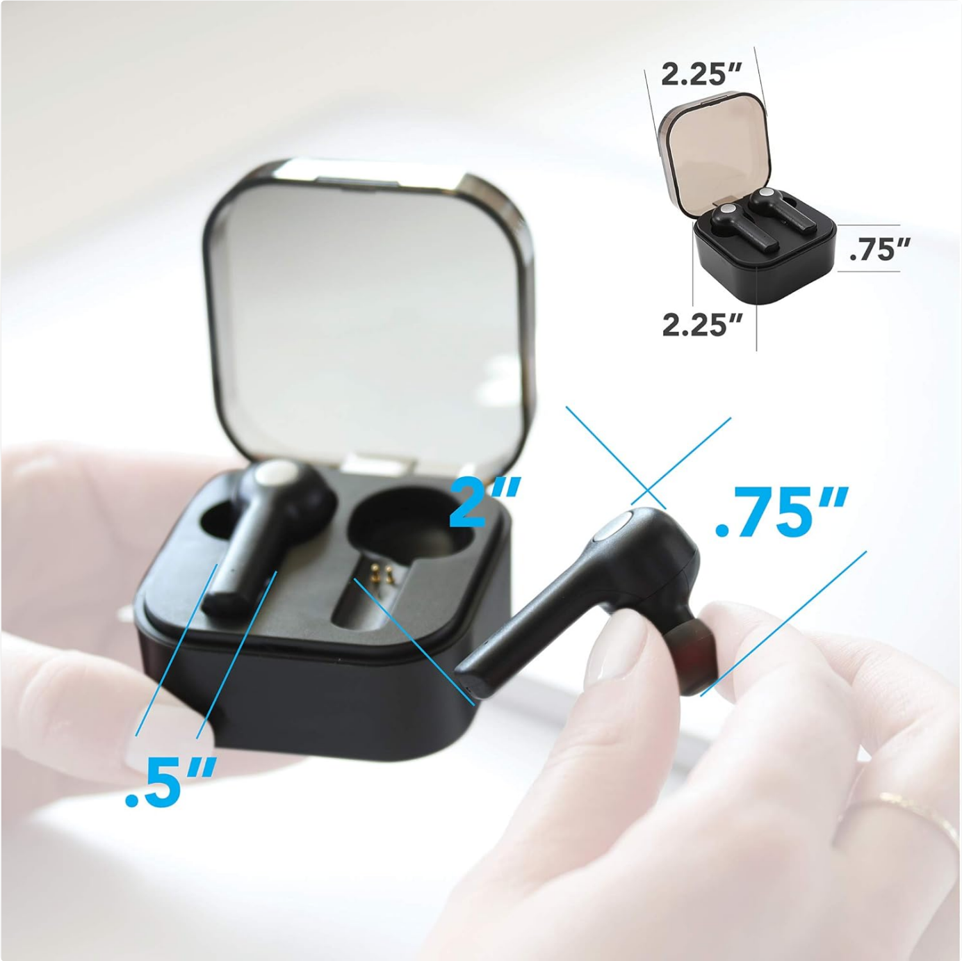
Image: Detailed dimensions of the earbuds and charging case for reference.

For warranty details and terms, please refer to the warranty card included with your product or contact Wireless Gear customer support. Keep your purchase receipt as proof of purchase.