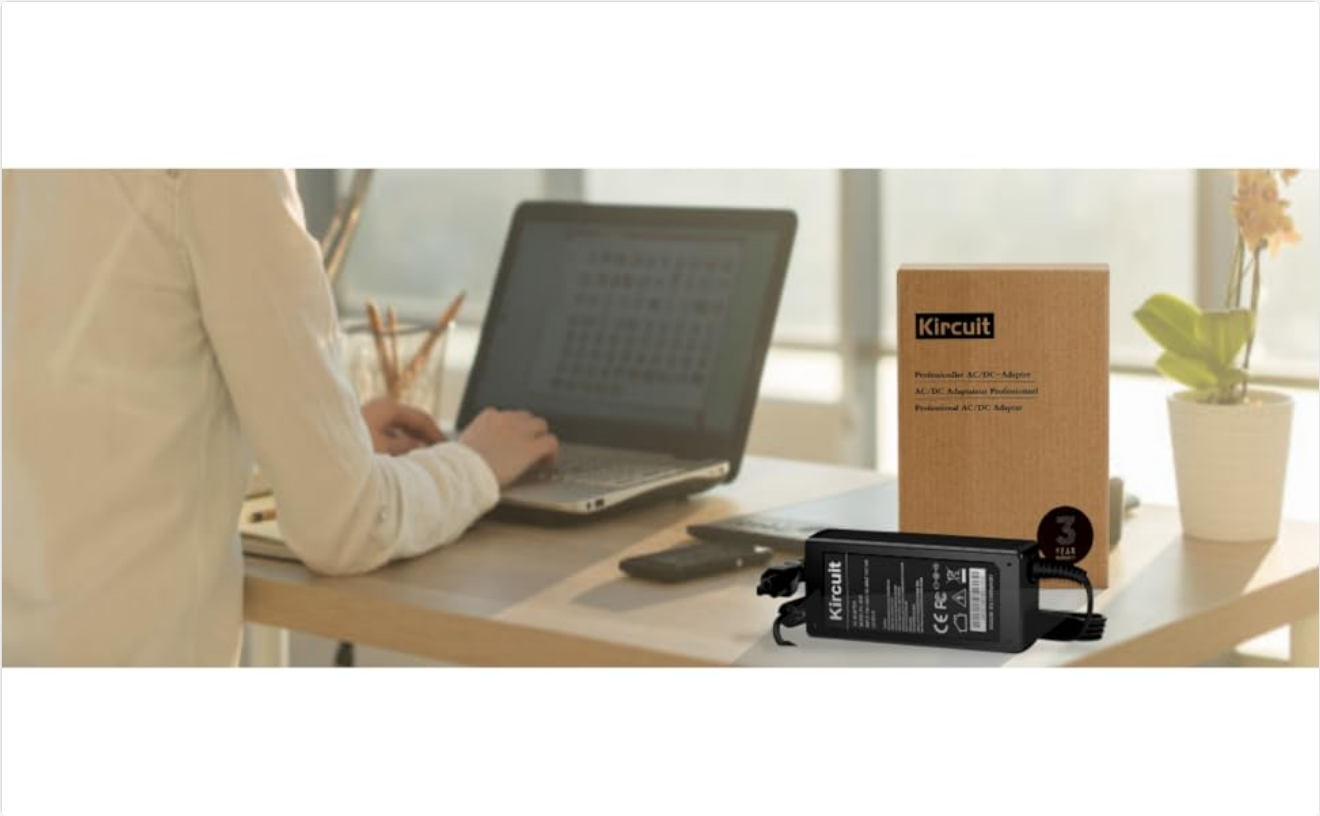
Image: Illustration of the adapter's durable cable design and a comparison highlighting the robust construction of the Kircuit plug.