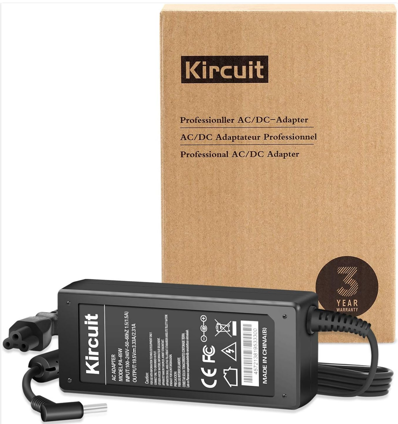
Image: Kircuit AC/DC Adapter and packaging, highlighting the 3-year warranty.