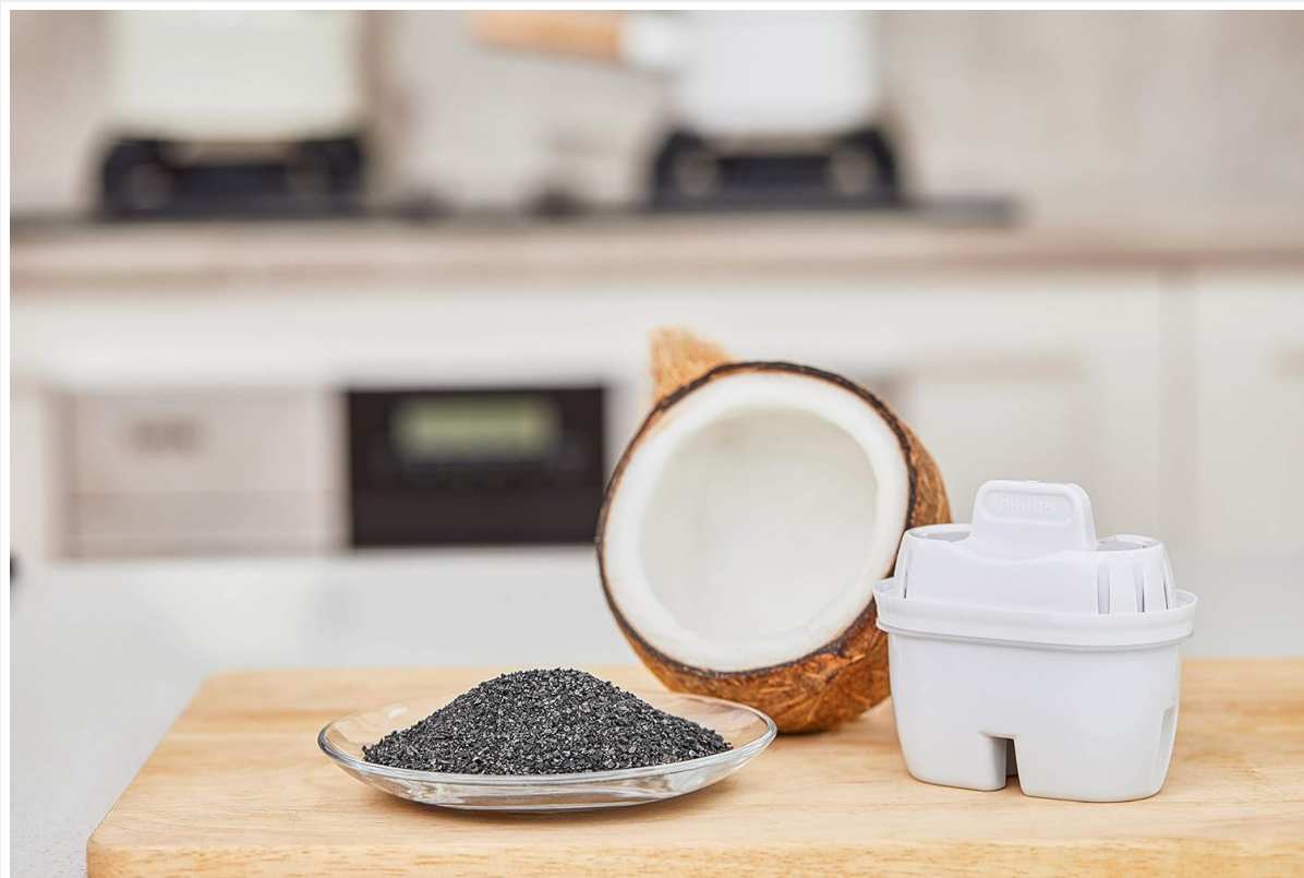
Figure 6: Filter technology utilizing activated carbon

The filter is designed for fast flow, providing filtered water efficiently. Each filter cartridge has a capacity of up to 100 liters or lasts for approximately 30 days, whichever comes first. For optimal performance and water quality, adhere to the recommended replacement schedule.