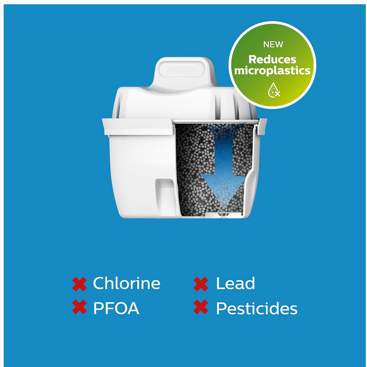
Figure 3: Contaminants reduced by the filter