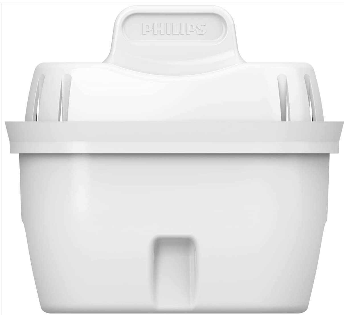
Figure 1: Philips Micro X-Clean Water Filter