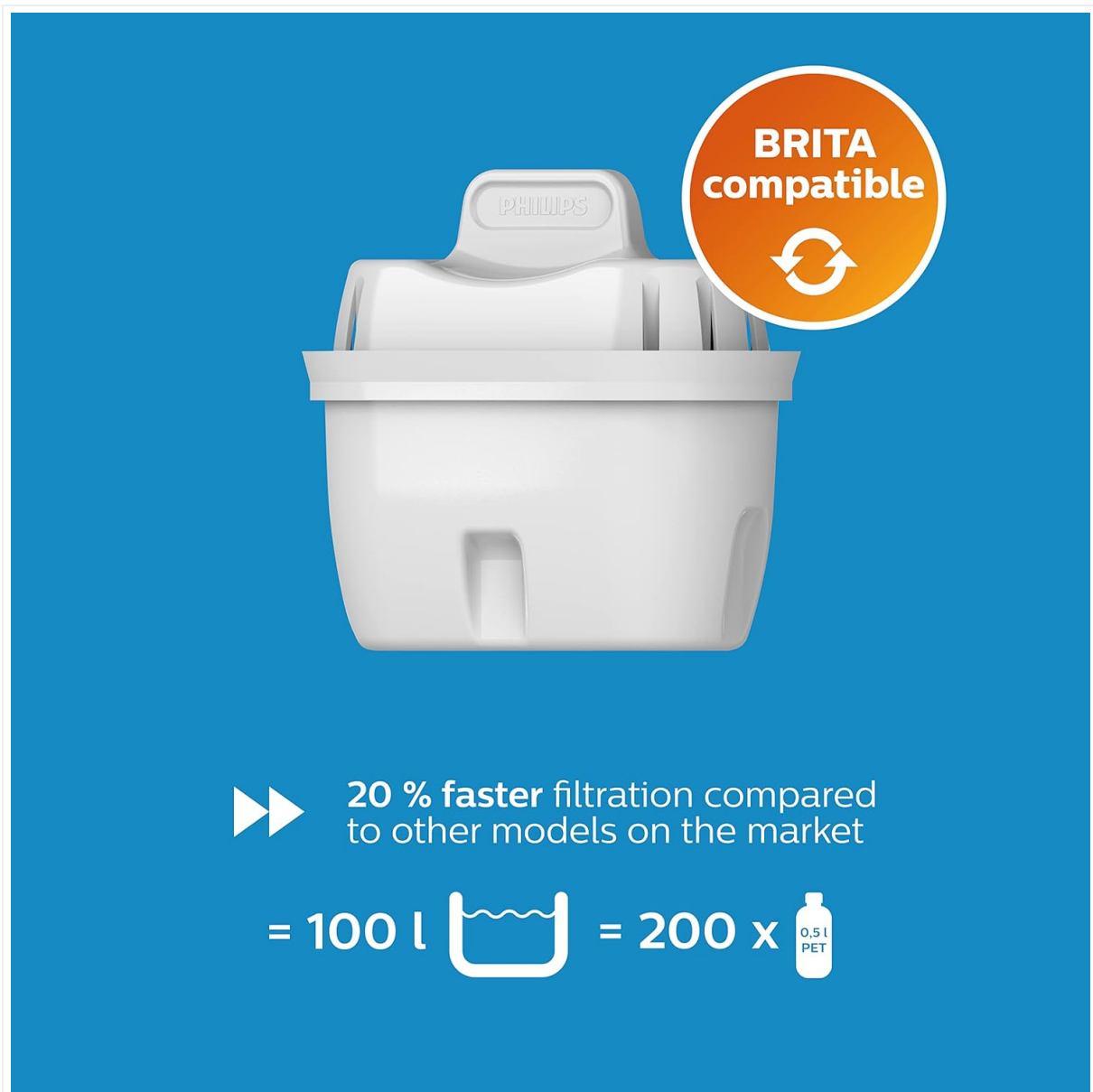
Figure 2: Filter compatibility and performance overview