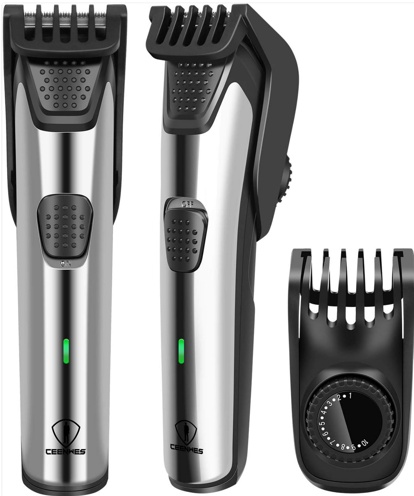
Image: The Ceenwes Adjustable Beard Trimmer, showcasing its sleek design, on/off switch, and the detachable adjustable comb.