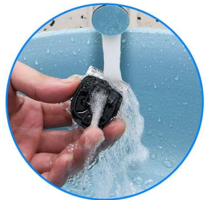
Image: Demonstrates the ease of cleaning by rinsing the trimmer head under water and showing the detachable blade.