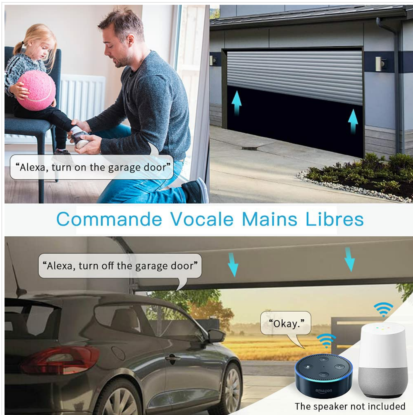
Figure 5.2: Voice Control. Use Amazon Alexa or Google Home for hands-free operation.