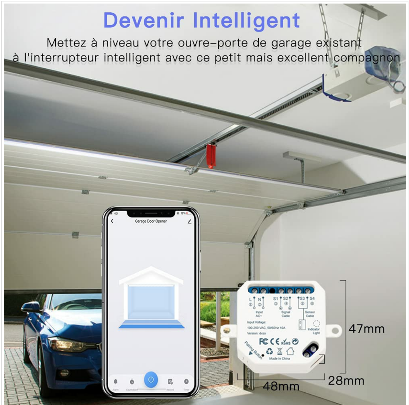
Figure 4.1: Smart Module Overview. The module integrates with your existing opener for smart control.