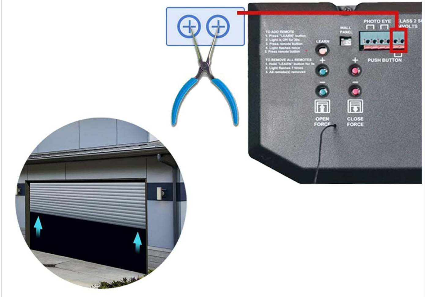
Figure 2.1: Compatibility Test. Use pliers to short-circuit the wall button terminals. If the door responds, it is compatible.

Utilisez un pince pour court-circuiter les bornes des boutons muraux, si la porte de garage s'ouvre ou se ferme, il est compatible.