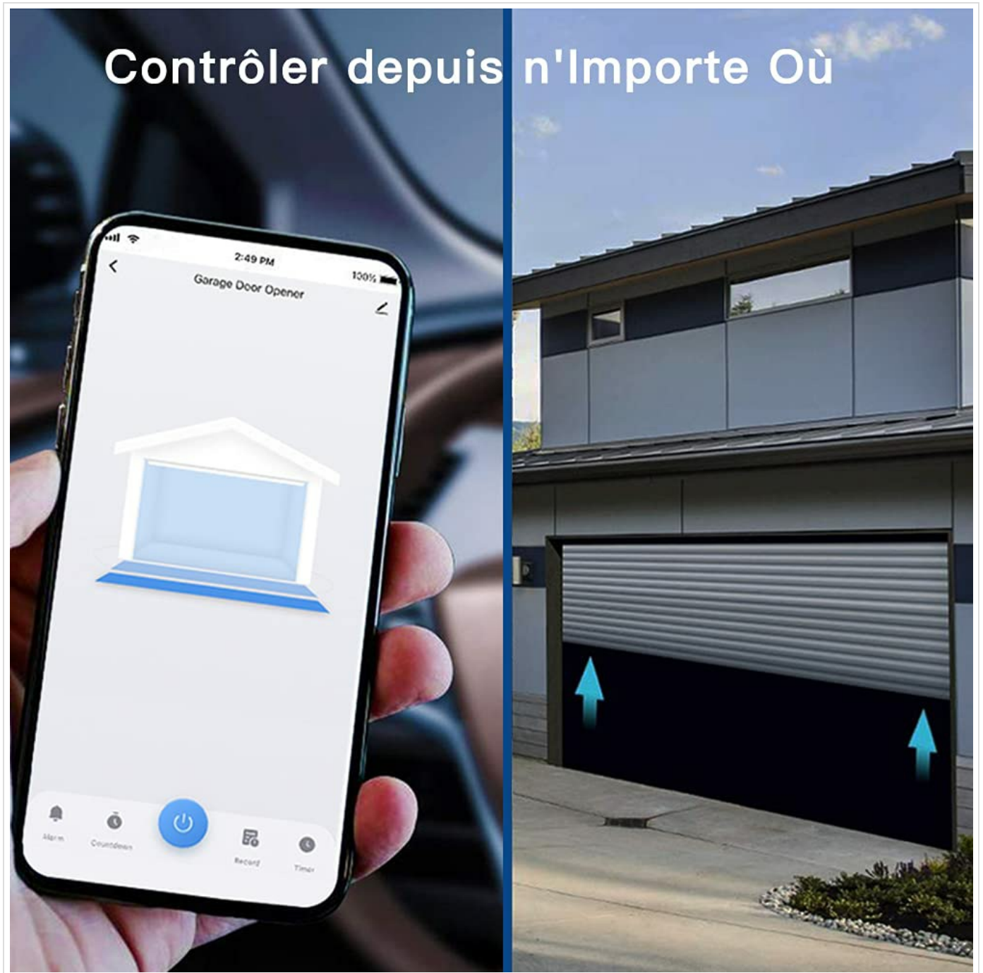
Figure 5.1: Remote Control. Control your garage door from anywhere using the Smart Life app.