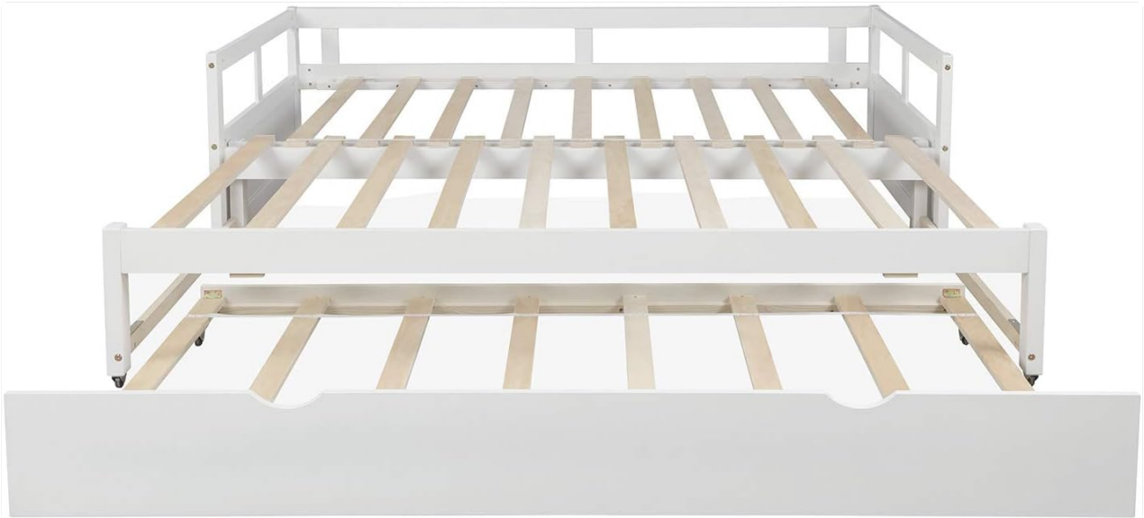
Image 5.1: The daybed with the trundle fully extended, demonstrating its capability to expand the sleeping surface.