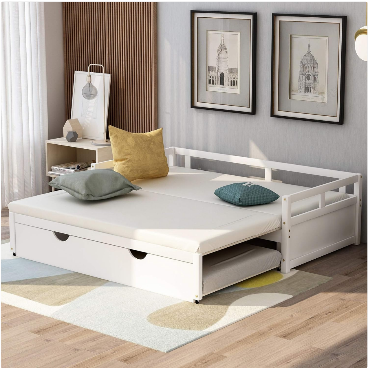
Image 1.1: The Merax Wooden Daybed with Trundle, shown in its extended king-size configuration with the trundle pulled out.