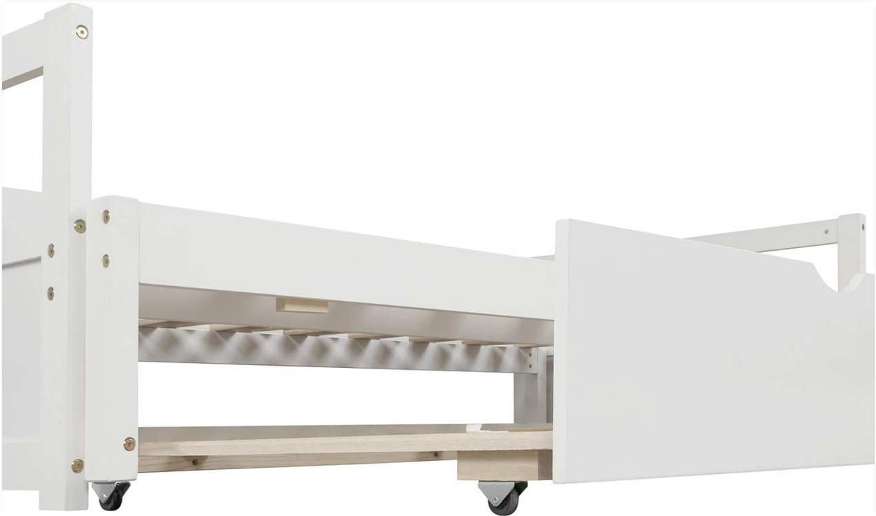
Image 4.1: Close-up of the trundle's rolling mechanism, highlighting the wheels for easy movement.

Tools Required: Typically, an Allen wrench (provided) and a Phillips head screwdriver (not provided) are needed for assembly.