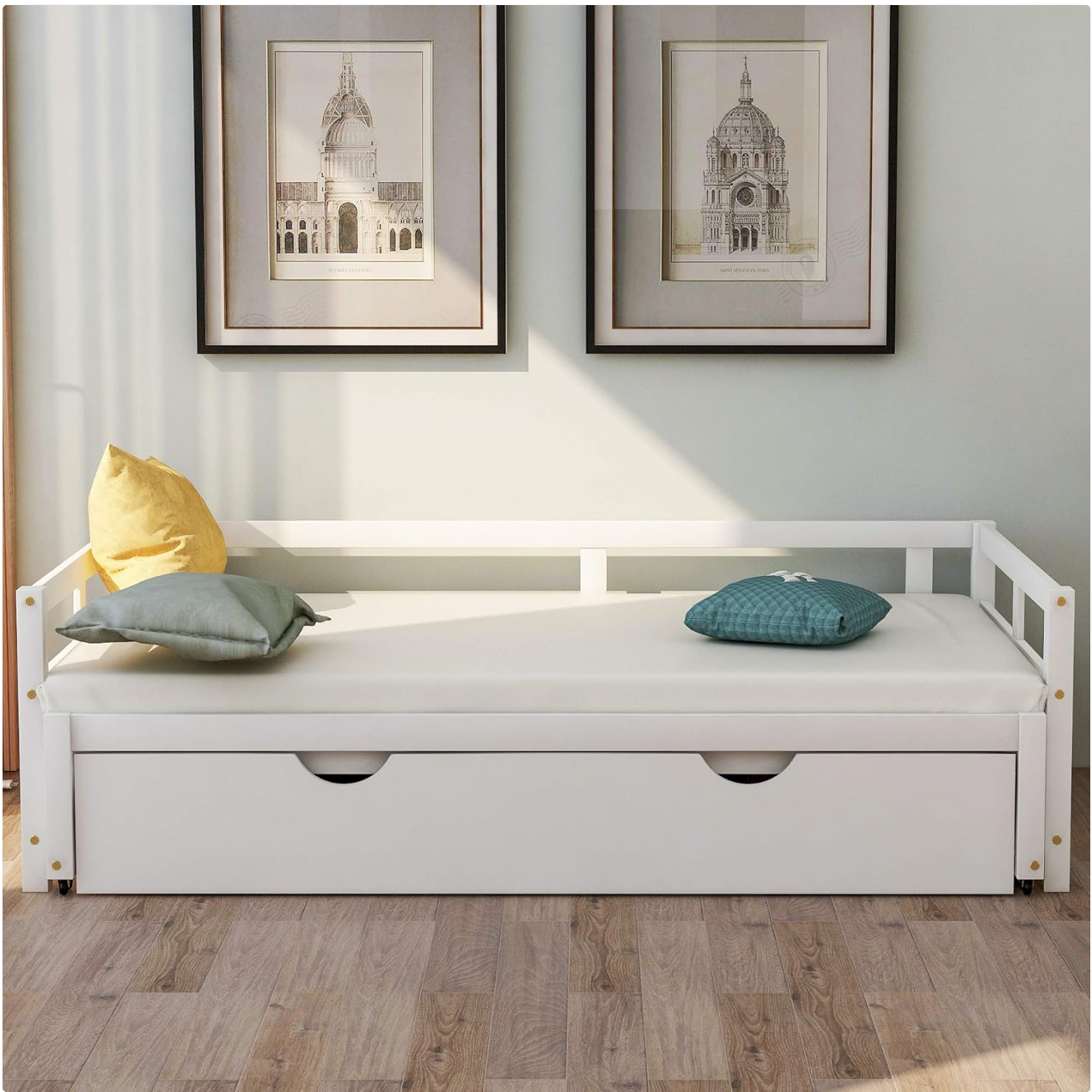
Image 5.2: The daybed in its compact twin configuration, with the trundle neatly stored beneath.