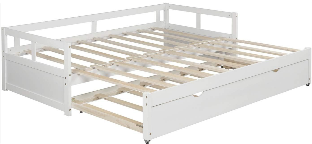
Image 3.1: View of the daybed frame showing the slat system and the trundle partially extended.