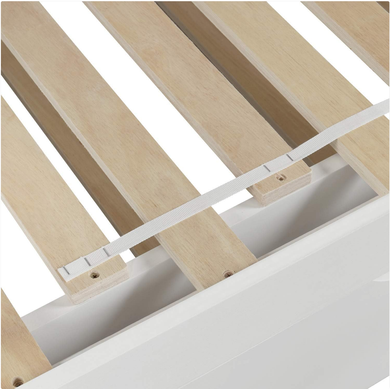
Image 3.2: Detail of the bed slats, illustrating their sturdy construction and connection method.