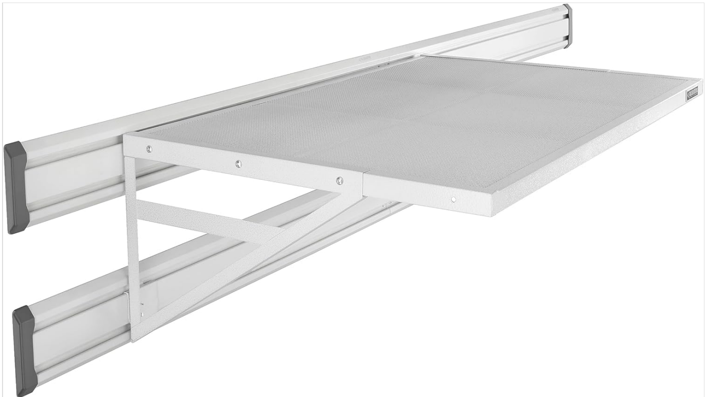
Figure 4.2.3: The shelf mounted on a Gladiator GearWall system, demonstrating the downward bracket position for a higher shelf height. This configuration is suitable for storing less frequently used or bulkier items overhead.