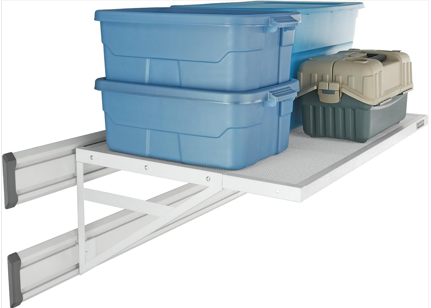
Figure 5.1: The Gladiator Overhead Max GearLoft Shelf effectively storing multiple large plastic totes and other bulky items, demonstrating its capacity and utility in a garage setting.