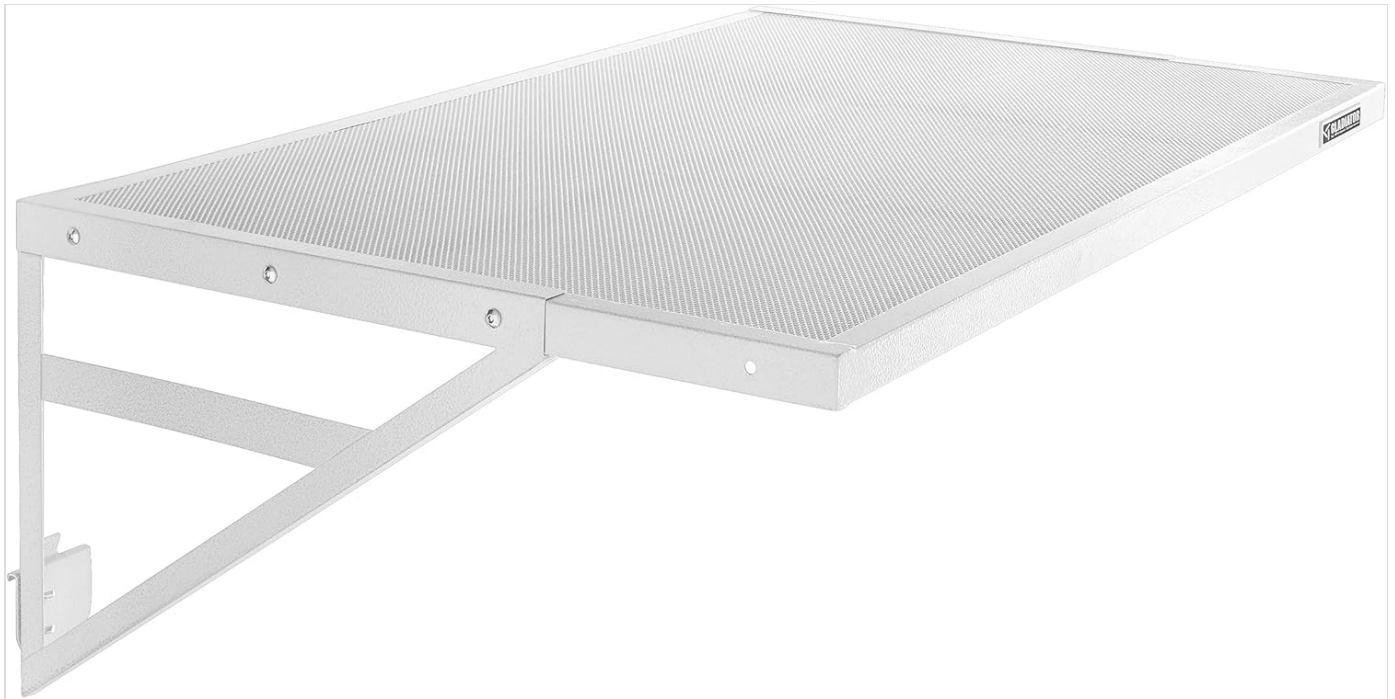
Figure 4.2.1: The Gladiator Overhead Max GearLoft Shelf with its dual-mounting brackets, ready for installation. The brackets can be oriented to position the shelf higher or lower on the wall system.