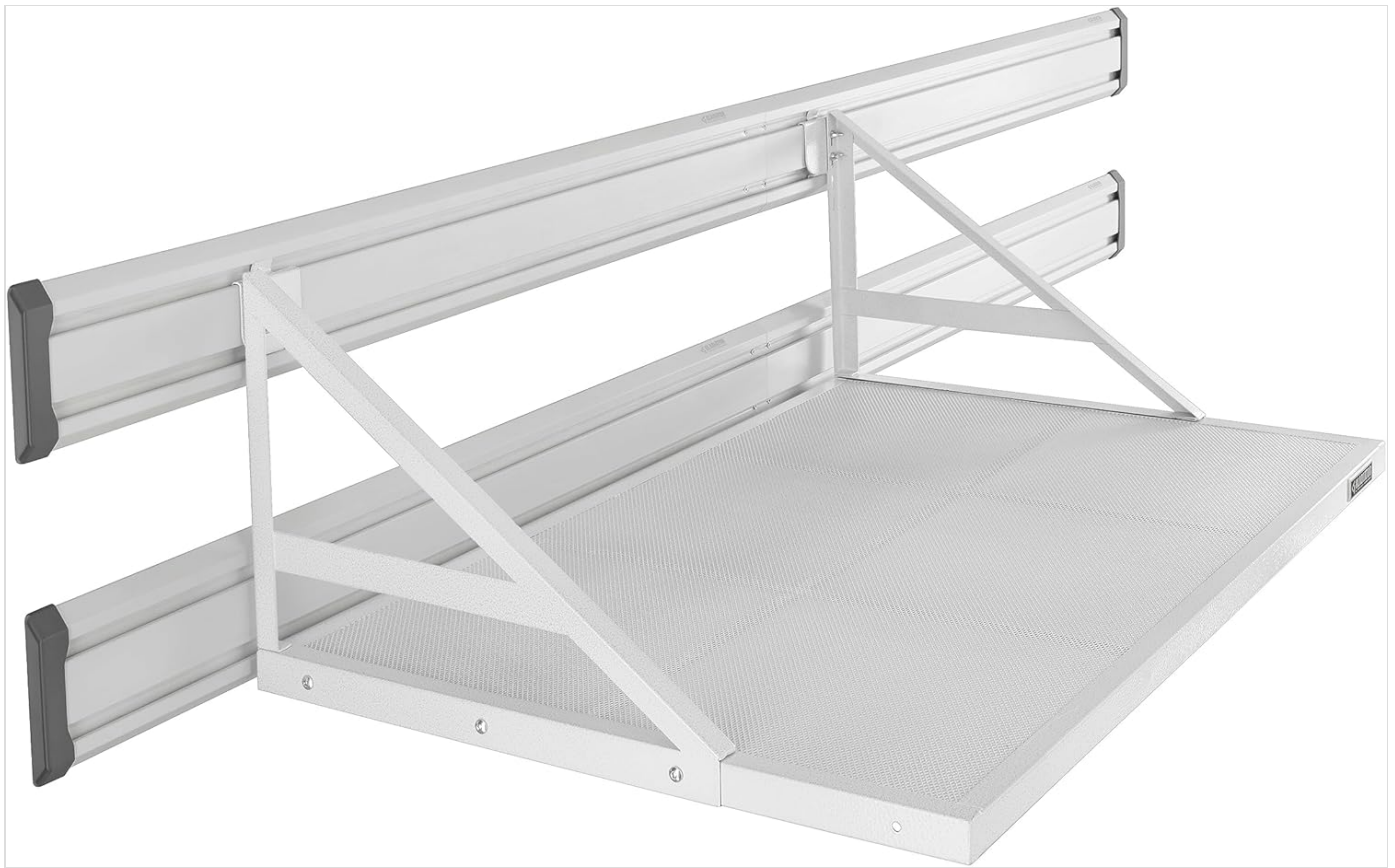
Figure 4.2.2: The shelf mounted on a Gladiator GearWall system, demonstrating the upward bracket position for a lower shelf height. This configuration is ideal for frequently accessed items.