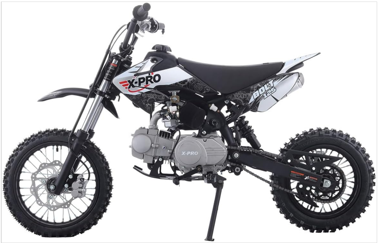
Figure 5: Side view of the X-Pro Bolt 125cc Dirt Bike, showcasing its overall design and engine.