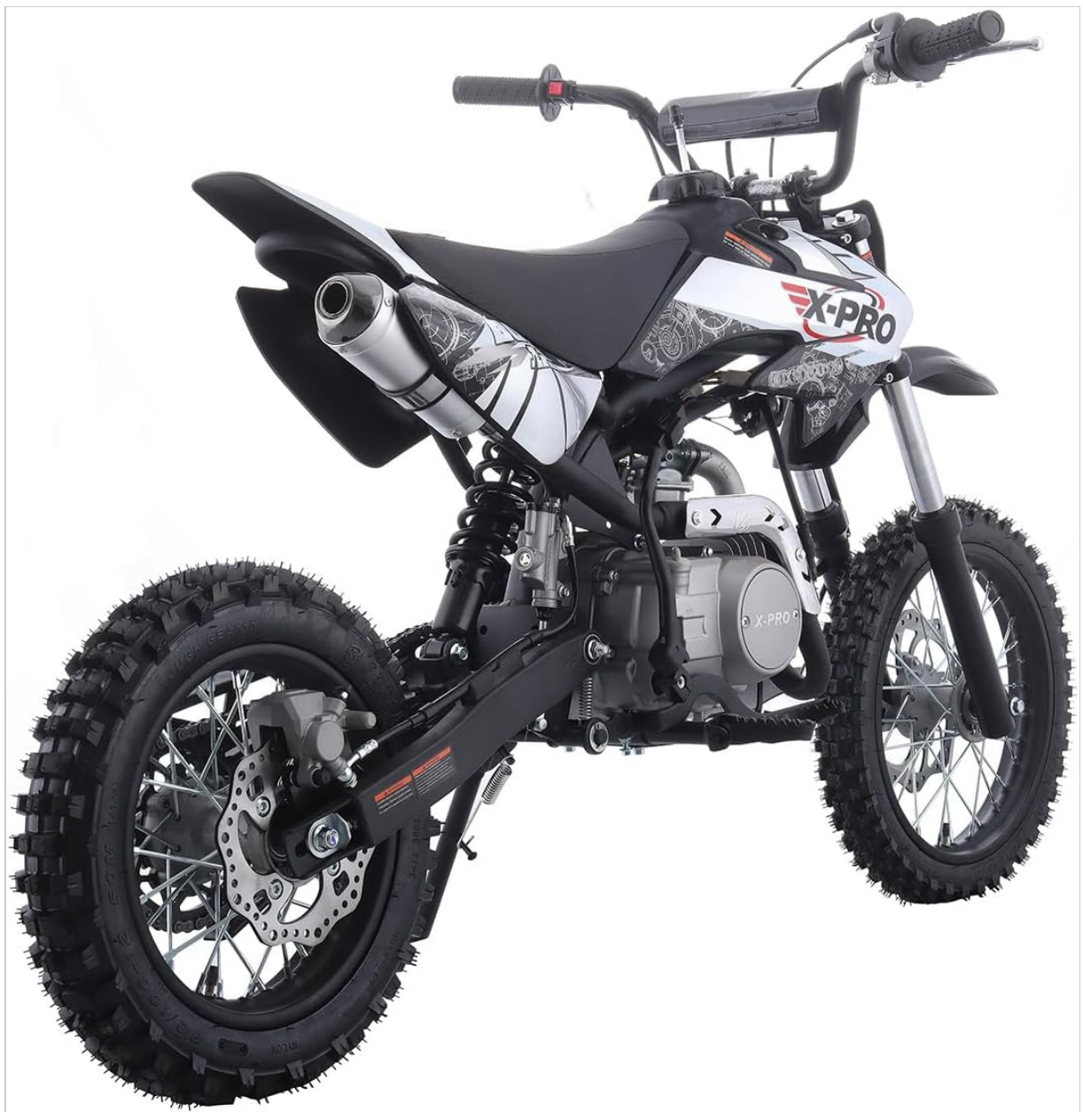
Figure 3: Rear view of the X-Pro Bolt 125cc Dirt Bike, highlighting the exhaust and rear wheel.