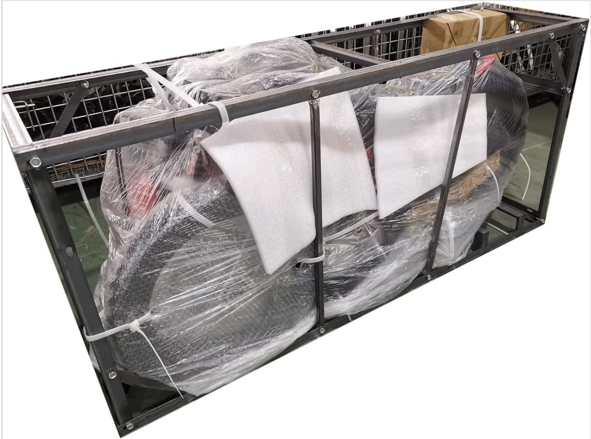
Figure 1: X-Pro Bolt 125cc Dirt Bike as received in its protective metal shipping crate.