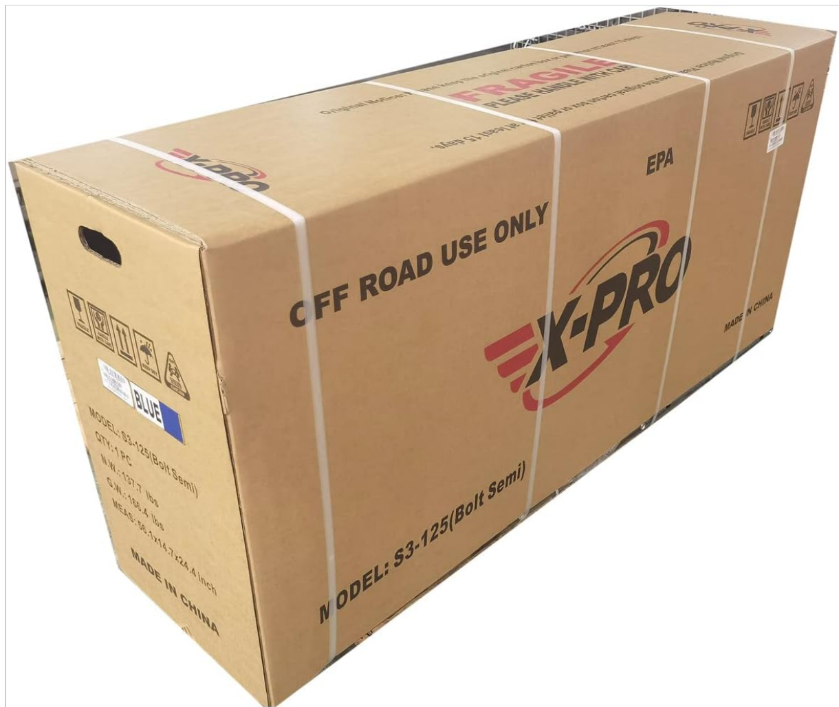
Figure 2: The exterior packaging box for the X-Pro Bolt 125cc Dirt Bike.