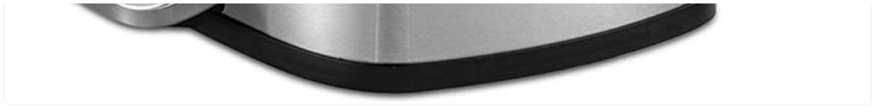
Figure 3: Inner bucket for easy bag installation.