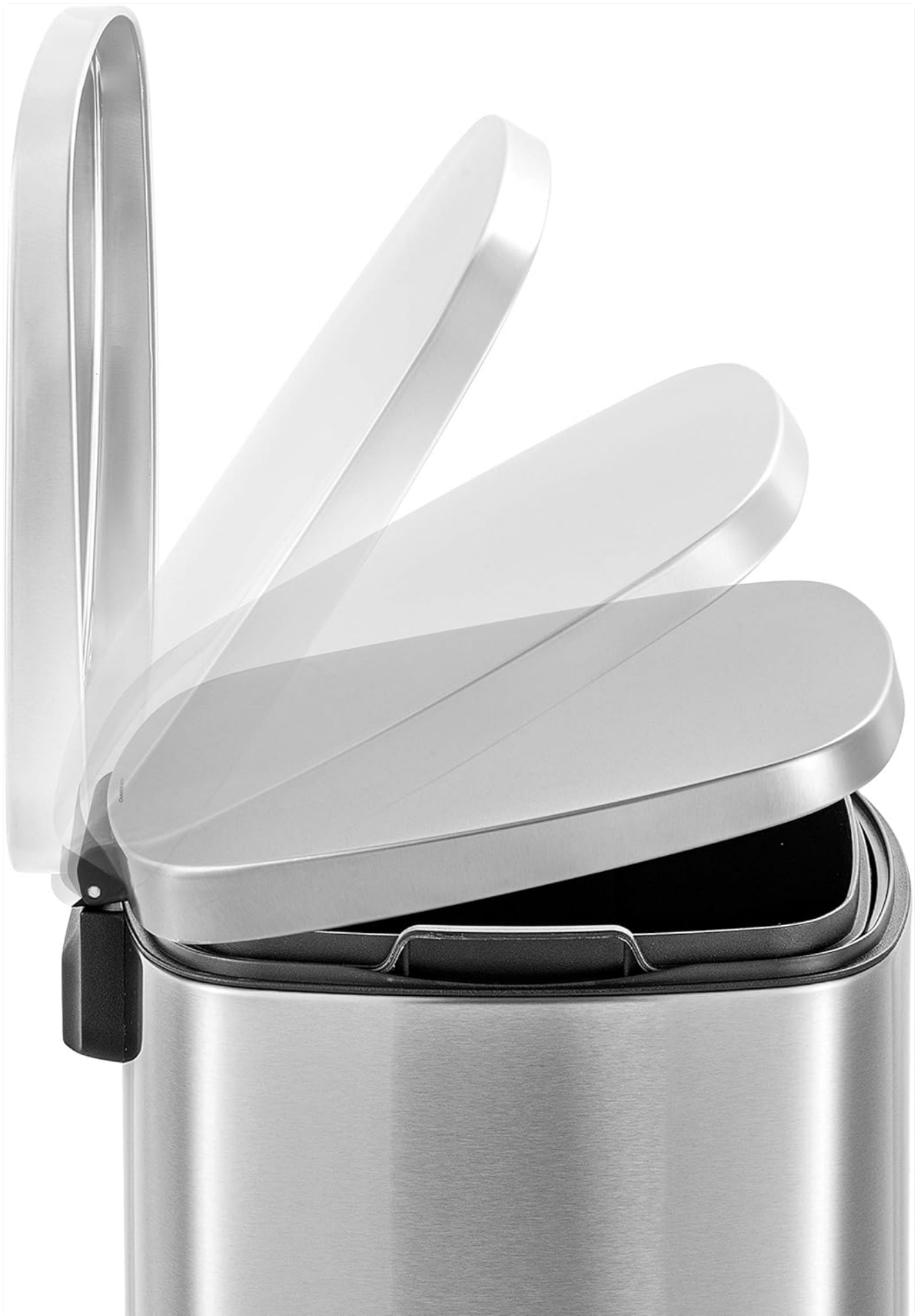
Figure 4: Illustration of the soft-close lid operation.