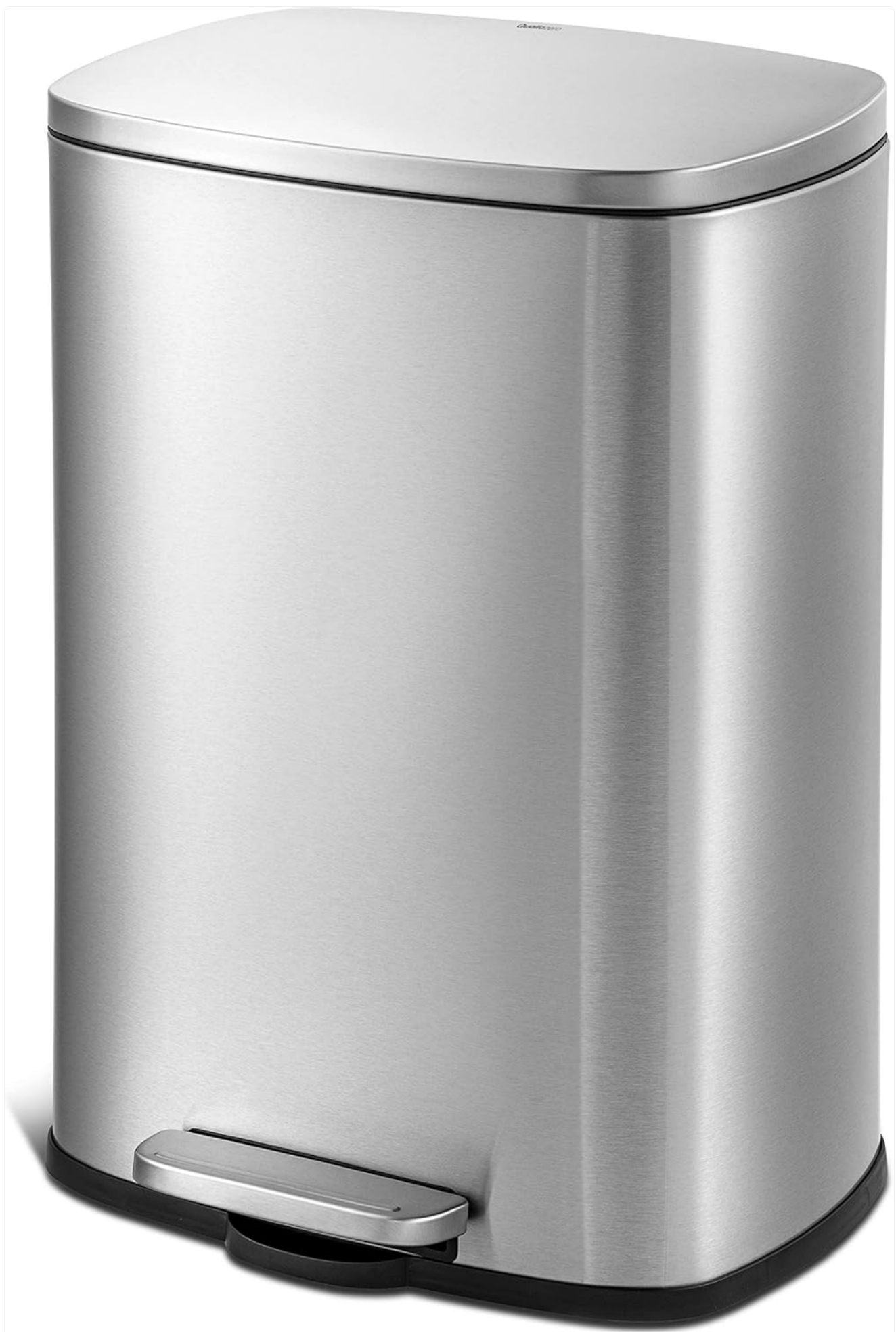
Figure 1: Front view of the QUALIAZERO 50L Stainless Steel Step Trash Can.