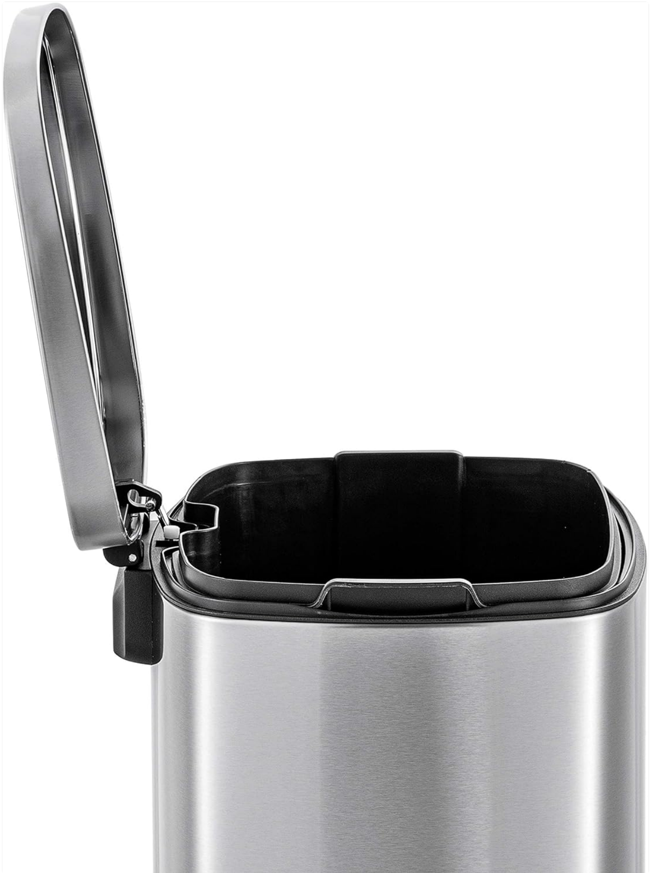
Figure 6: Internal components and inner rim.