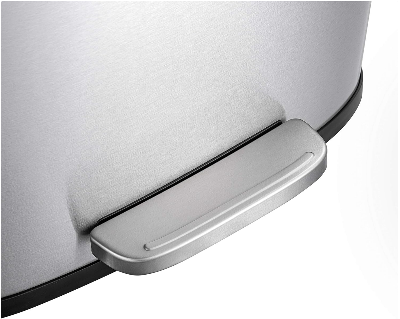
Figure 5: Detail of the durable foot pedal.