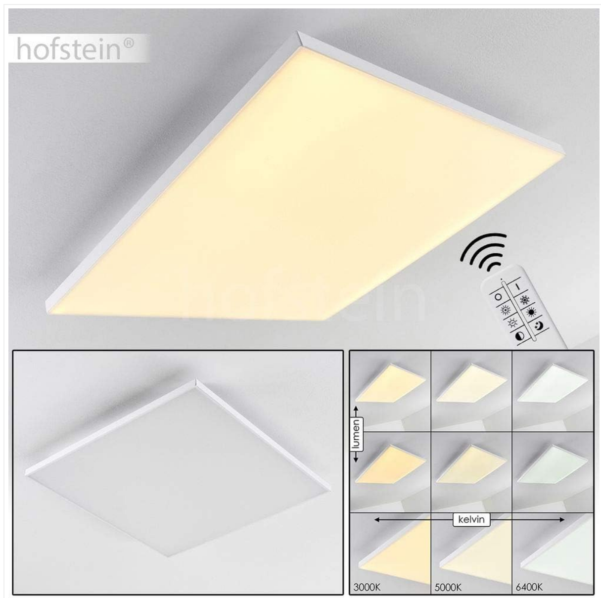
Figure 5.1: LED Panel Light with Remote Control.

The HOFSTEIN Bankura LED Panel Light is operated using the included remote control.