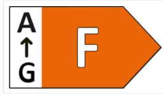
Figure 8.1: EU Energy Efficiency Label (Class F).