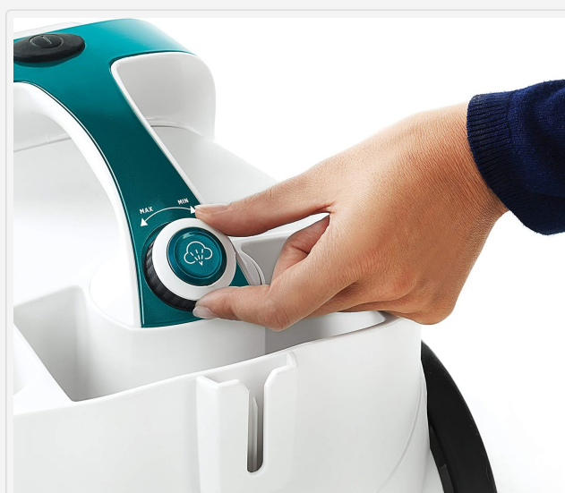
Figure 5: Steam flow adjustment dial.

Rotate the steam flow dial to select your desired steam intensity: low, medium, or high. Use higher settings for heavily soiled areas and lower settings for delicate surfaces or carpets.