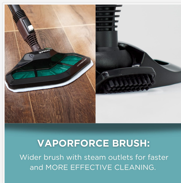
Figure 7: The Vaporforce brush for efficient floor cleaning.

Attach the Vaporforce brush with a clean floor cloth. For carpets, use the carpet glider. Move the brush back and forth over the floor. The flexible design allows for effective cleaning in various directions.