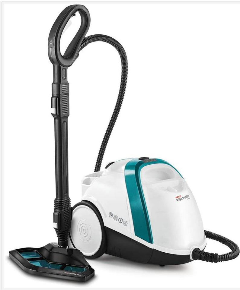
Figure 1: POLTI Vaporetto Smart 100 Steam Cleaner main unit with handle and floor brush attached.