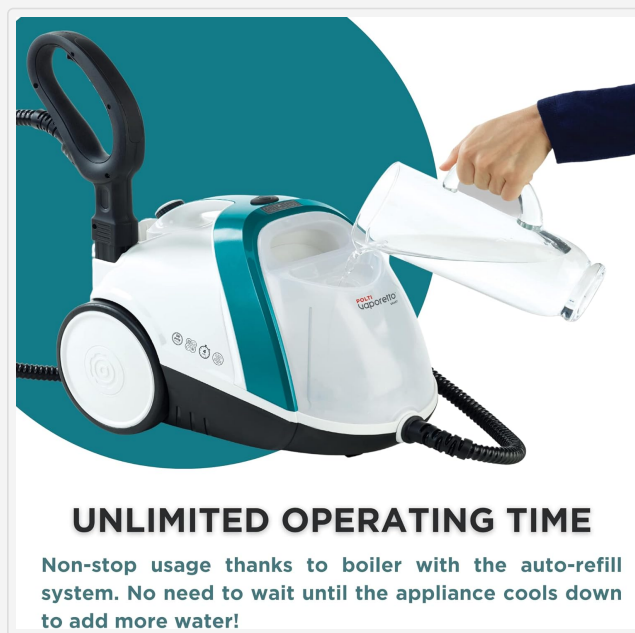
Figure 3: Filling the water tank.

Locate the water tank cap. Unscrew it and fill the tank with clean, cold tap water up to the MAX level indicated. The large 67-ounce tank provides a minimum of one hour of steam use. For optimal performance and to prevent mineral buildup, it is recommended to use distilled or demineralized water.