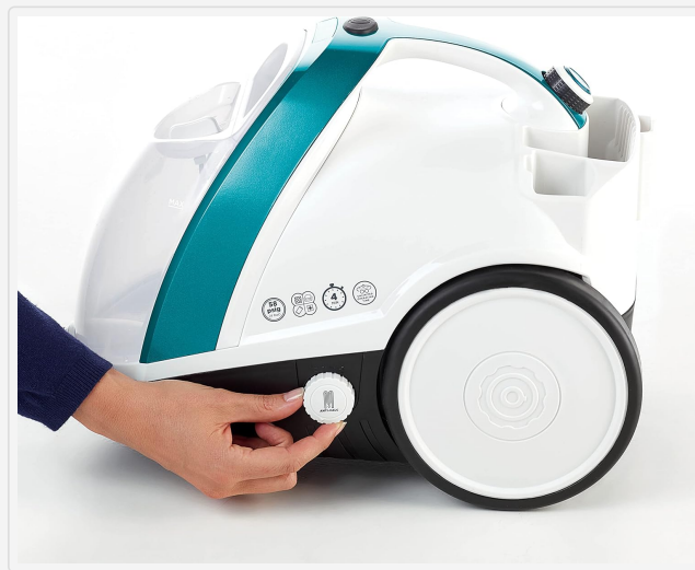
Figure 8: Location of the descaling cap.

Periodically descale the boiler to prevent mineral buildup, especially if using hard water. Refer to the full instruction manual for detailed descaling procedures and recommended descaling solutions.