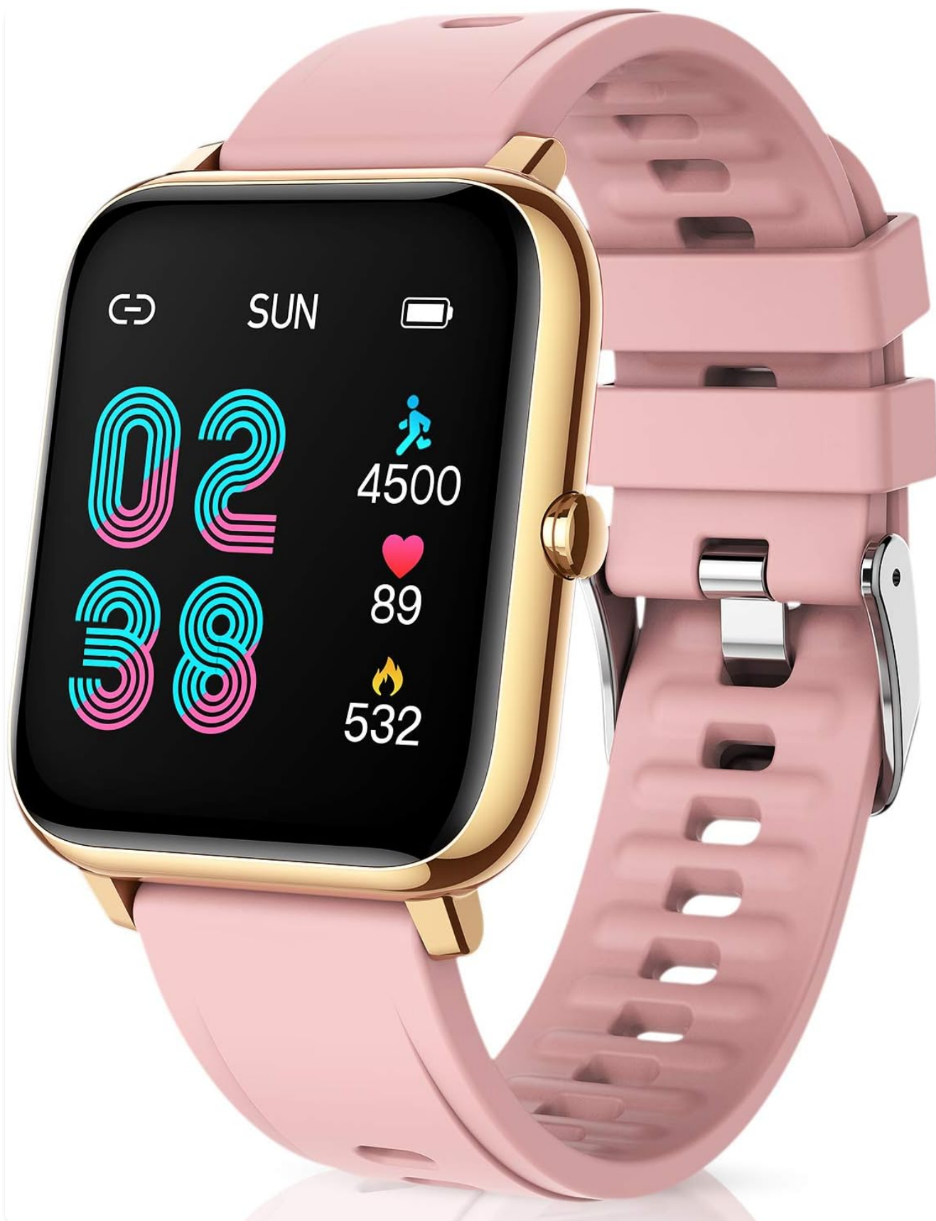
Image: The CanMixs Smart Watch, showcasing its pink silicone strap and gold-colored case, with the digital display showing time and activity metrics.