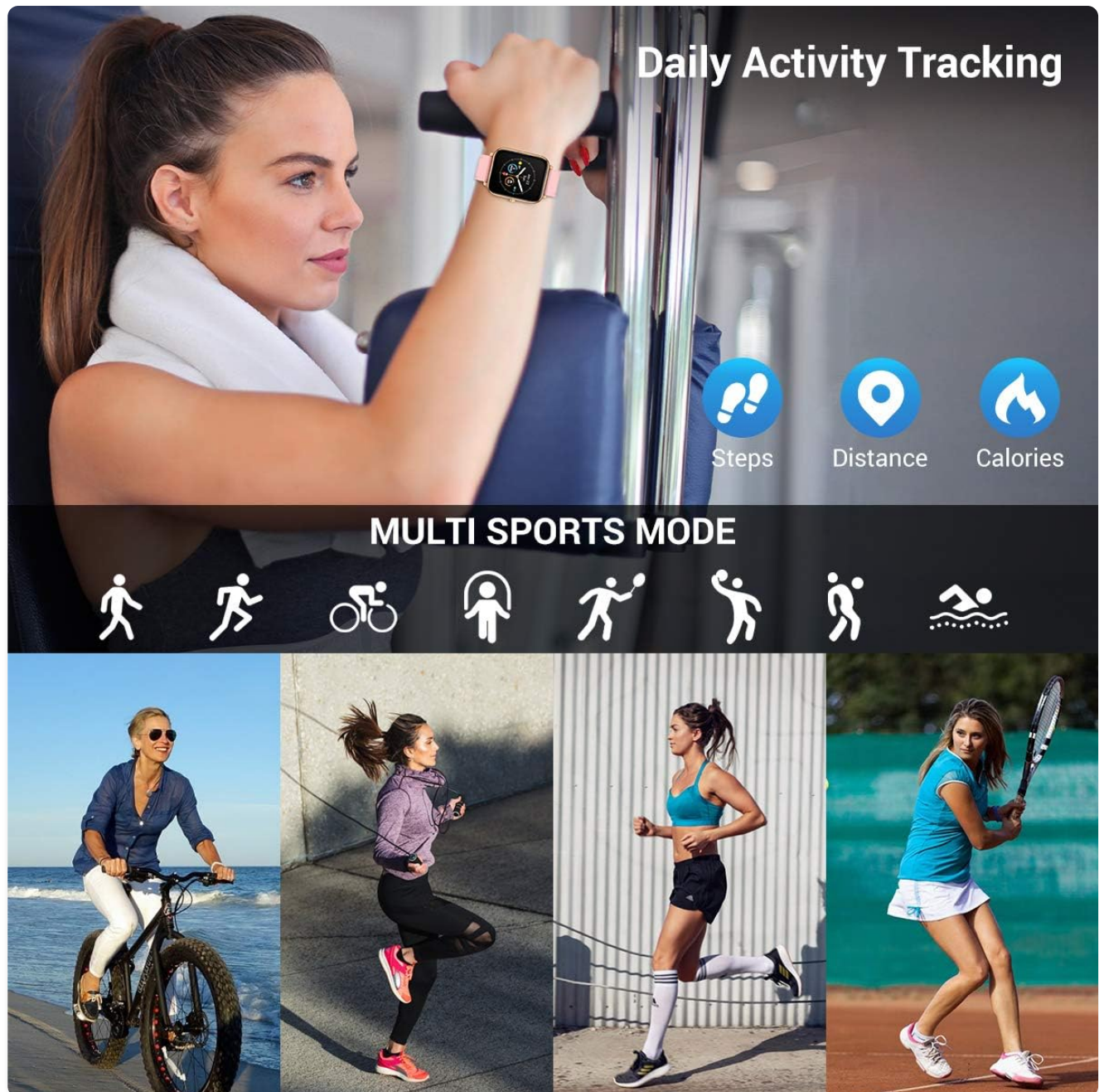
Image: Visual representation of the smart watch's multi-sport modes, showing individuals cycling, running, and playing tennis.

It tracks steps, calories burned, and can connect to your smartphone's GPS for more precise real-time pace and distance tracking during outdoor activities like running.