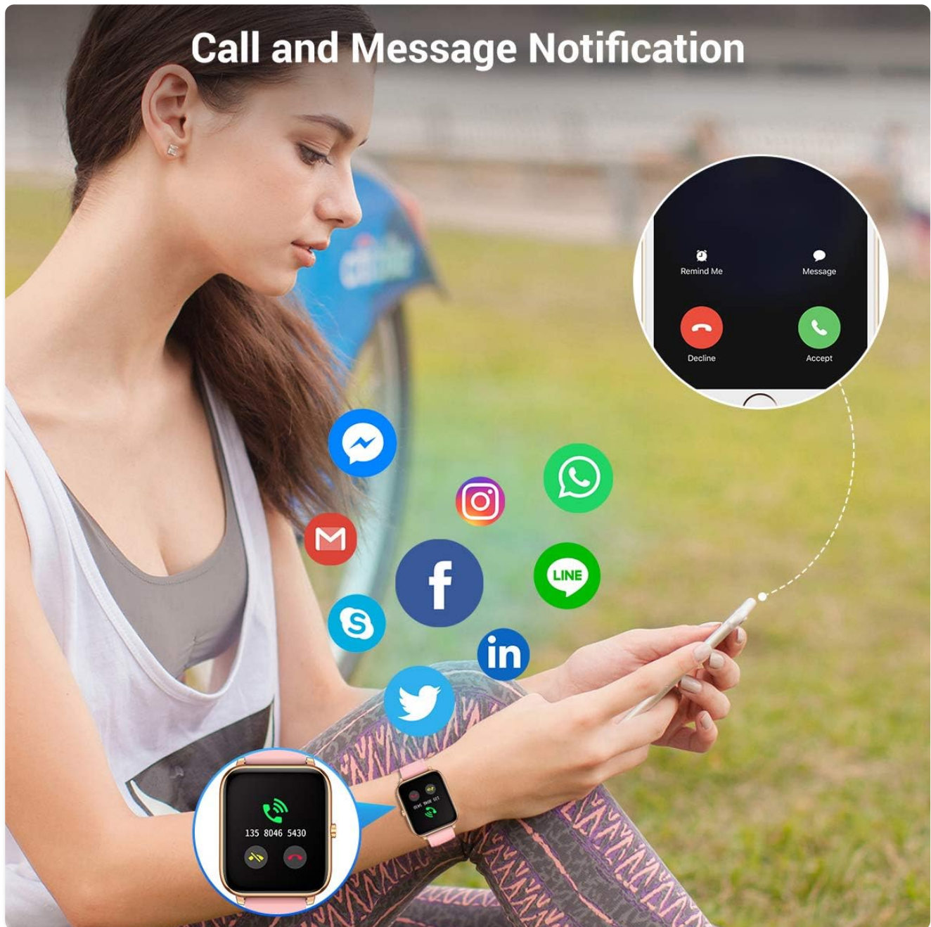
Image: The smart watch showing incoming call and message notifications, with icons for various social media and communication apps.