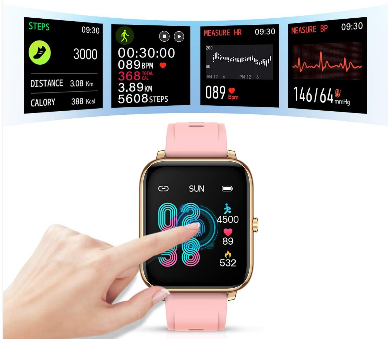
Image: The smart watch display showing different data screens for steps, heart rate, and blood pressure, highlighting its full touch screen