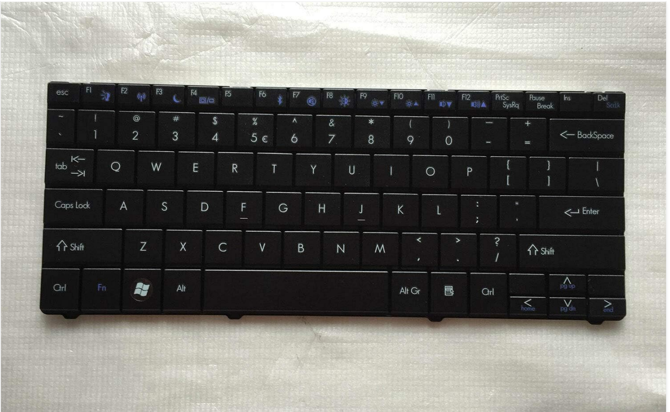
Figure 2.1: Front view of the kilter US English laptop keyboard. This image displays the full keyboard layout, including function keys, alphanumeric keys, and the numeric keypad (if present on the model), all in a standard black finish.