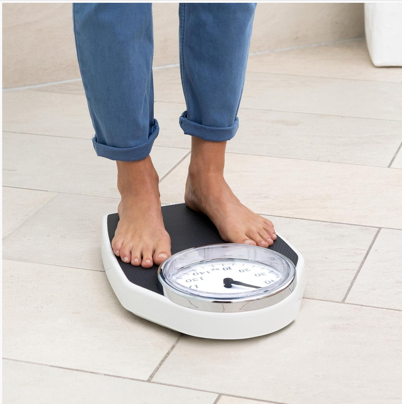
Image Description: A person's bare feet are shown standing on the Medisana PSD Mechanical Bathroom Scale, which is placed on a tiled floor. This illustrates the correct posture for weighing.