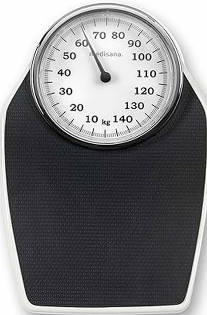
Image Description: A top-down view of the Medisana PSD Mechanical Bathroom Scale. The scale features a black weighing surface and a prominent circular analogue dial with weight markings and the Medisana logo.