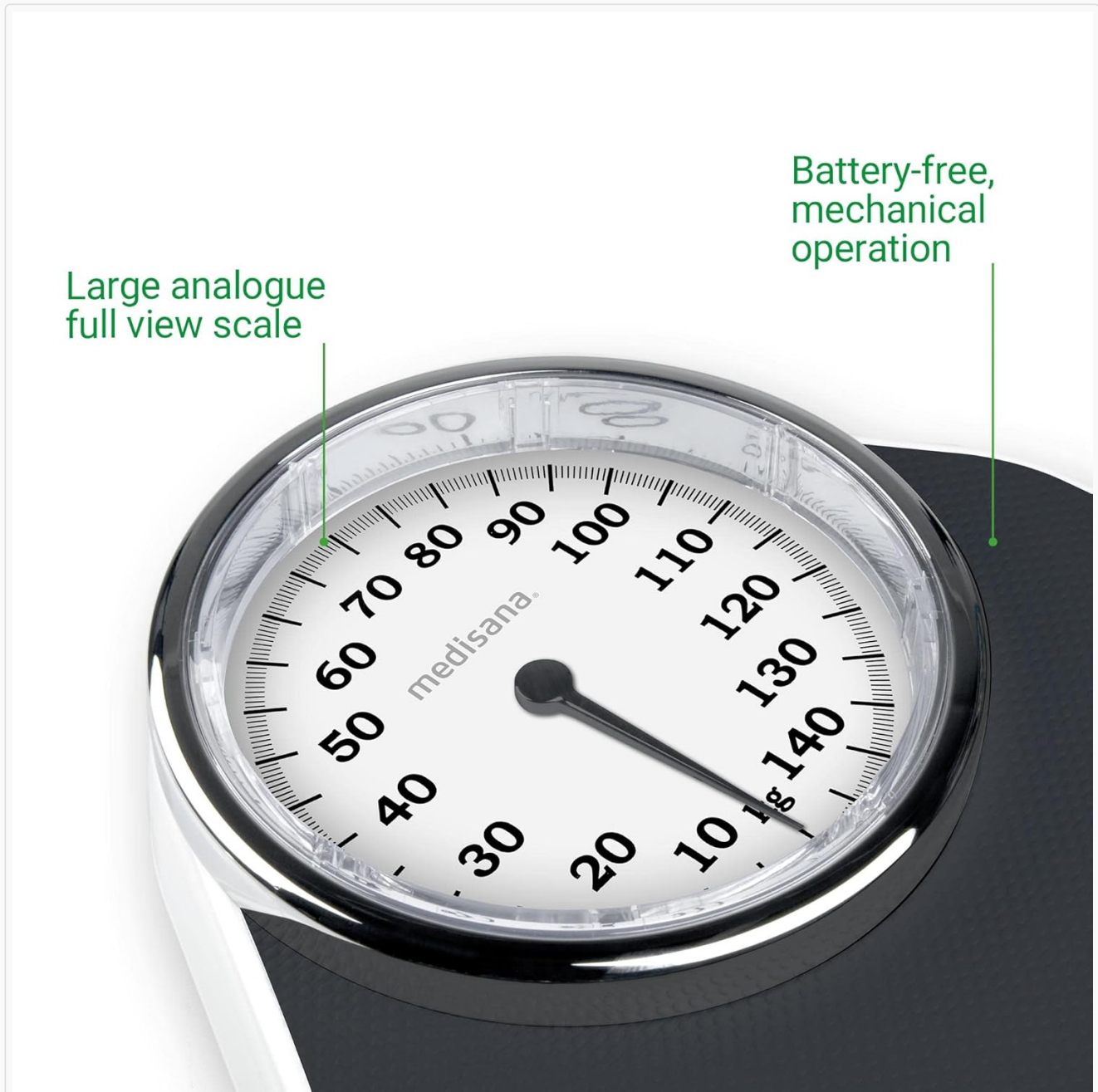
Image Description: A detailed close-up of the Medisana PSD scale's analogue dial. The dial clearly shows weight markings from 0 to 140 kg, with the Medisana logo visible. Text overlays indicate "Large analogue full view scale" and "Battery-free, mechanical operation."

Image Description: An image highlighting the key features of the Medisana PSD scale. It shows a close-up of the non-slip textured surface, an internal view of the solid metal casing, and the overall retro design of the scale.