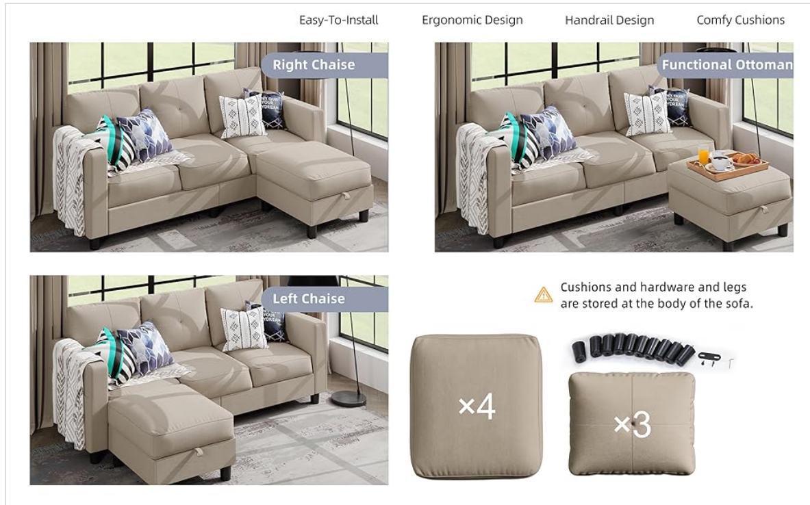
Image: The sectional sofa configured with the chaise on the right side.