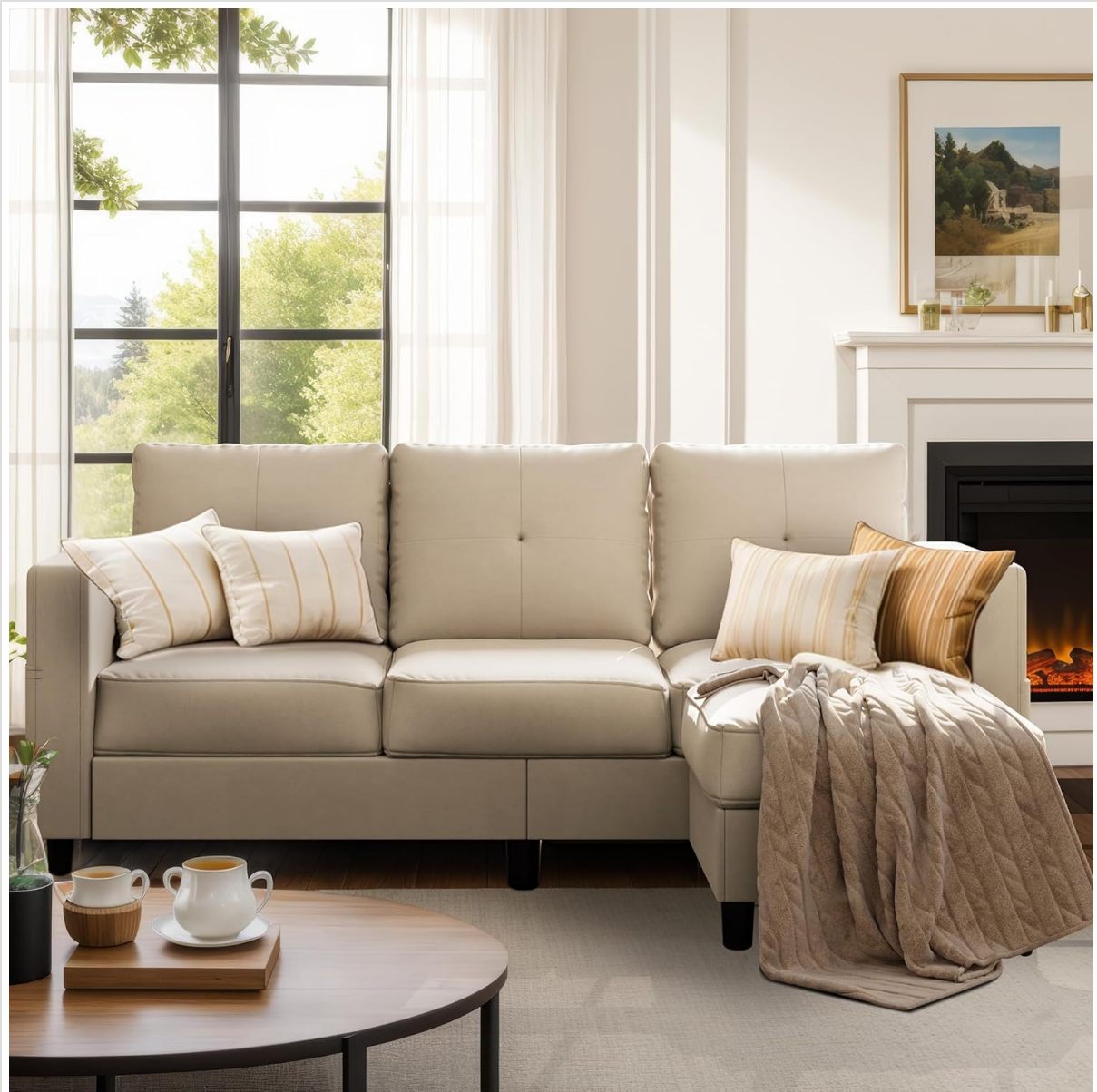
Image: The Shintenchi Convertible Sectional Sofa Couch in light brown, arranged with a chaise on the right, in a bright living room.