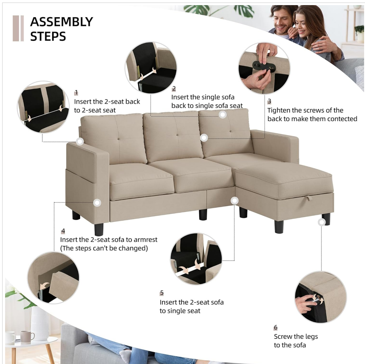
Image: Visual guide illustrating the six-step assembly process for the sectional sofa, including attaching backrests, connecting sections, and screwing in legs.