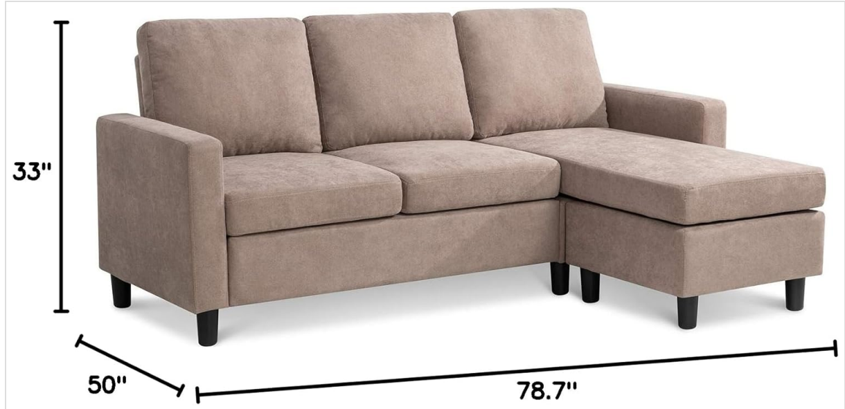
Image: Detailed dimensional drawing of the Shintenchi sectional sofa, including length, width, and height measurements.