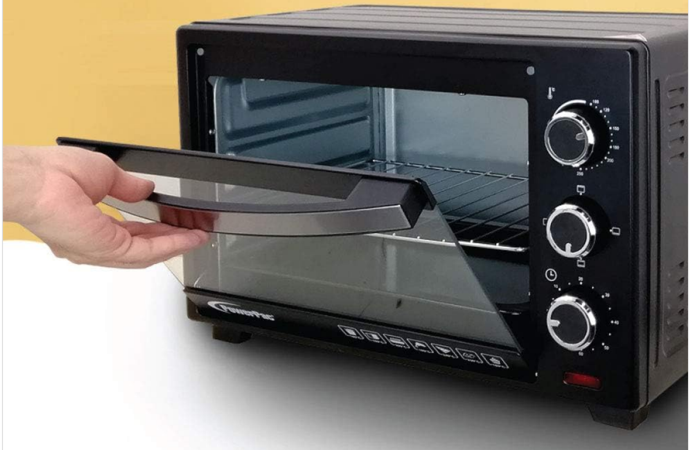
A hand demonstrating the cool-touch handle and the smooth operation of the tempered glass door on the PowerPac PPT25 Electric Oven, emphasizing safety and ease of access.

Tempered glass window with cool touch handle