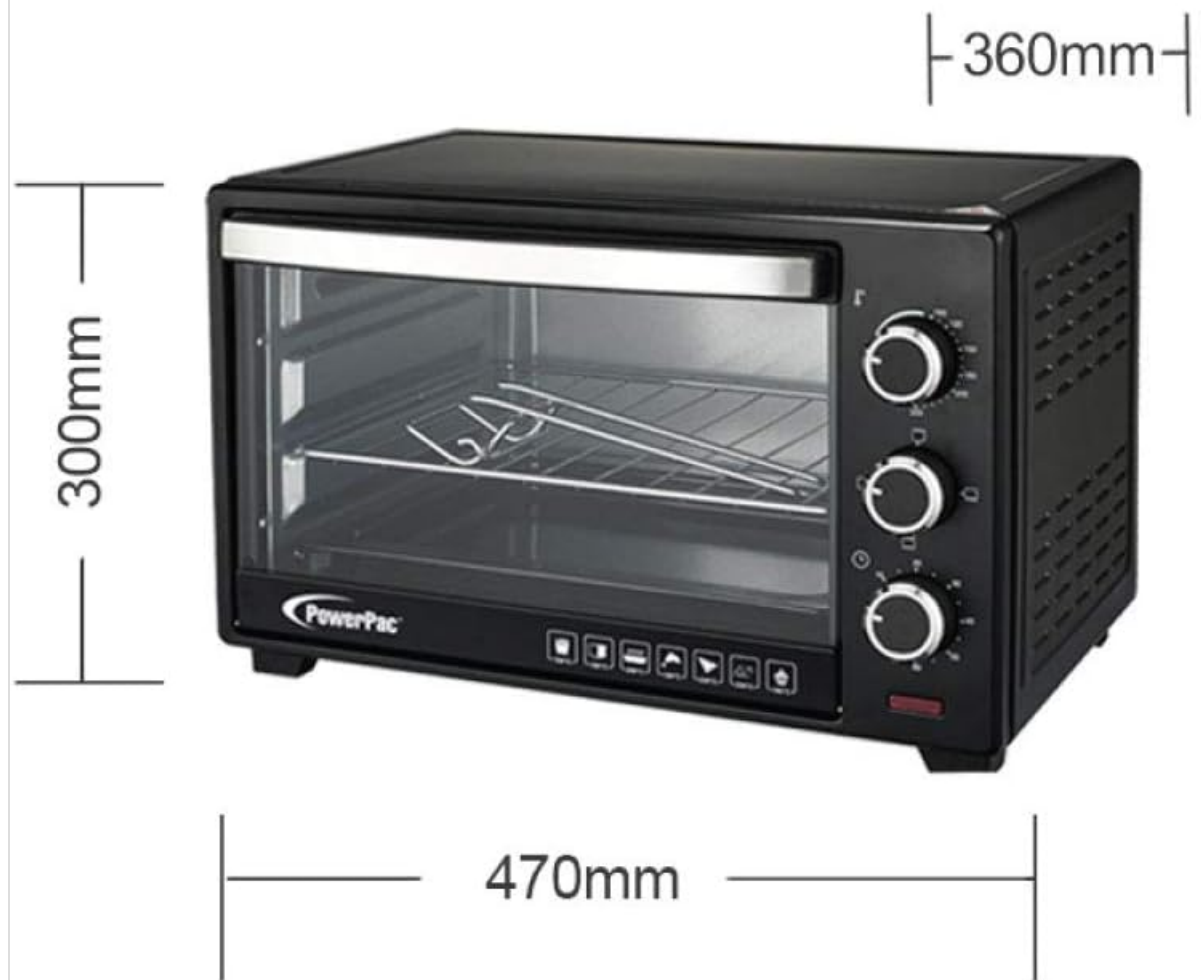
Diagram illustrating the dimensions of the PowerPac PPT25 Electric Oven, with a width of 470mm, depth of 360mm, and height of 300mm, providing clear measurements for placement.