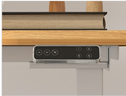
Image: Close-up of the FLEXISPOT E7B control panel, showing buttons for up, down, memory, and four preset height options.

The FLEXISPOT E7B features an intuitive control panel for height adjustment and other functions.