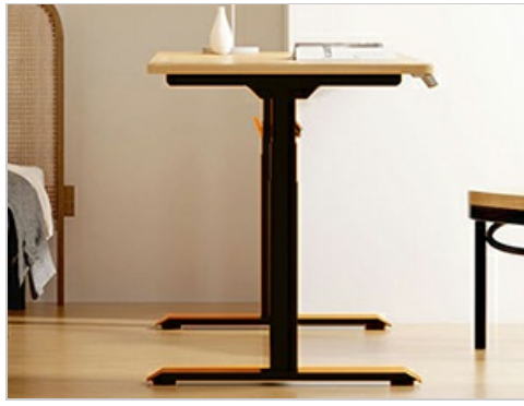
Image: Illustration of the FLEXISPOT E7B desk's obstacle detection feature, showing the desk reversing upon encountering an object.