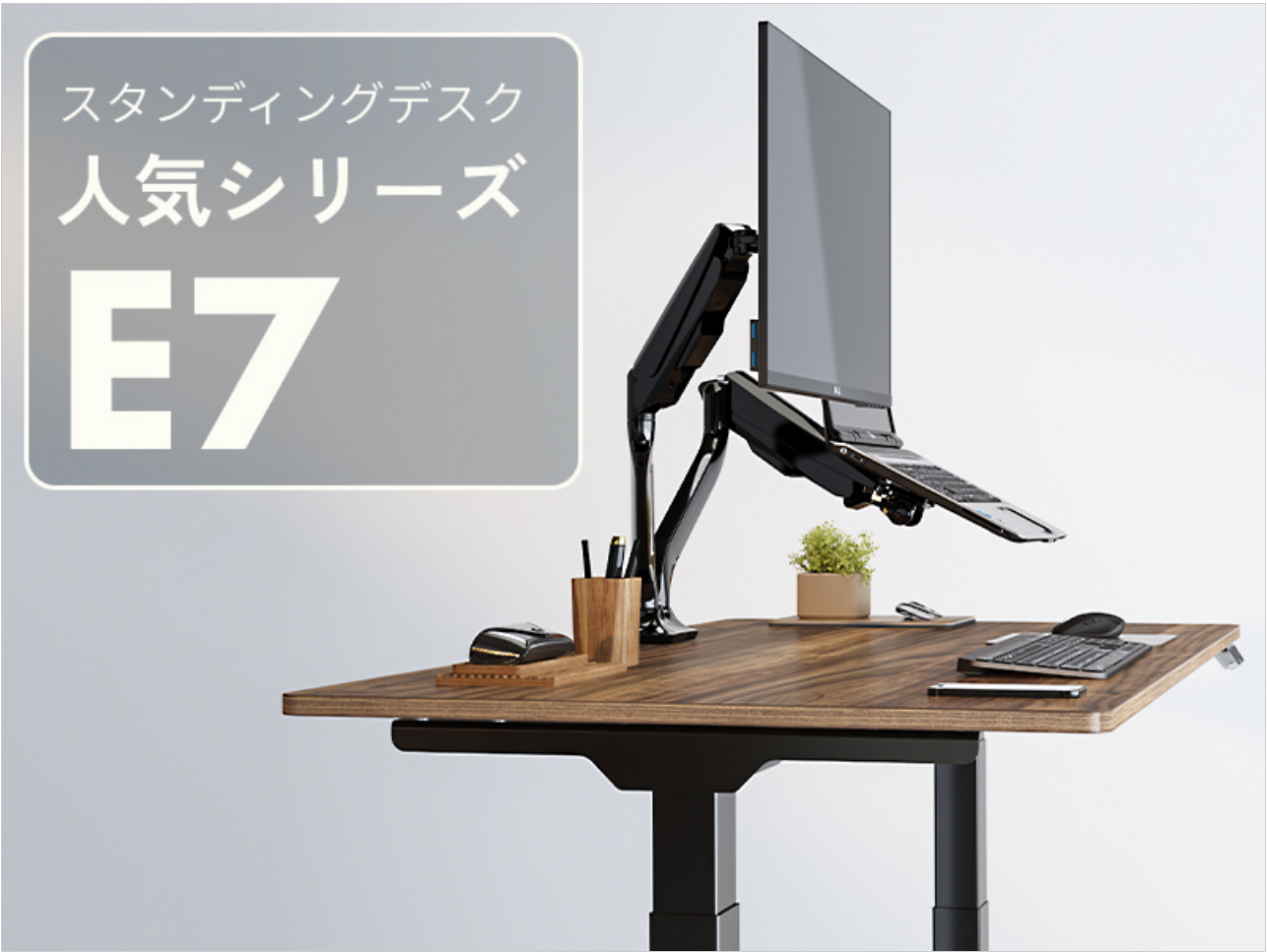
Image: The FLEXISPOT E7B Electric Standing Desk demonstrating its height adjustment range from 60.5 cm to 125.5 cm, highlighting its versatility.