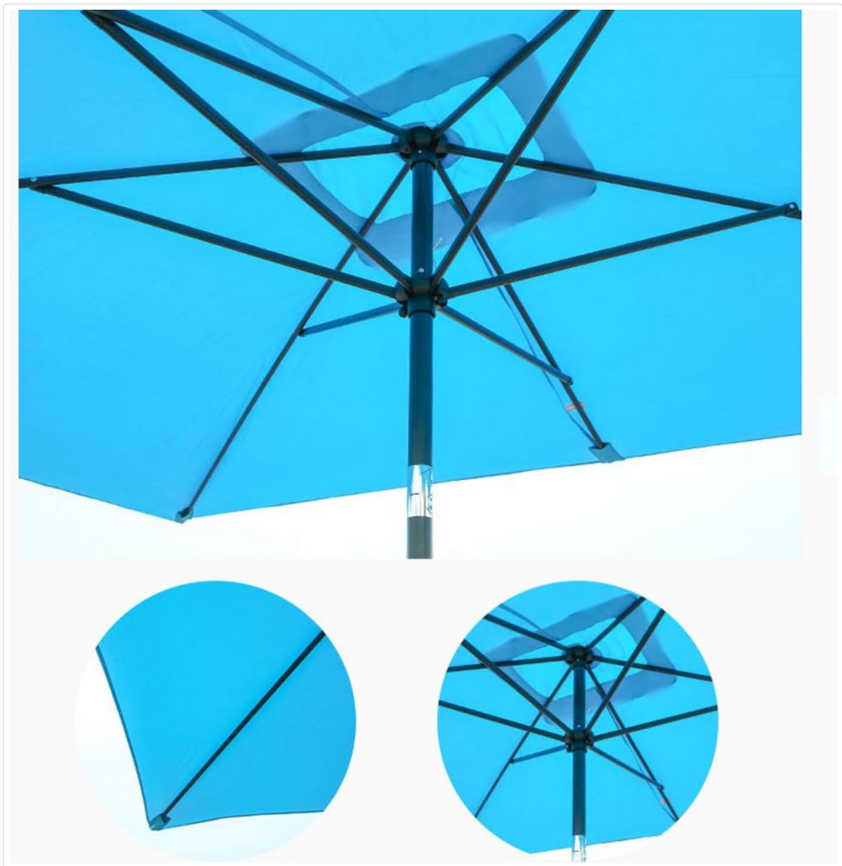
Image 5: A close-up view of the underside of the umbrella canopy, revealing the robust aluminum frame structure and ribs that support the polyester fabric. This image shows the internal construction.