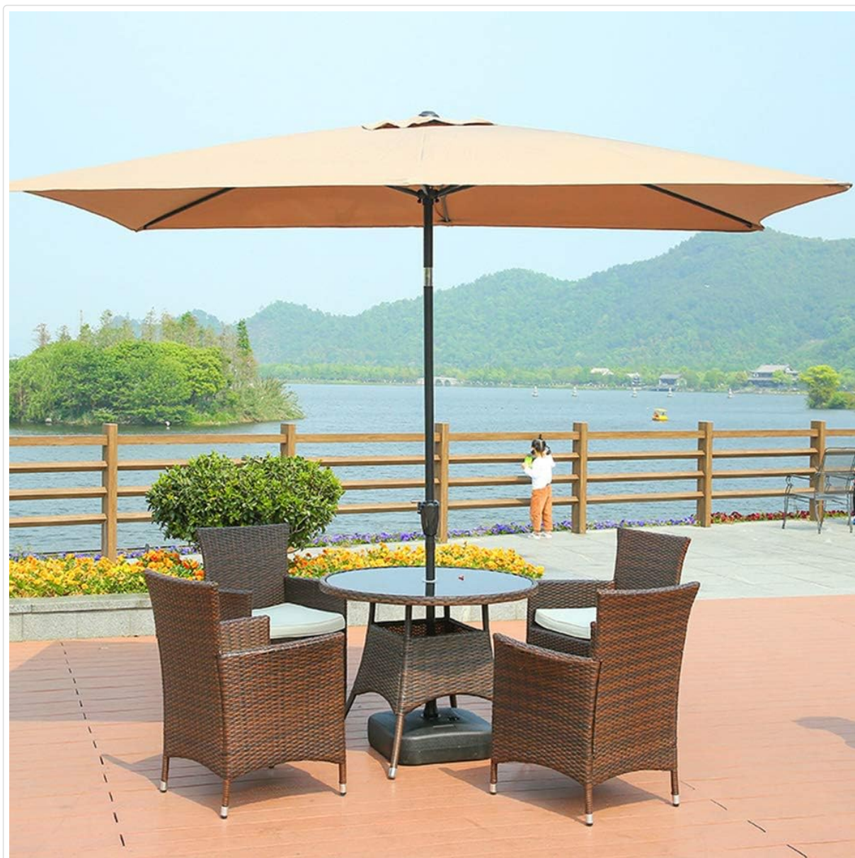
Image 3: The rectangular umbrella fully open, demonstrating its coverage over an outdoor seating area. This view highlights the canopy's shape and how it integrates with patio furniture.