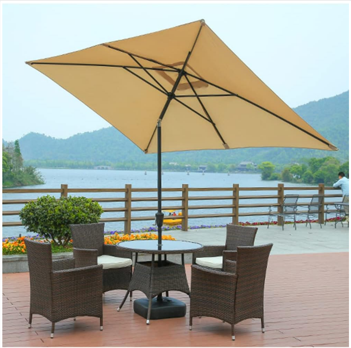
Image 1: The PARASOL rectangular umbrella in an open position, providing shade over a patio table and chairs. The canopy is a light beige color.