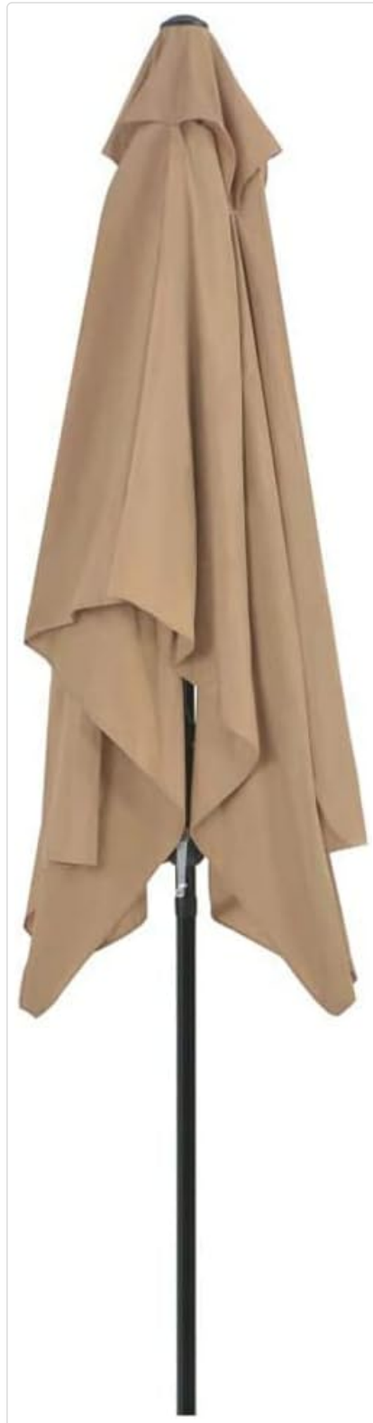
Image 4: The rectangular umbrella in a fully closed position, standing upright. This demonstrates how the canopy folds neatly around the pole for compact storage.