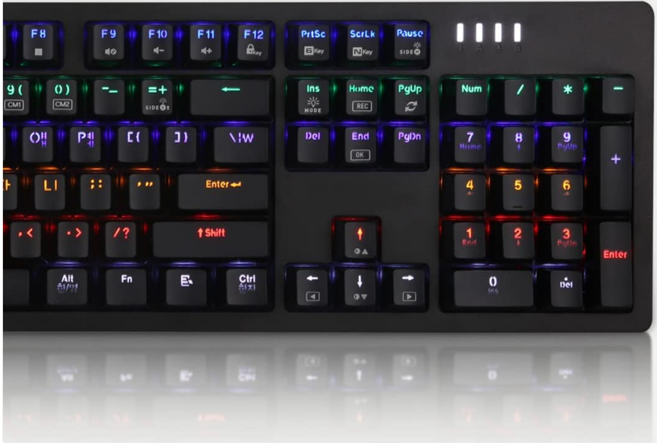
Image: A detailed view of the ABKO K515 keyboard's function keys and status indicator lights.