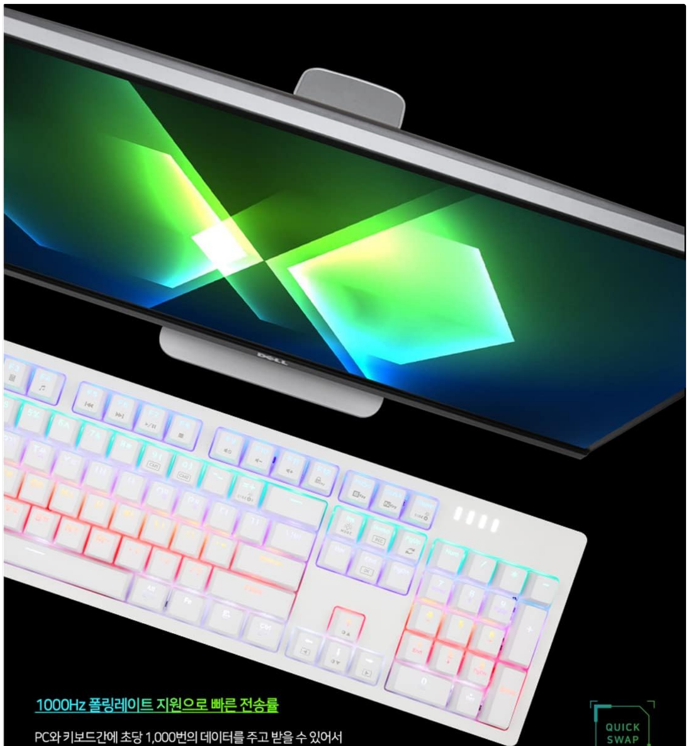
Image: The ABKO K515 keyboard connected to a computer, illustrating its high-performance capabilities with a 1000Hz polling rate.