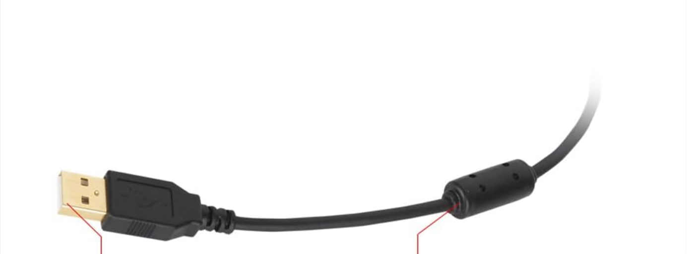
Image: The USB cable of the ABKO K515 keyboard, featuring a ferrite bead for signal stability.