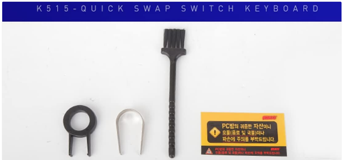
Image: The keycap puller and switch puller tools, essential for keyboard maintenance and customization.

extract the mechanical switch. Align the new switch correctly with the pins and press firmly until it clicks into place. Avoid excessive force to prevent damage to the switch or PCB.