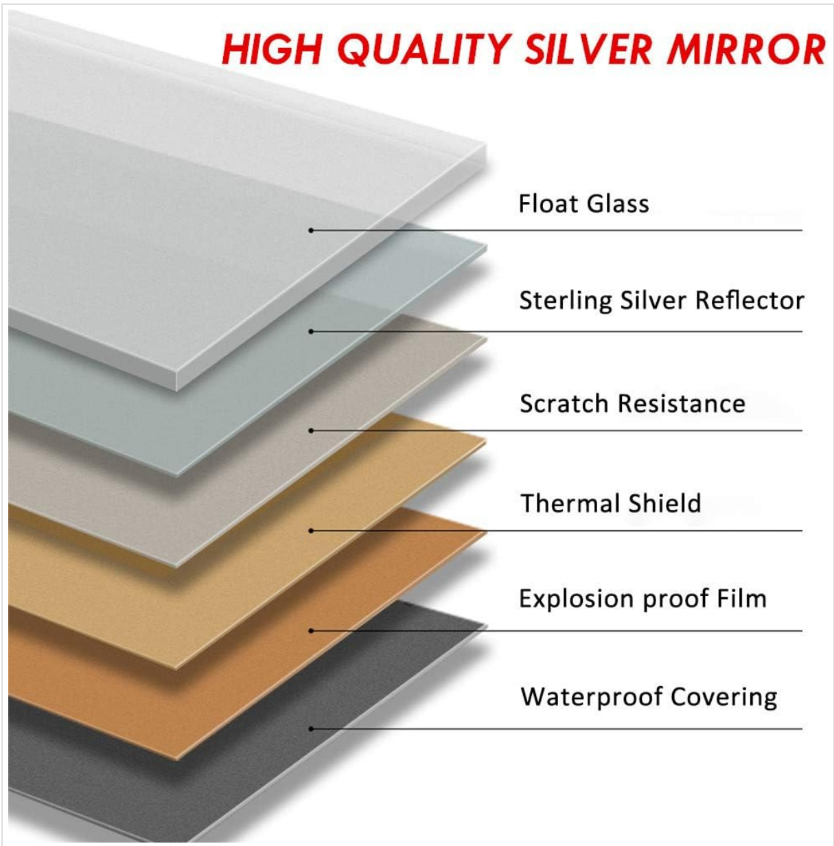
Figure 6: High-quality silver mirror construction layers.