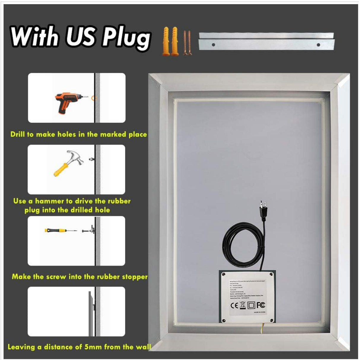
Figure 2: Visual guide for wall mounting the mirror.