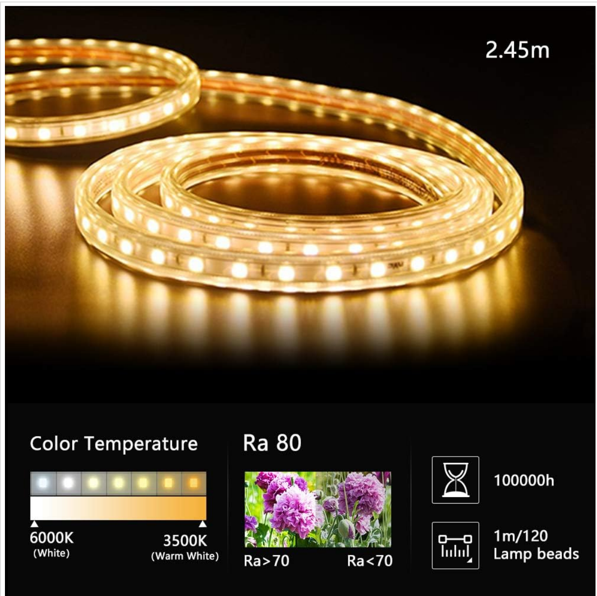
Figure 4: Details on LED color temperature and lifespan.