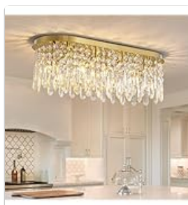
Figure 6.1: E26 Edison bulbs recommended.

This image shows the recommended E26 Edison bulbs, which complement the industrial design of the fan and provide warm lighting.