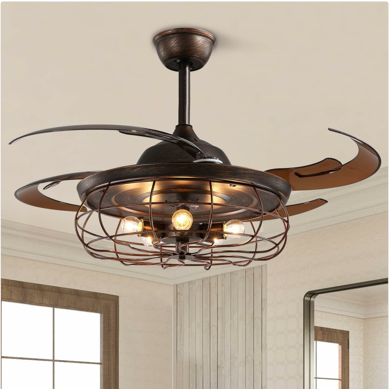
Figure 2.1: Siljoy 48-inch retractable ceiling fan with light, blades retracted.

This image shows the Siljoy retractable ceiling fan with its blades folded in, presenting a compact, chandelier-like appearance. The industrial rust caged design is visible, housing the light bulbs.