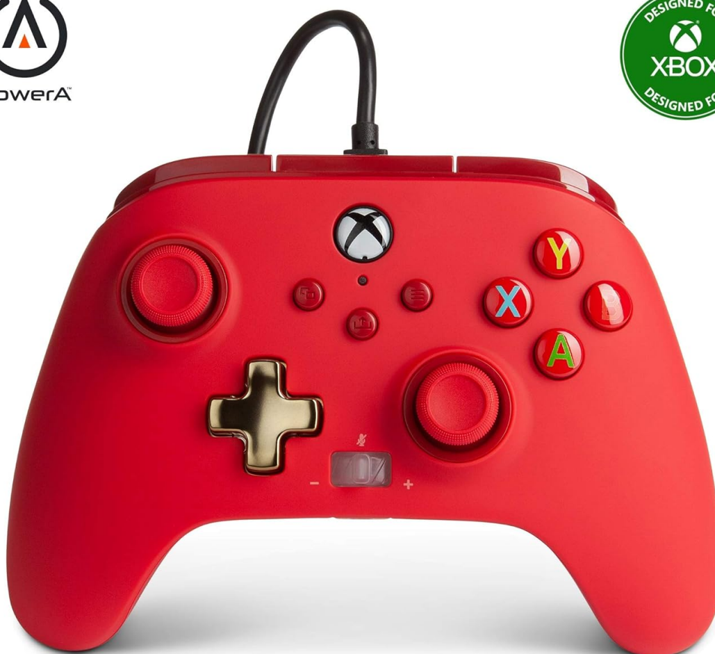
Image: Front view of the PowerA Enhanced Wired Controller in red, featuring the Xbox button, analog sticks, D-pad, and face buttons.