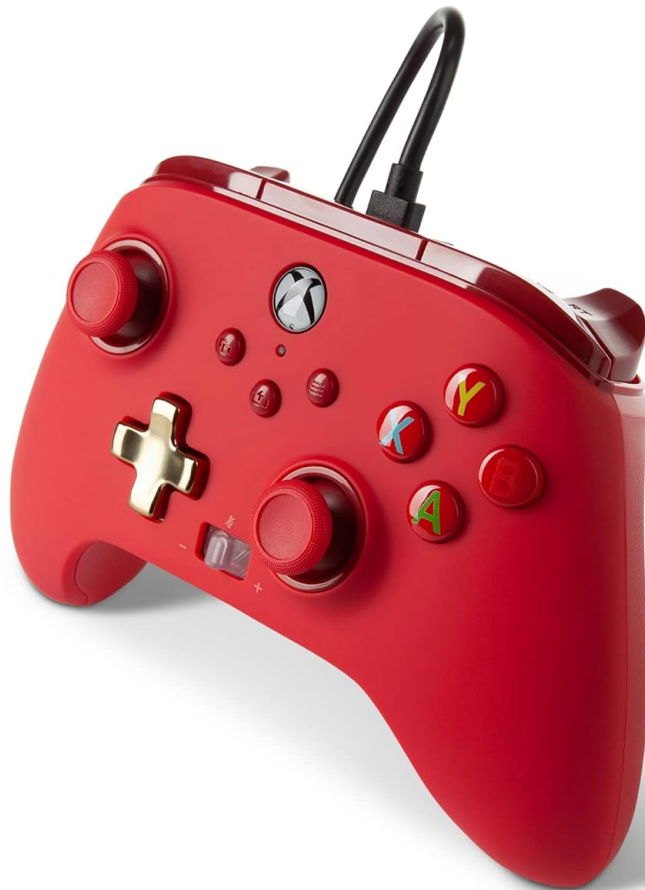
Image: Close-up view of the PowerA Enhanced Wired Controller showing the USB-C port on the top edge and the detachable USB cable being inserted.