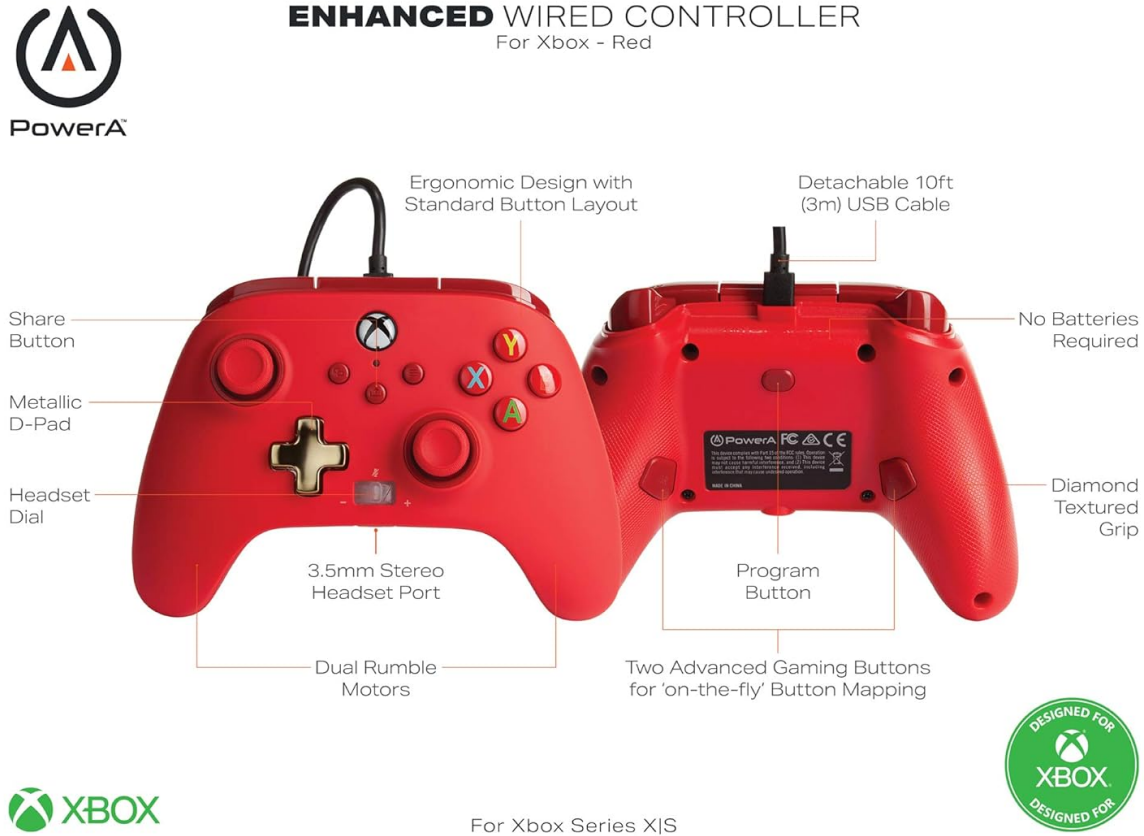
Image: Diagram of the PowerA Enhanced Wired Controller highlighting various buttons and features such as the Share Button, Metallic D-Pad, Headset Dial, 3.5mm Stereo Headset Port, Dual Rumble Motors, Program Button, and Advanced Gaming Buttons.

The PowerA Enhanced Wired Controller features a standard Xbox button layout. Refer to the image below for button identification.