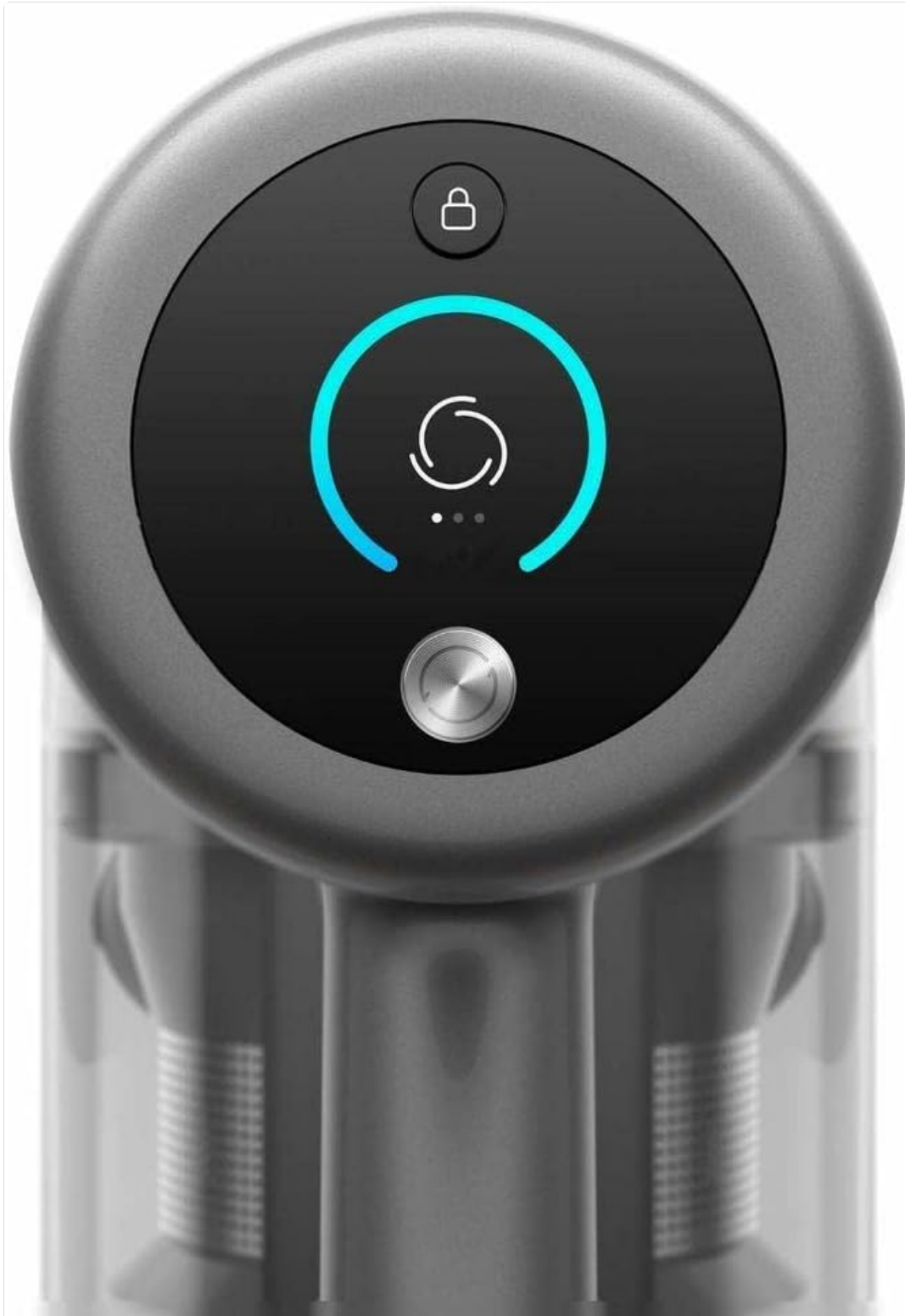
Image: A detailed view of the Dreame V11's digital display, which provides real-time information on battery status, current power mode, and maintenance alerts.

The digital display provides real-time information about the vacuum cleaner's status, including: