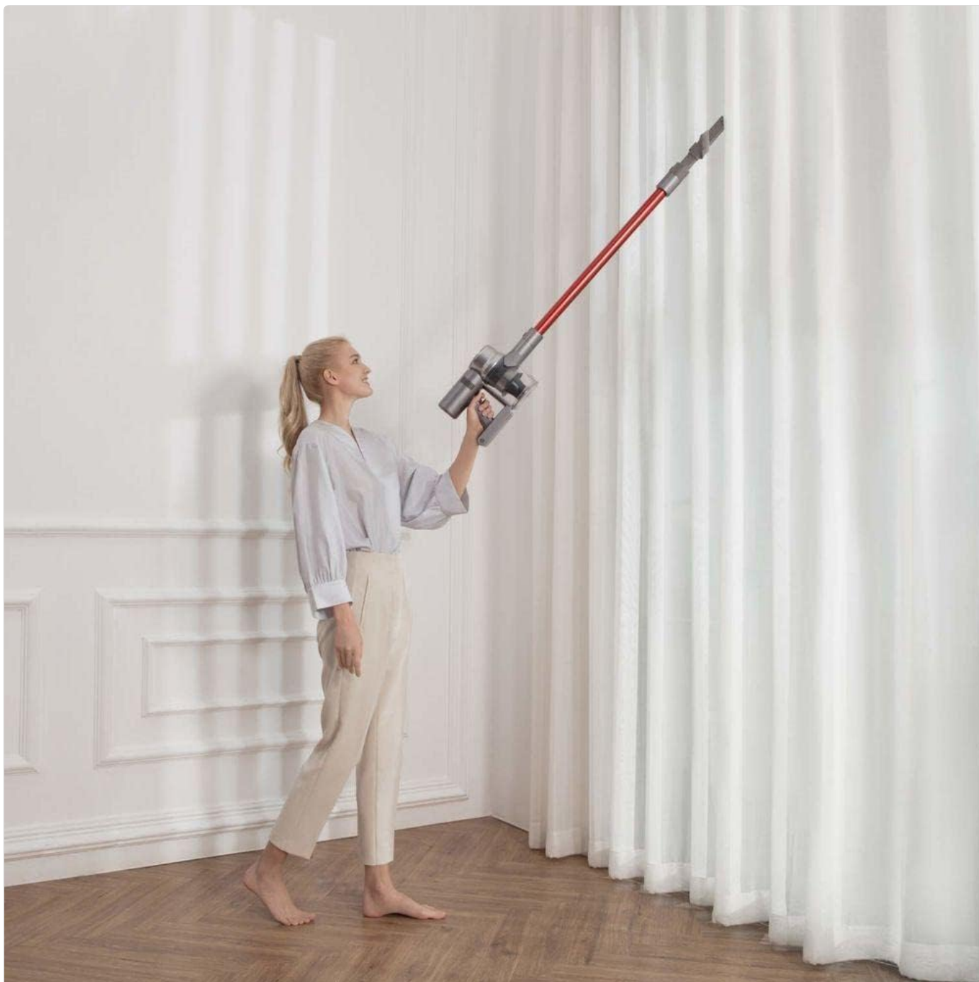
Image: A woman demonstrating the versatility of the Dreame V11 by using it to clean high curtains, showcasing its lightweight design and ability to reach elevated areas.