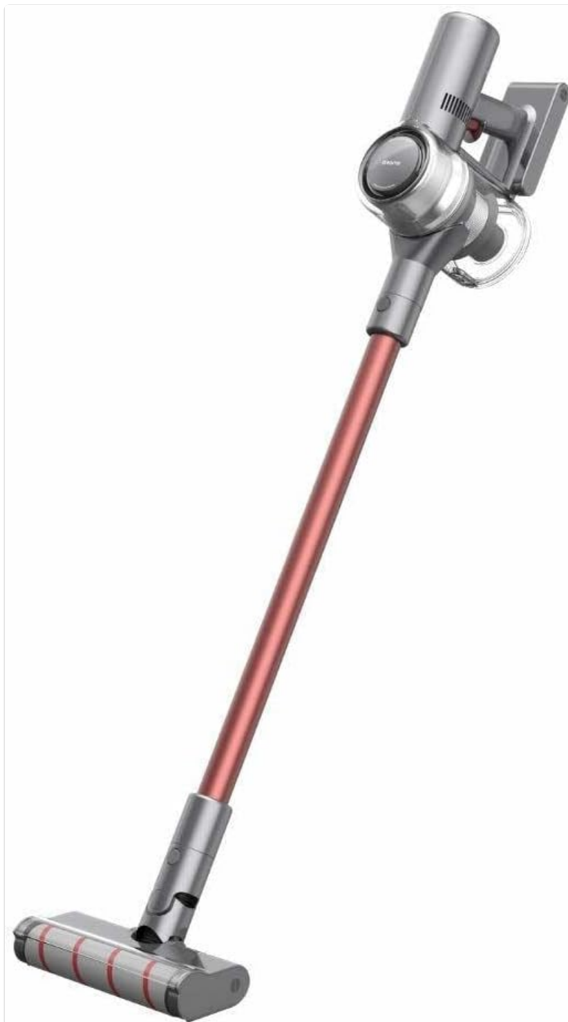
Image: The fully assembled Dreame V11 cordless vacuum cleaner, showcasing its sleek design with a red extension rod and grey main unit and brush head.

Familiarize yourself with the different parts of your Dreame V11 vacuum cleaner.