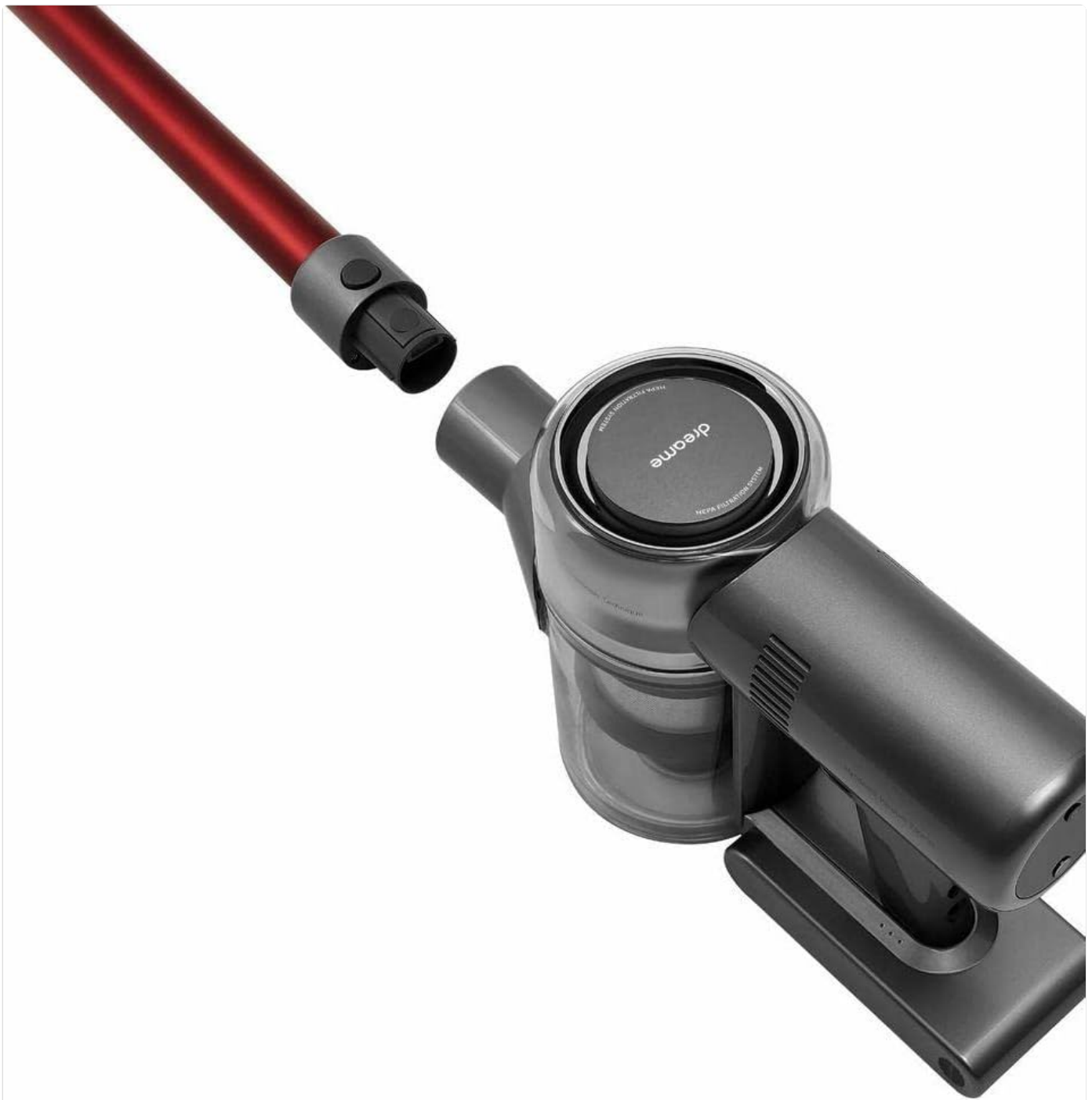
Image: Illustrates the process of detaching the red extension rod from the grey main unit of the Dreame V11, demonstrating the modular design for easy assembly and disassembly.