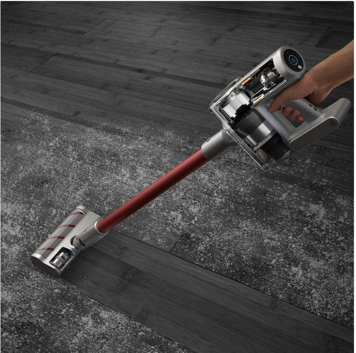
Image: The Dreame V11 vacuum cleaner actively cleaning a floor covered in debris, with a transparent view of its internal motor and dust collection system, highlighting its powerful suction.