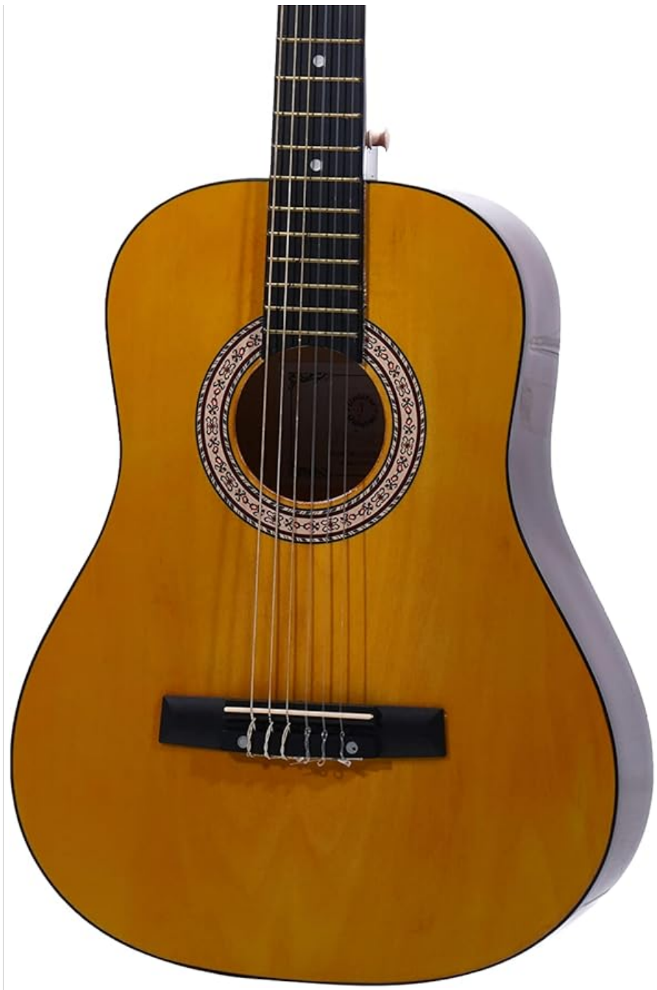
Image: Full front view of the Unistar L-300-36-N classical guitar, highlighting its body, fretboard, and headstock.