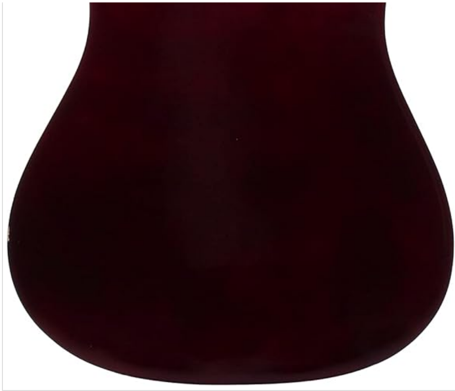
Image: Rear view of the Unistar classical guitar, displaying the dark finish of the back and neck.