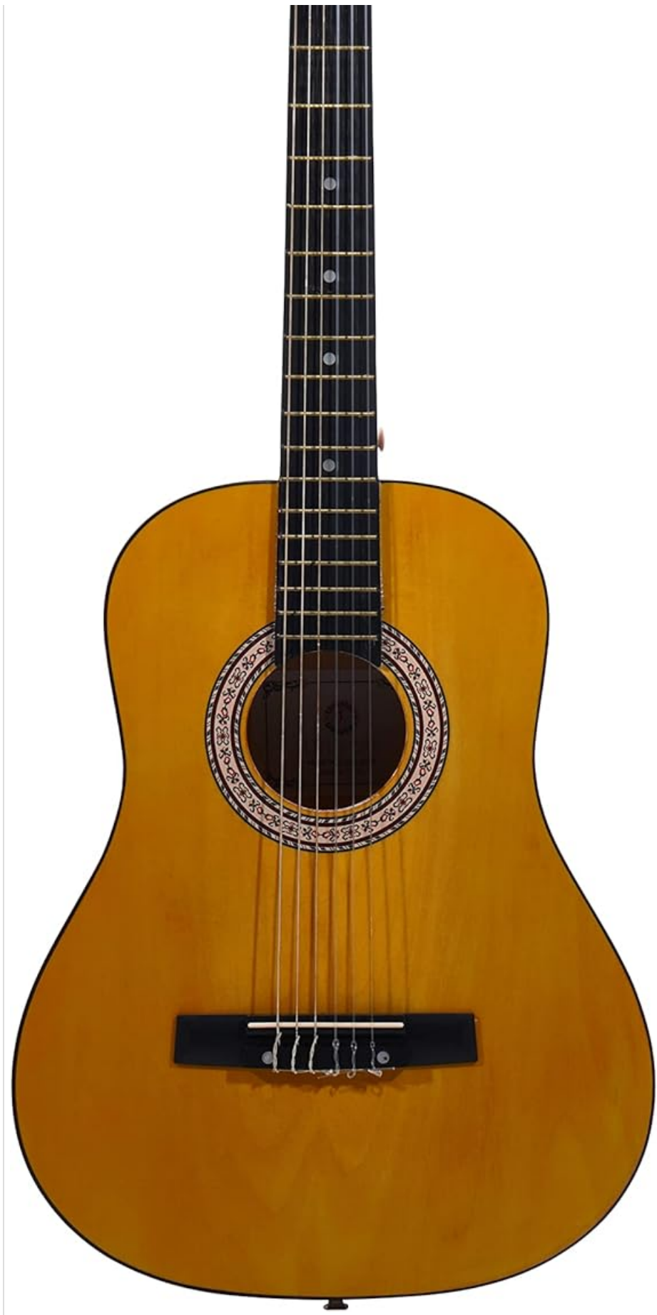
Image: A slightly different angle of the guitar's front, emphasizing the soundhole rosette and bridge area.