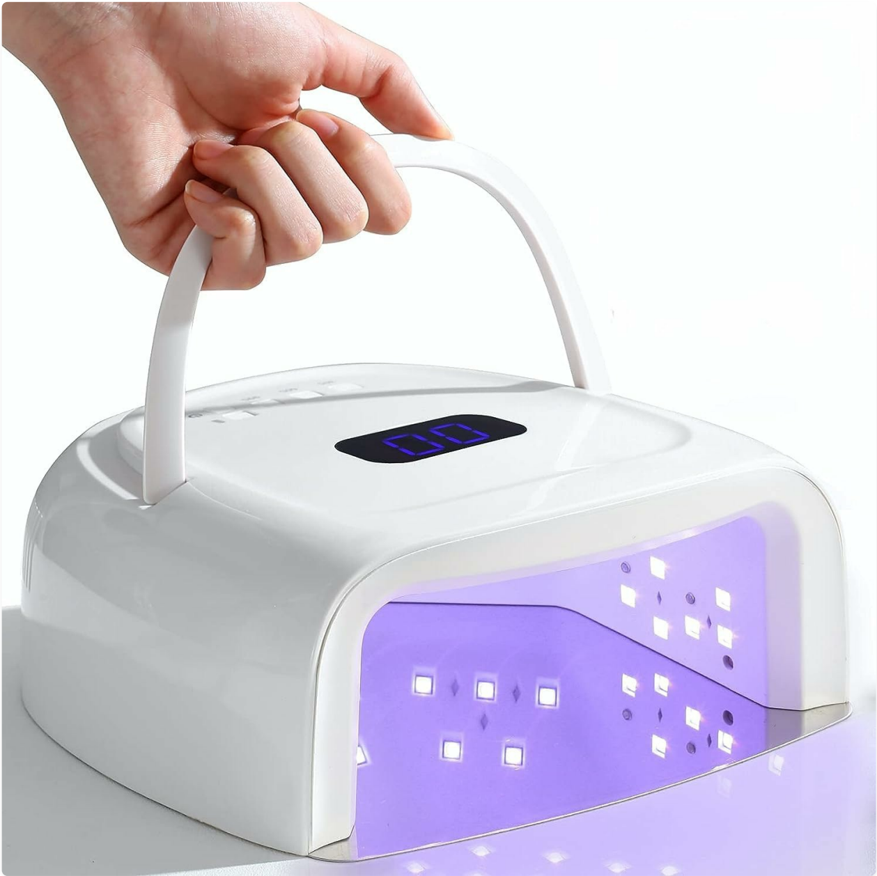
Image 1: Linssy 60W Rechargeable UV LED Nail Lamp. The lamp is white with a portable handle, showing the internal LED lights illuminated.