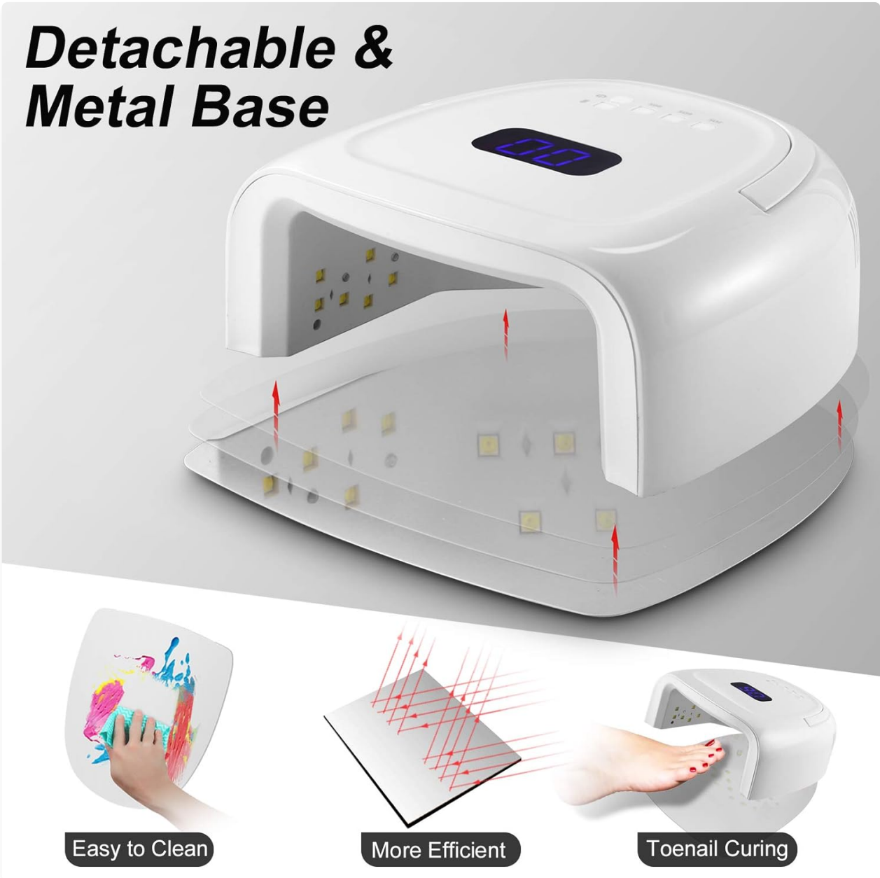
Image 5: The detachable magnetic base of the nail lamp, illustrating how it can be removed for easy cleaning and to facilitate toenail curing.