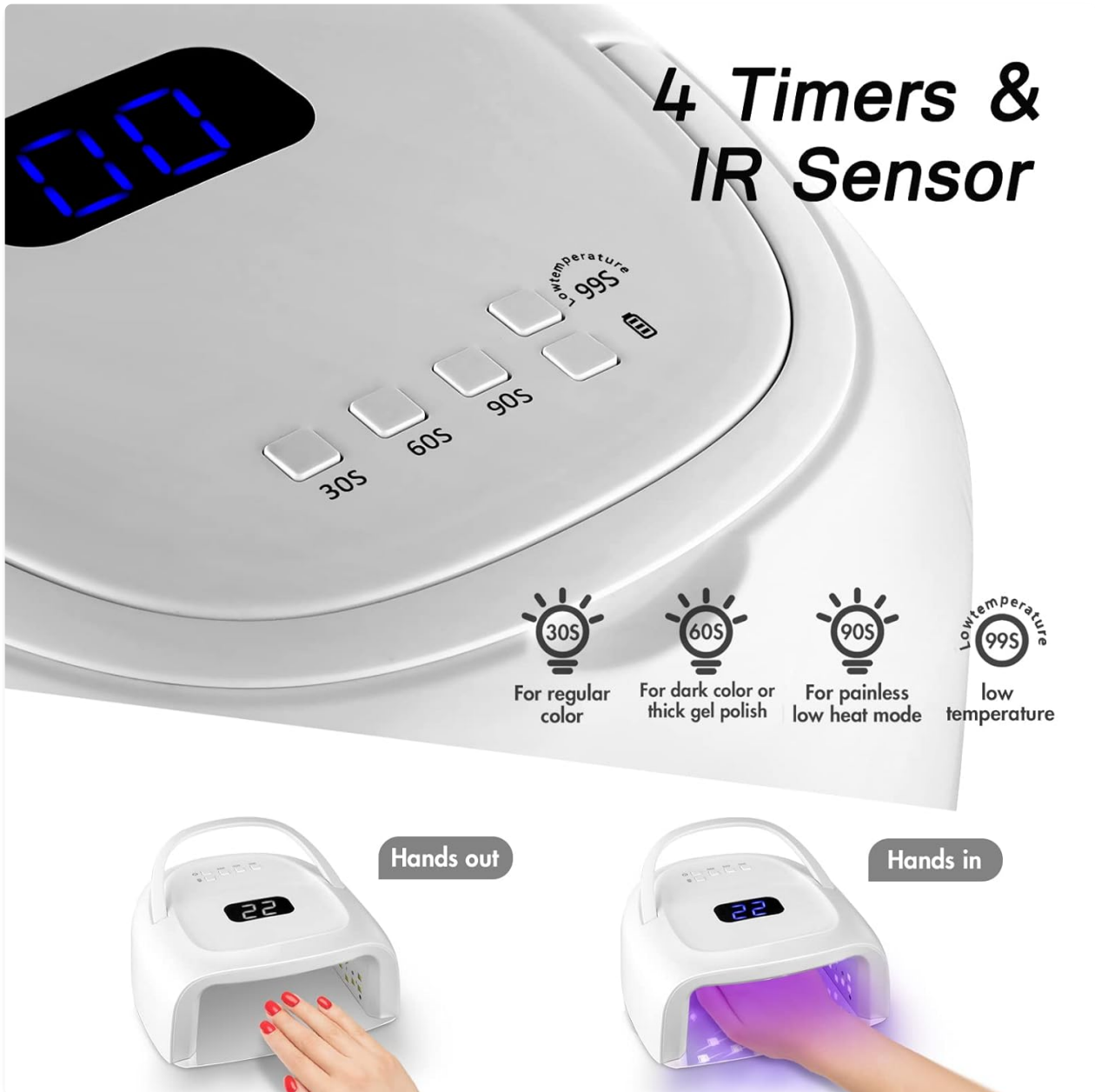
Image 4: Close-up view of the control panel, showing the 30s, 60s, 90s, and 99s timer buttons, along with an illustration of the infrared sensor in action.