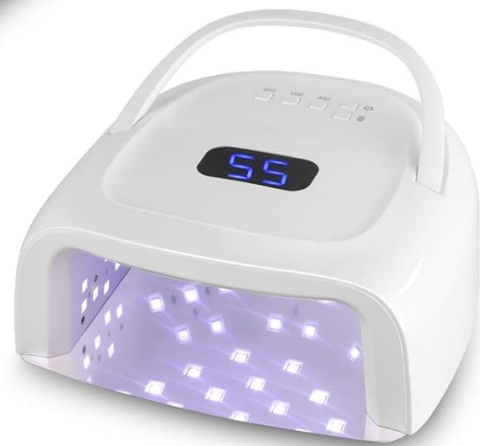
Image 3: Diagram illustrating the UV and LED light sources within the lamp, capable of curing various gel polish types including top coat, color coat, and base coat.