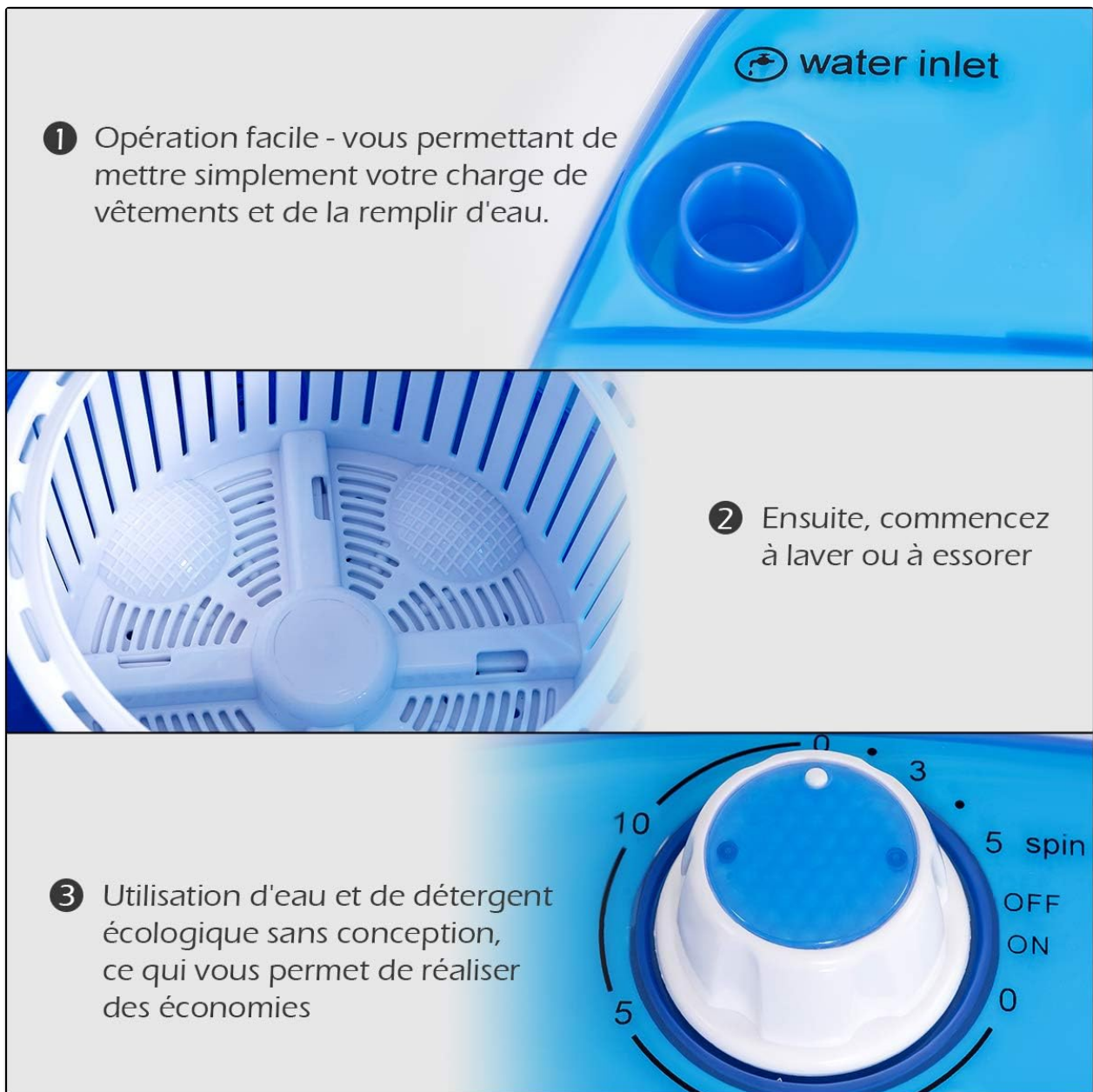
Image: The COSTWAY Mini Portable Washing Machine, a compact blue and white unit with a transparent lid, designed for small spaces.