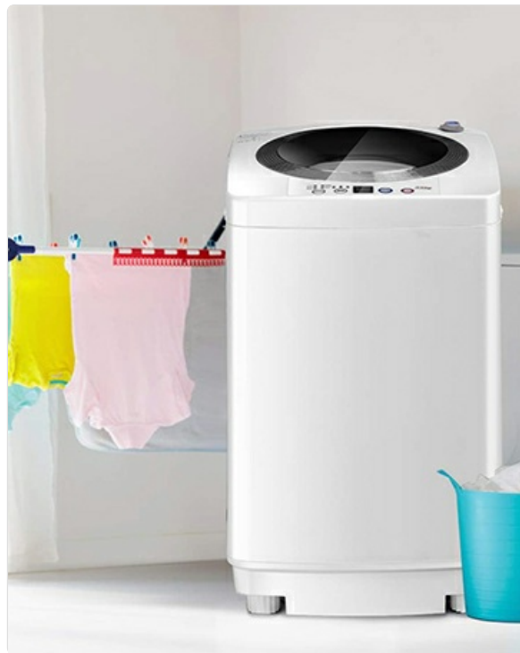
Image: A visual representation contrasting the washing process (clothes immersed in water) and the spin-drying process (clothes being spun to remove water).