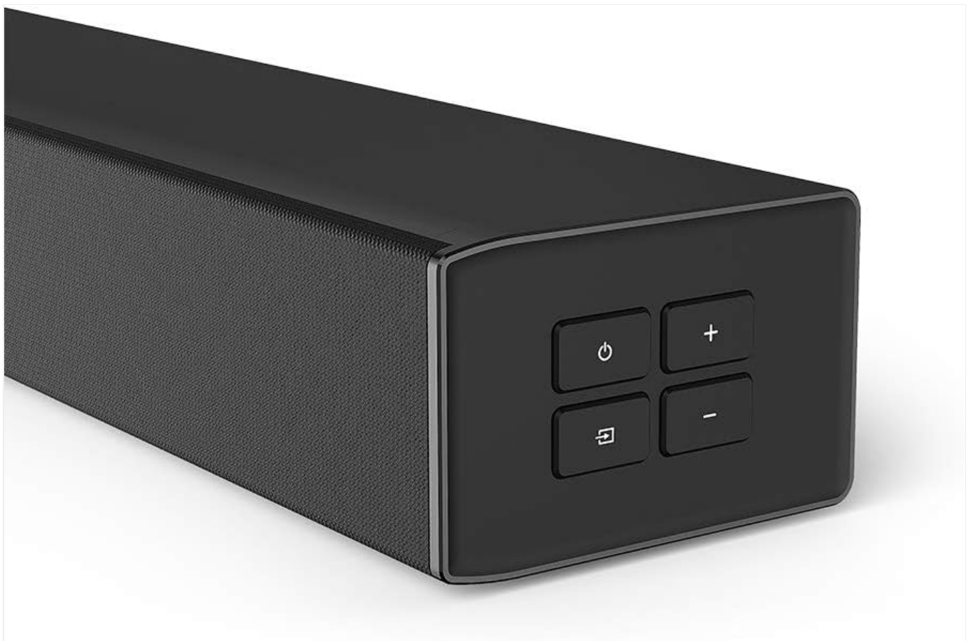
Figure 2: Top panel controls of the sound bar. These buttons allow for direct control of power, volume, and input source selection.