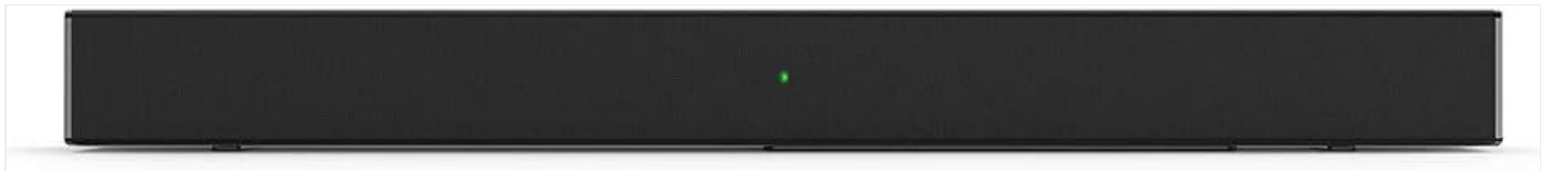
Figure 1: Front view of the TCL Alto 3 Sound Bar. The front features a minimalist design with a central LED indicator light.