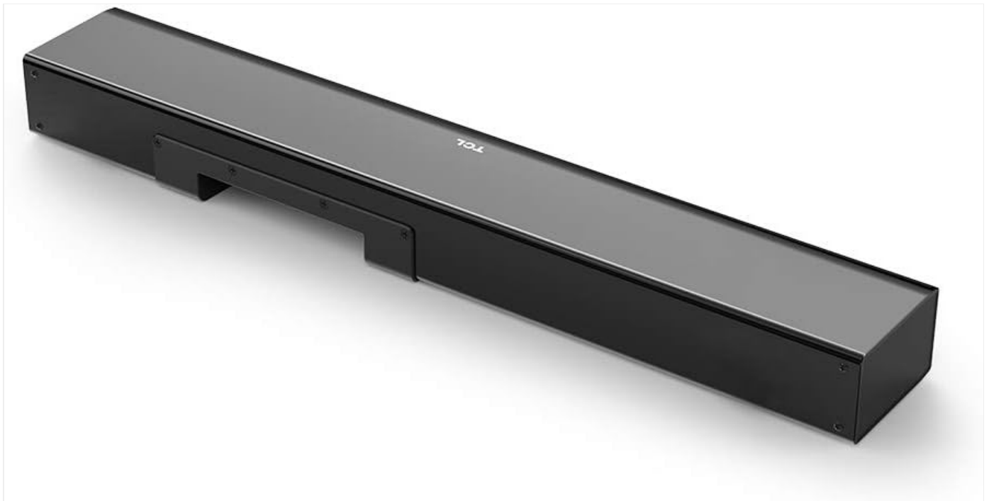
Figure 3: Rear panel of the sound bar, displaying the input ports for connecting to external devices.