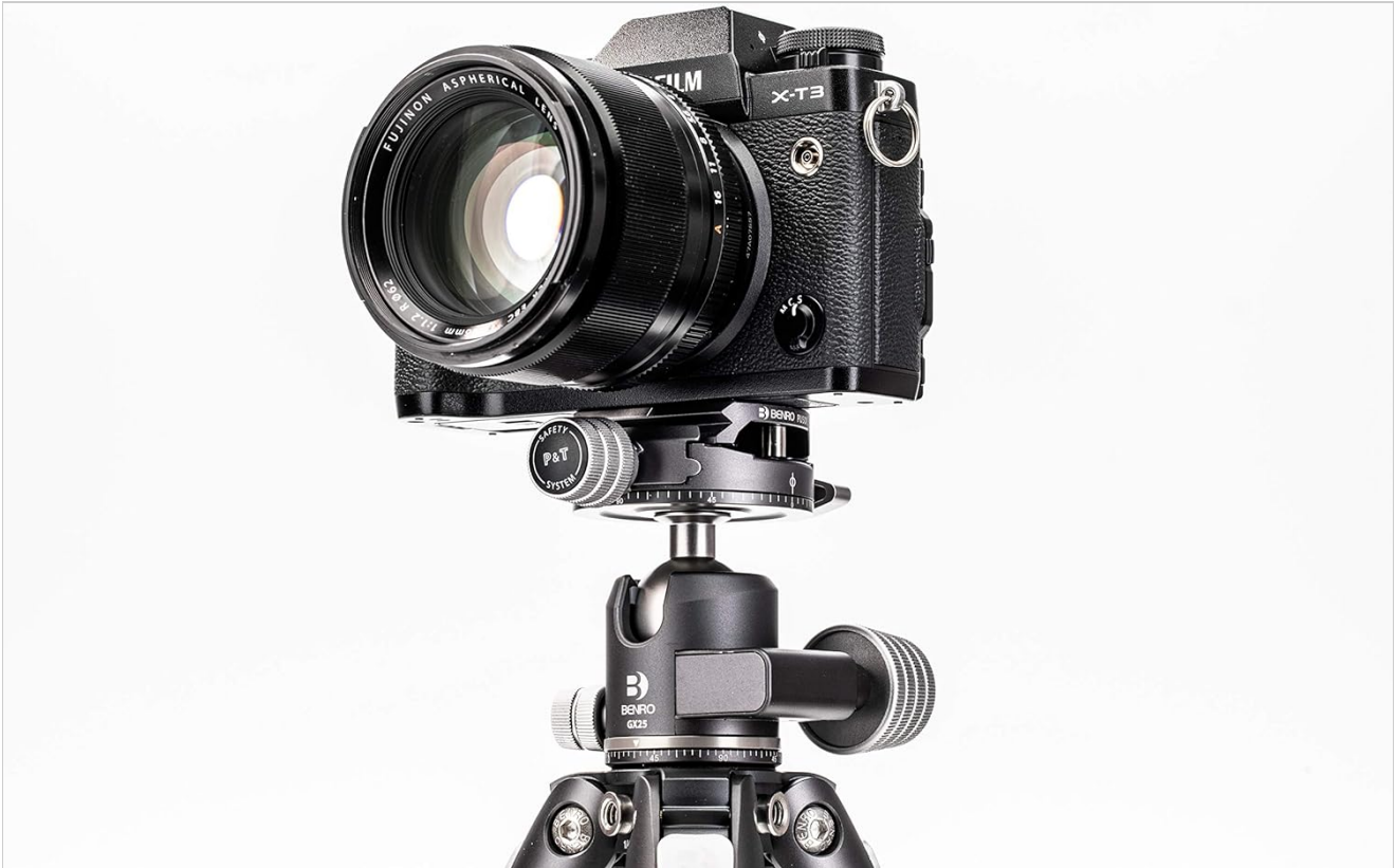
Figure 2.1: Tripod kit components including the tripod and its dedicated carry bag.