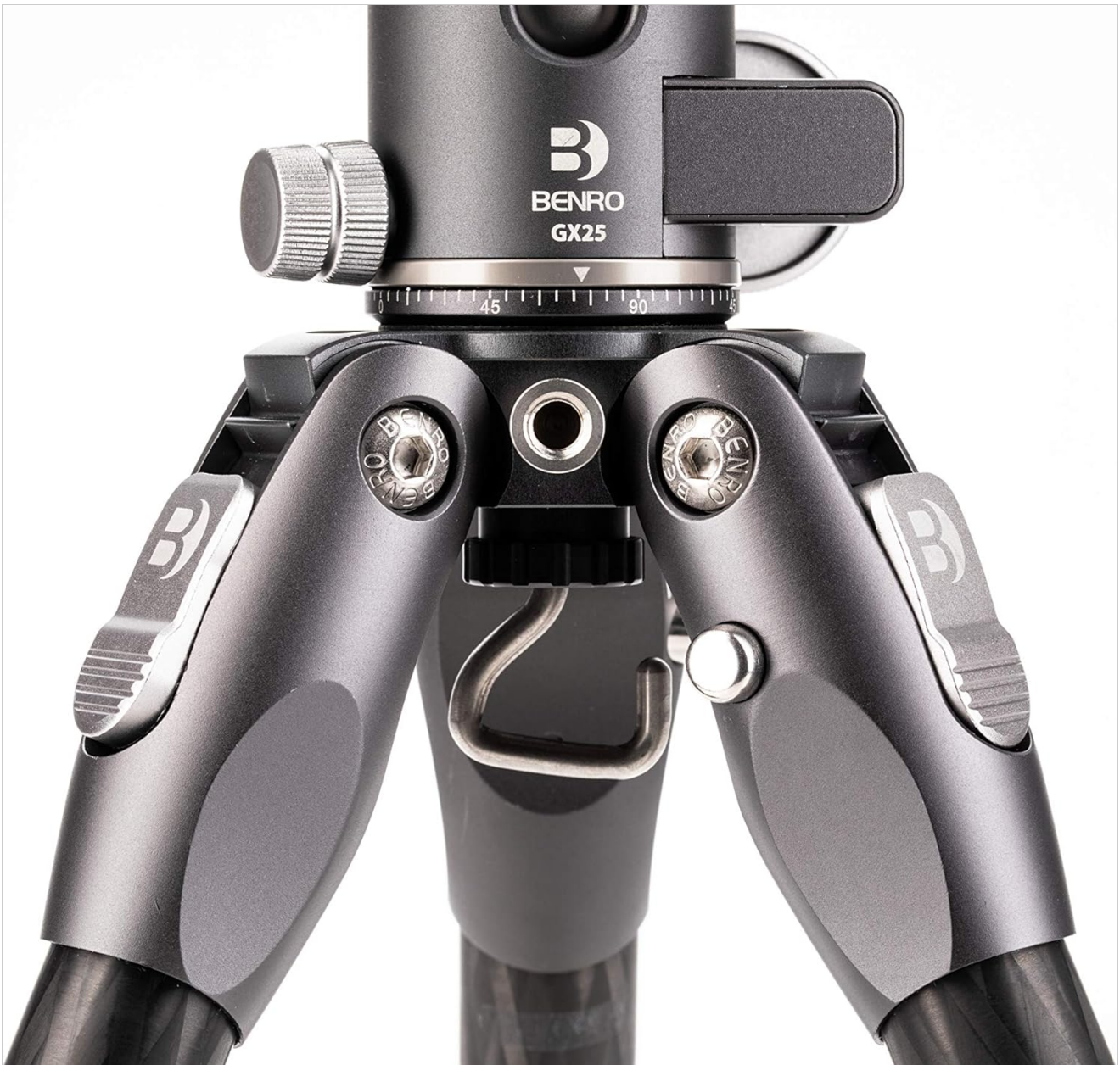
Figure 3.3: The leg spider showing the 1/4-20 accessory threads for attaching additional equipment.