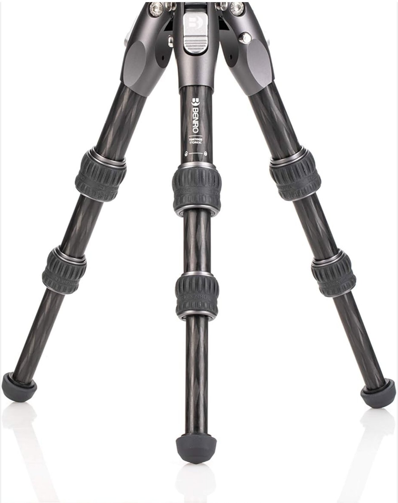
Figure 2.2: The Benro Tortoise TTOR03CGX25 Tripod Kit with legs fully extended and spread.