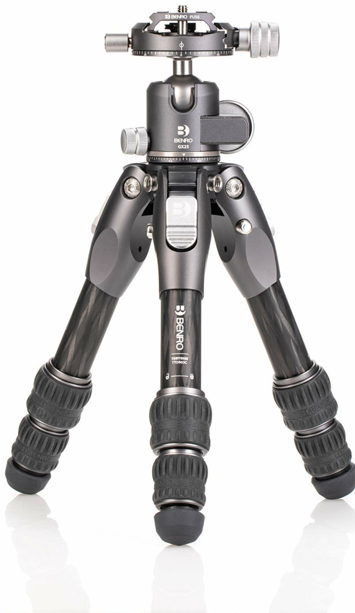
Figure 1.1: The Benro Tortoise TTOR03CGX25 Tripod Kit in its folded, compact state.