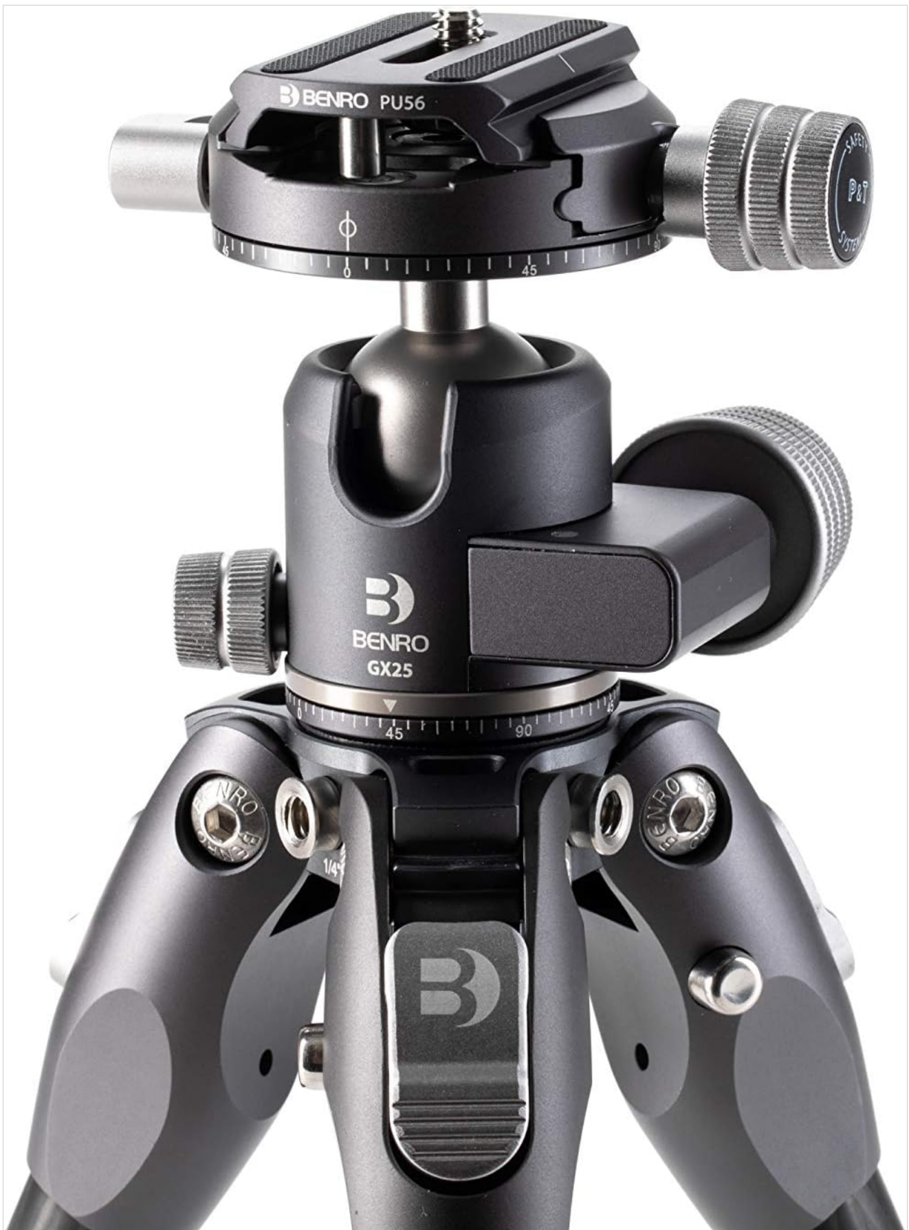
Figure 3.2: Detailed view of the GX25 ball head, highlighting the various control knobs for precise adjustments.