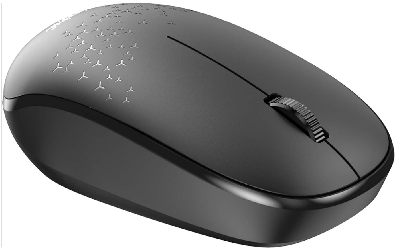
The INPHIC Bluetooth Mouse, a compact and ergonomic wireless mouse.

Thank you for choosing the INPHIC Bluetooth Mouse. This silent, wireless mouse offers dual-mode Bluetooth 5.0/3.0 connectivity, making it compatible with a wide range of devices including laptops, PCs, Macs, and iPads. Its mini, portable design and 1600DPI precision ensure a comfortable and efficient user experience. This manual provides detailed instructions for setup, operation, maintenance, and troubleshooting to help you get the most out of your new mouse.