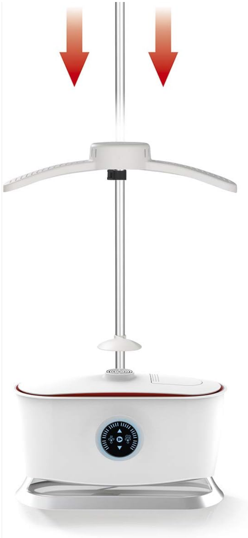
Figure 3: The adjustable telescopic rod, which allows for varying garment lengths and sizes.