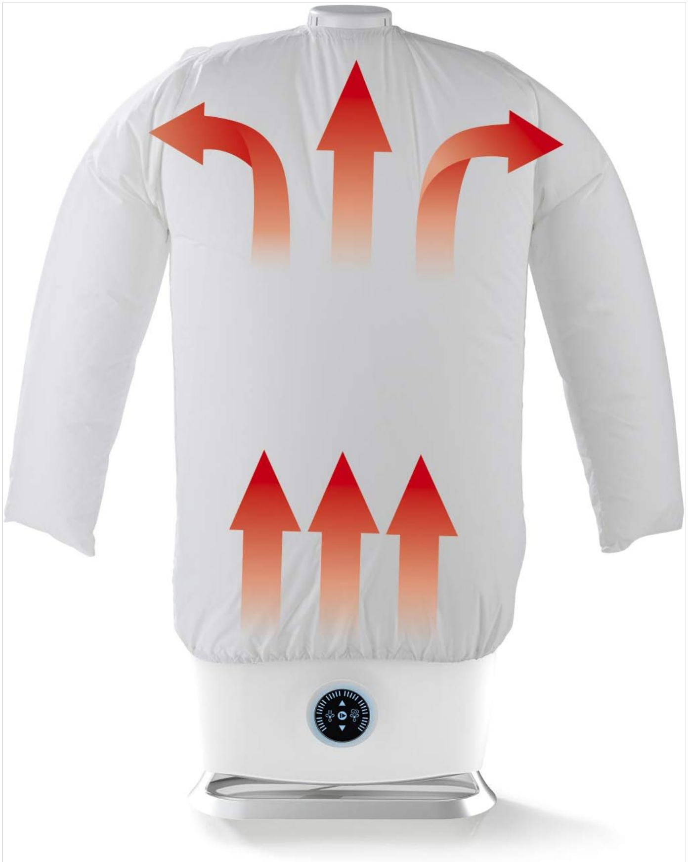
Figure 2: Rear view of the CLEANmaxx Automatic Drying and Ironing Machine, showing the inflated balloon body and indicating the direction of internal airflow.