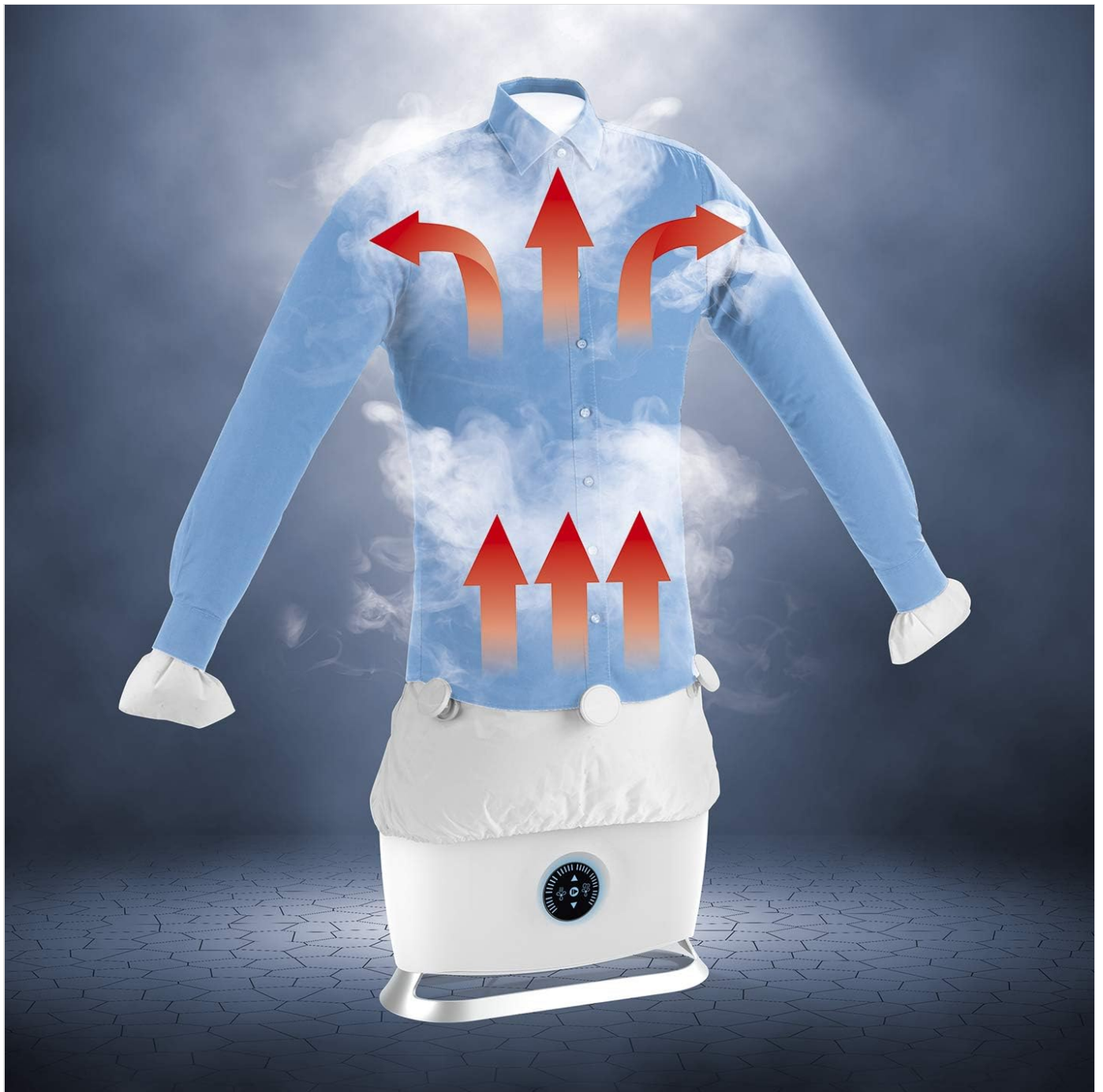
Figure 4: The machine in operation, demonstrating the steam and airflow within a garment to achieve wrinkle-free results.