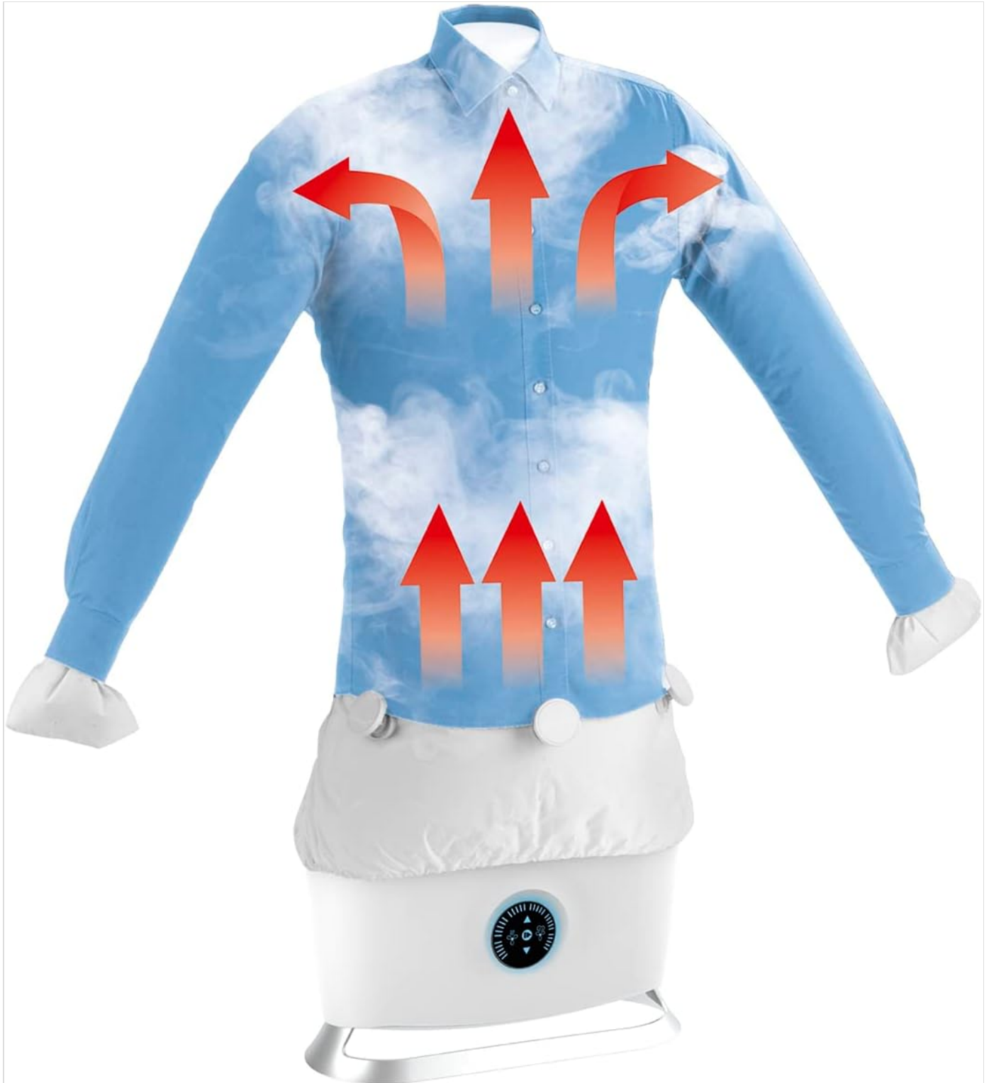
Figure 1: Front view of the CLEANmaxx Automatic Drying and Ironing Machine with a shirt mounted, illustrating the internal airflow and steam distribution for drying and ironing.

The CLEANmaxx Automatic Drying and Ironing Machine consists of a base motor unit, a telescopic rod, and a balloon body. The motor unit houses the heating and fan components, while the balloon body inflates to shape and dry garments. The touchscreen display on the motor unit allows for easy control of functions.