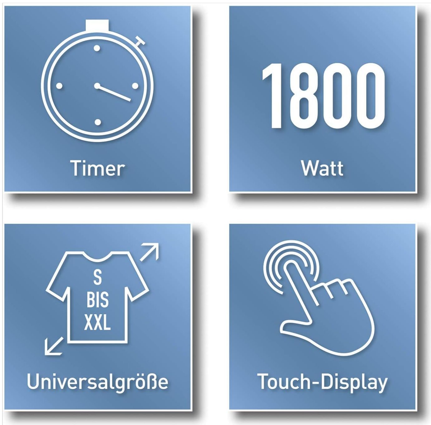
Figure 5: Key features of the CLEANmaxx machine: Timer function, 1800 Watt power, universal size compatibility (S-XXL), and a touch display for control.