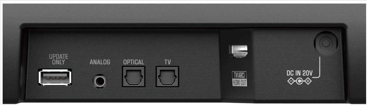
Image: A close-up view of the rear panel of the Yamaha SR-C20A sound bar, highlighting the various input ports including USB (for update only), Analog, Optical, TV (HDMI ARC), and DC IN 20V power input.