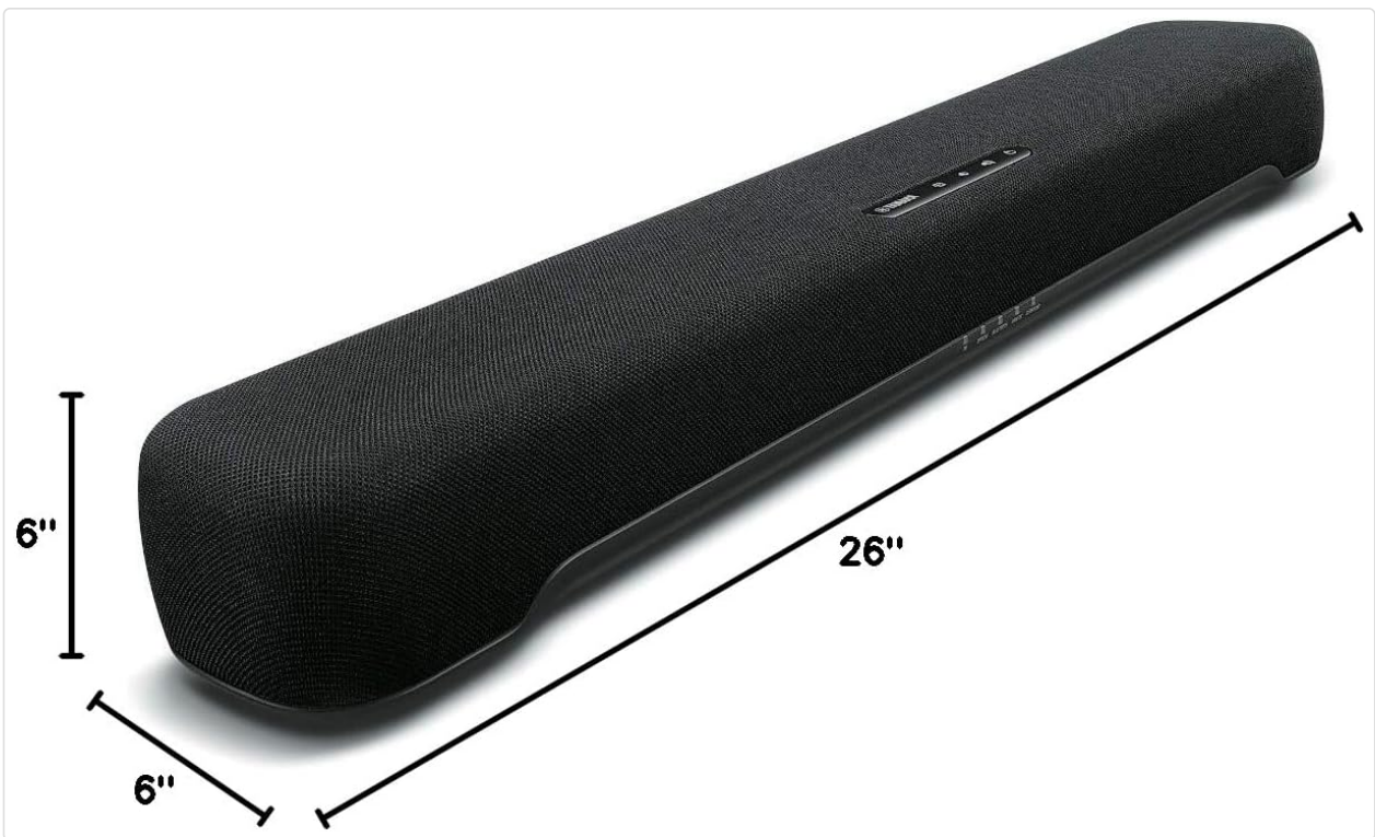
Image: An overhead view of the Yamaha SR-C20A sound bar with dimension labels indicating a depth of 6 inches, a width of 26 inches, and a height of 6 inches.