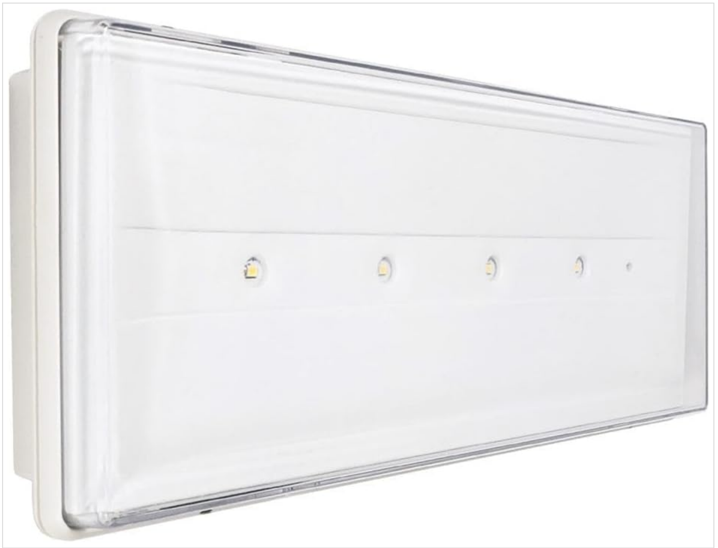
Figure 1: Front view of the Beghelli Emergency LED Lamp. The lamp features a white base and a transparent polycarbonate cover, revealing the LED light source inside.